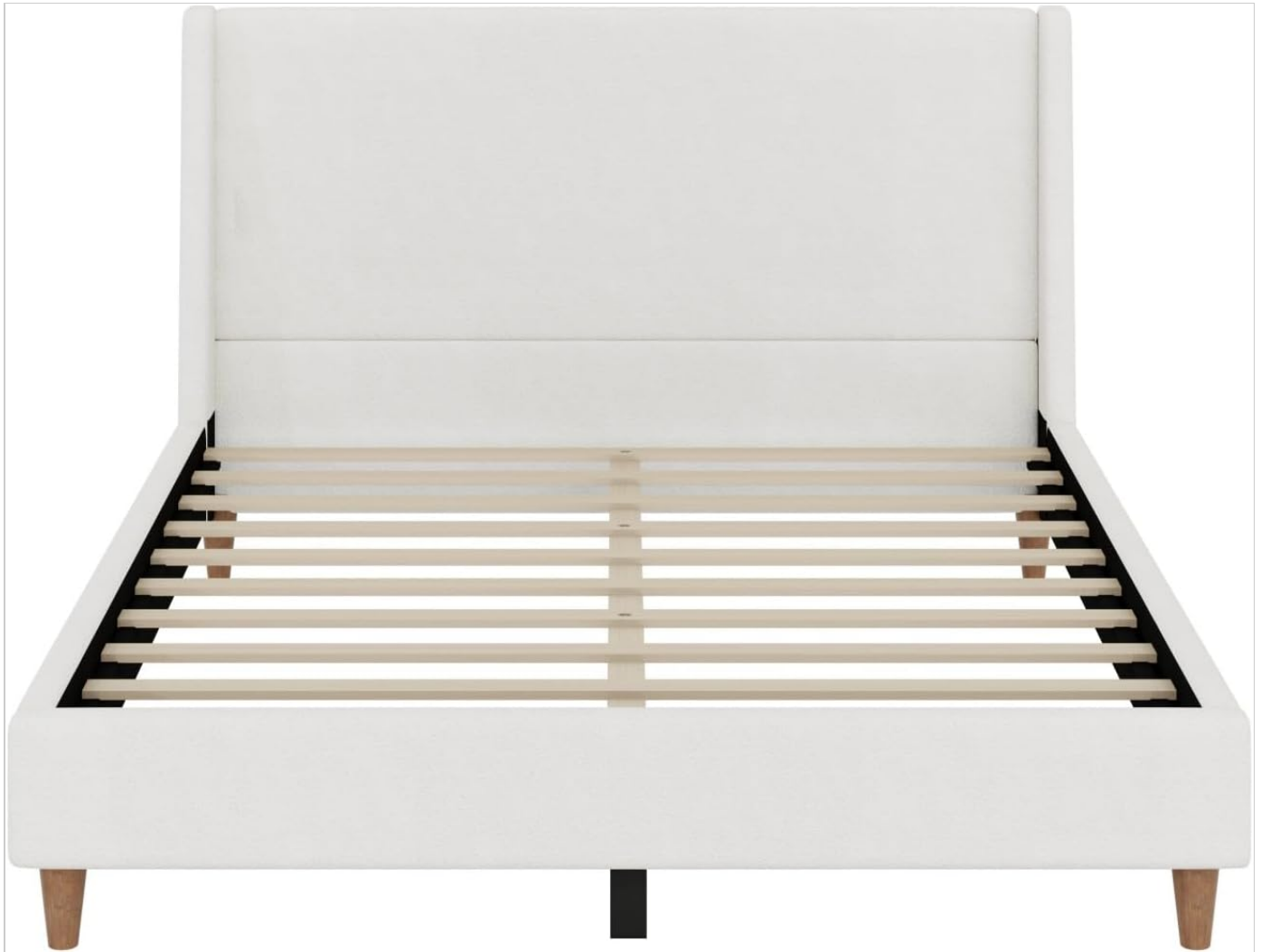
Figure 2: Front view of the assembled bed frame, showcasing the wooden slats and center support leg.