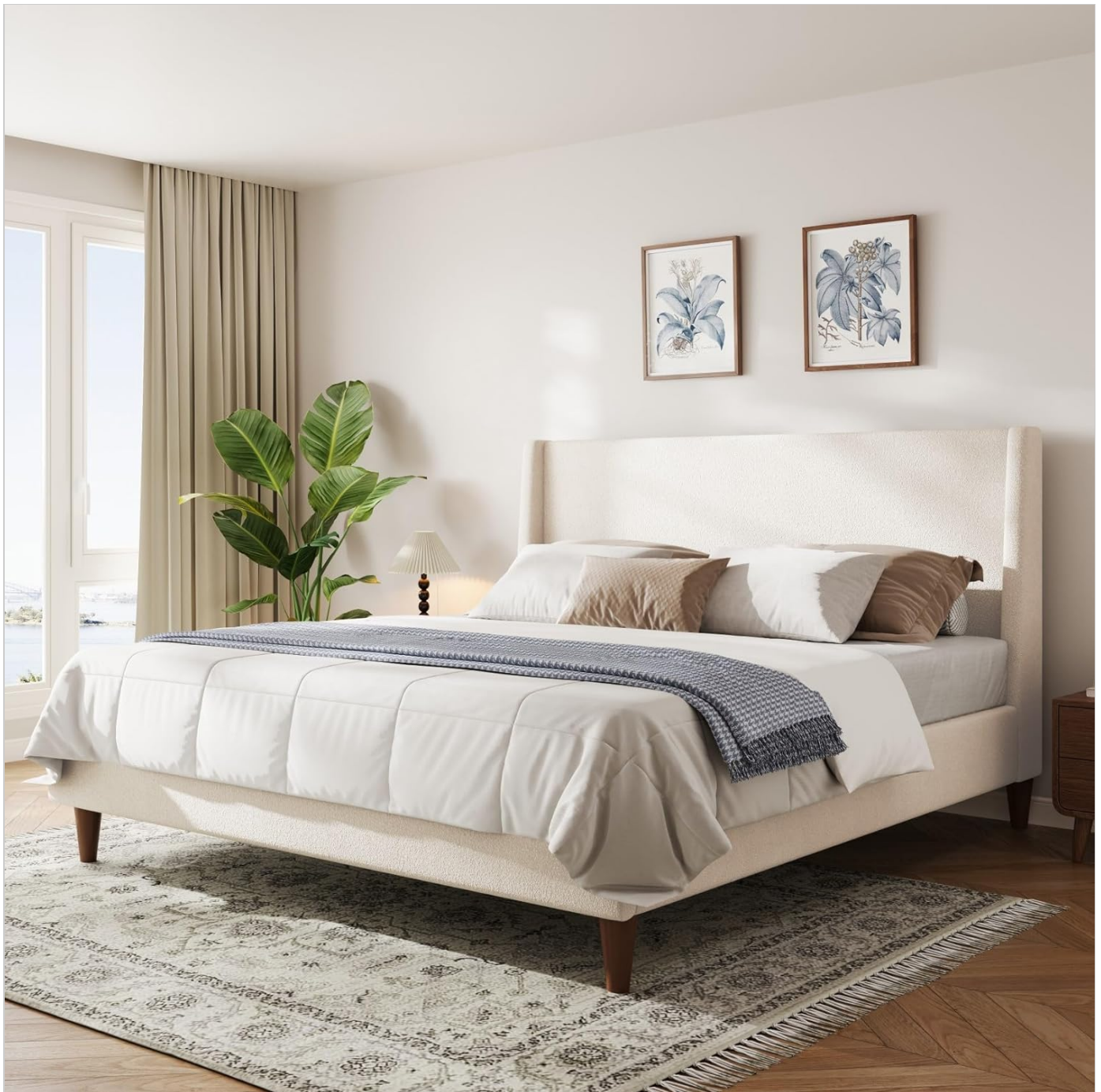
Figure 4: The Merax bed frame with a mattress and bedding, demonstrating its intended use.