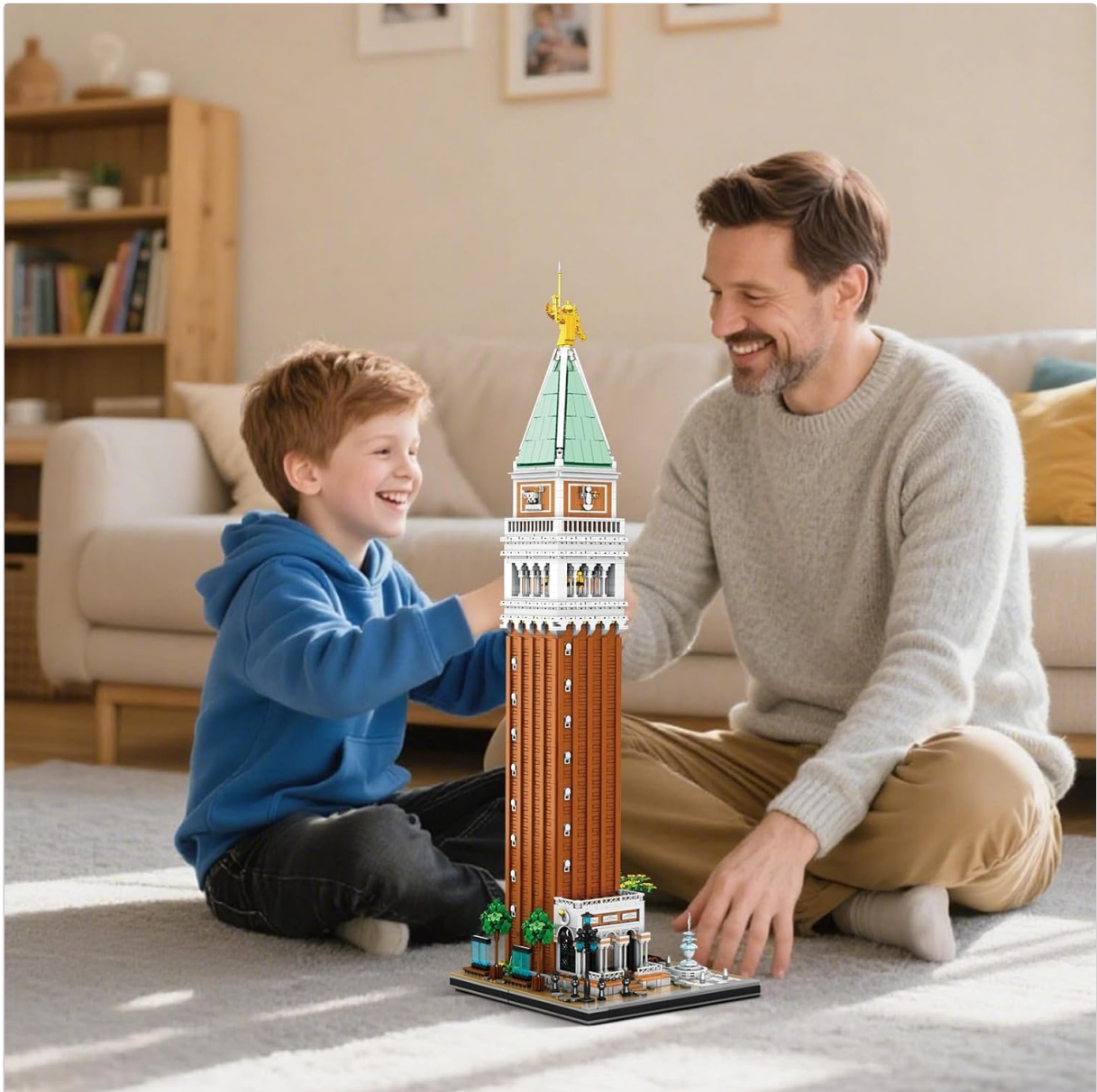
Image 4.1: An example of the assembly process, highlighting the engaging nature of building the model.