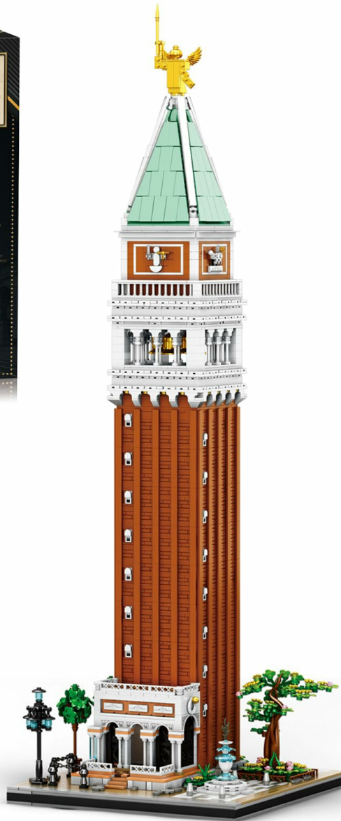
Image 1.1: The fully assembled Reobrix St. Mark's Campanile model, showcasing its impressive height and detailed architecture.