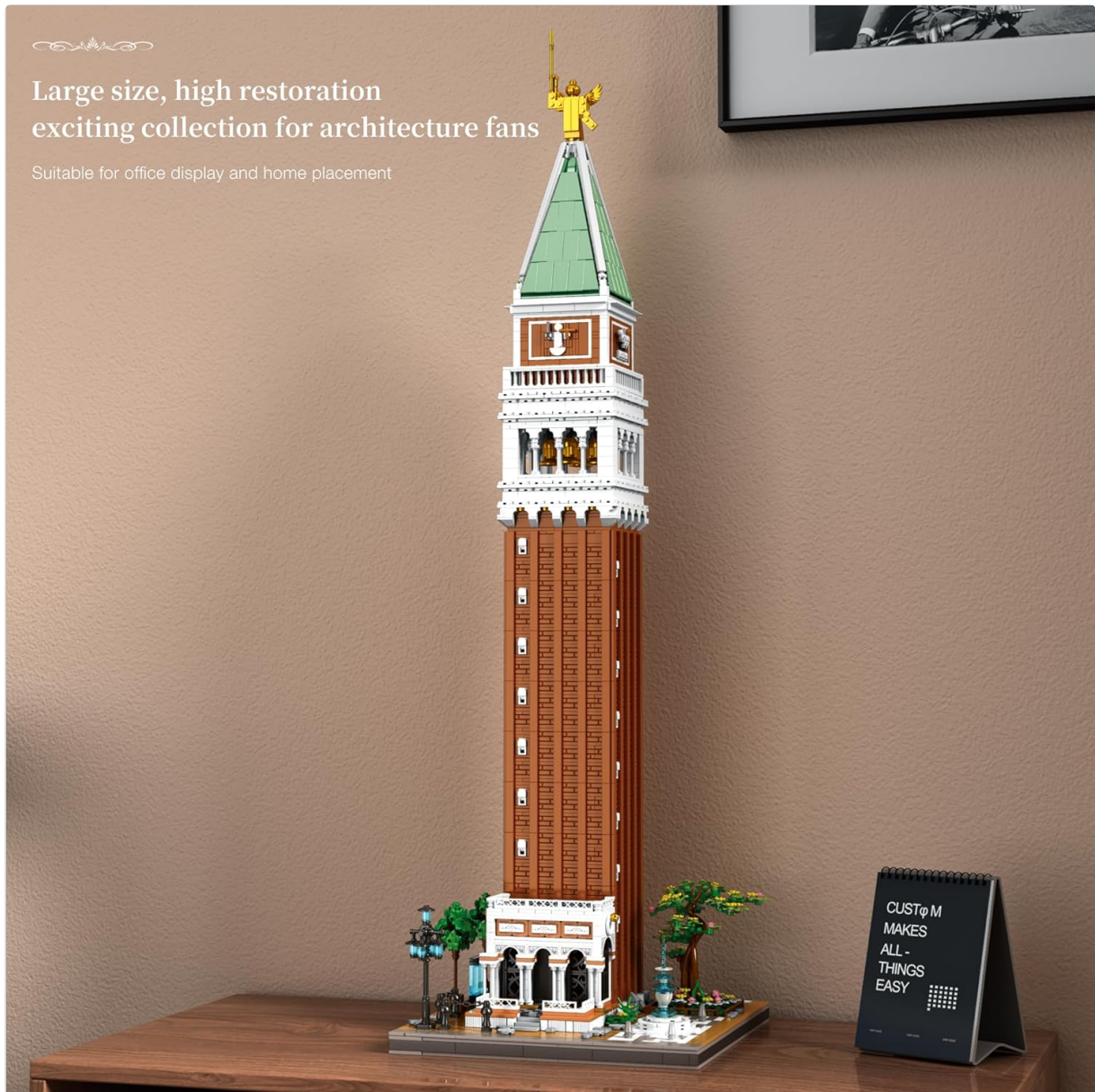
Image 5.1: The completed model displayed as an architectural showpiece in an office or home setting.

Suitable for office display and home placement