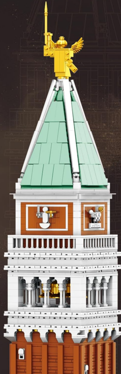
Image 4.2: Detailed view of the upper structure of the St. Mark's Campanile model, including the bell tower and square building section.

The structure of St. Mark's Campanile is simple, the lower part is a huge columnar building made of bricks, and the upper part is an arched bell tower, total 5 bells, above the arched bell tower is a square building, and the outer walls are decorated with lion and allegorical figures of Venice.