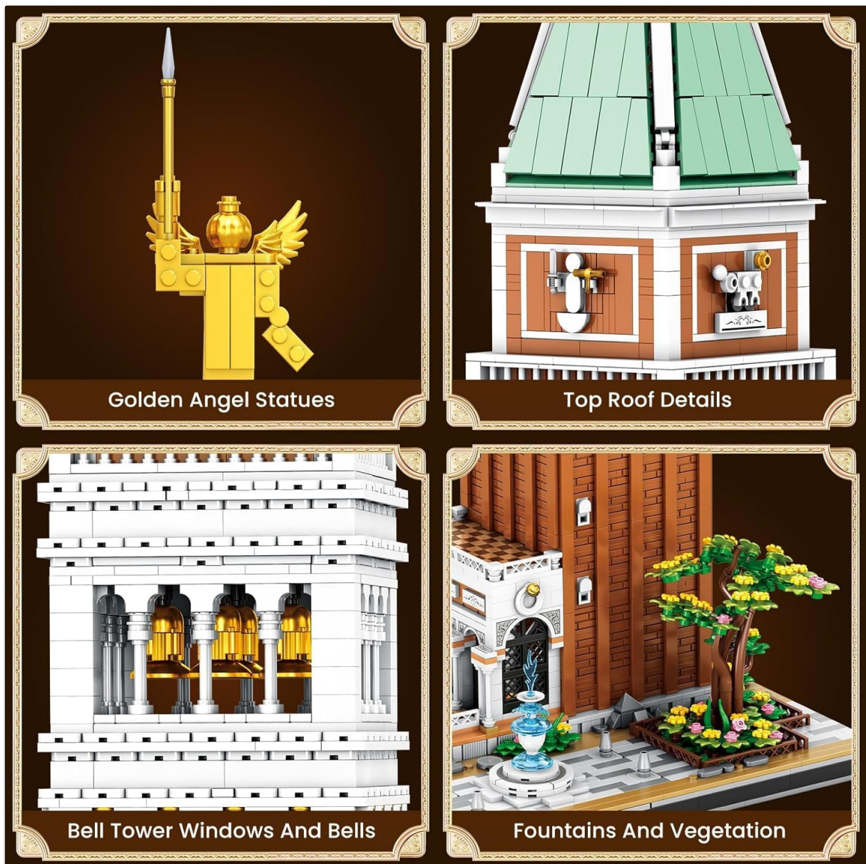
Image 4.3: Close-up details of the model, including the golden angel statue, roof, bell tower windows, and surrounding landscape elements like fountains and trees.