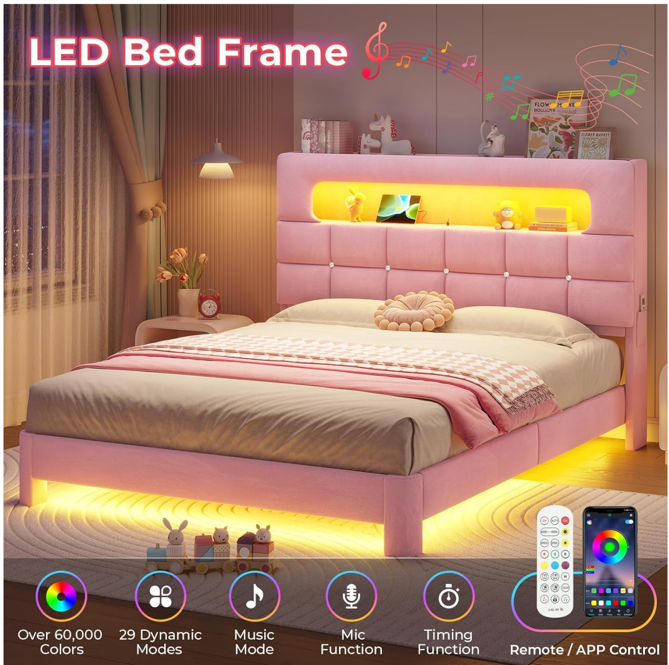
Image: The MSmask LED bed frame illuminated with RGB lights, illustrating control options via remote and mobile application, along with features like music sync and dynamic modes.