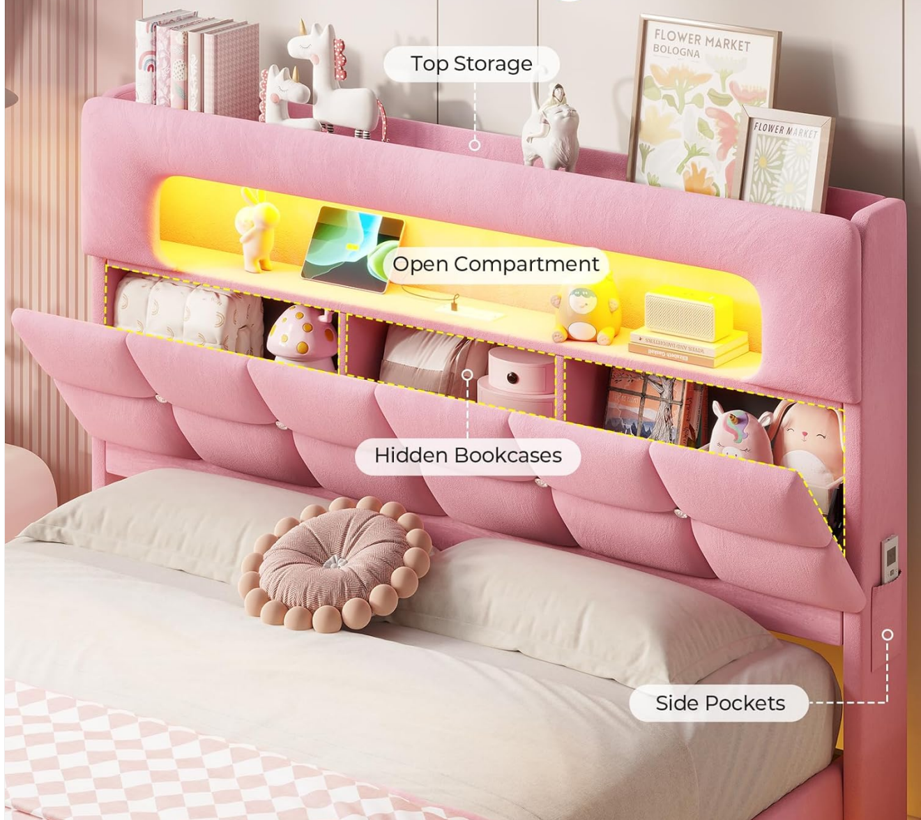
Image: The multifunctional storage headboard of the MSmask bed frame, illustrating its open compartment, hidden bookcases, and side pockets for organization.