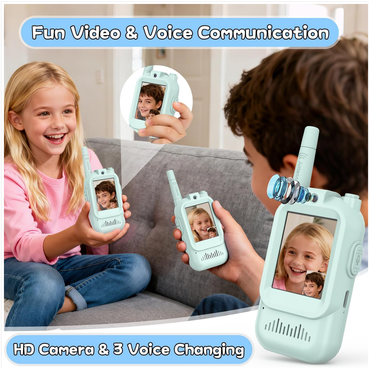
Image 6.1: Children demonstrating voice and video communication with the walkie talkies.