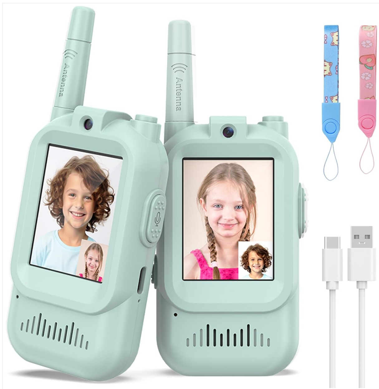
Image 3.1: Package contents including two walkie talkies, charging cables, and lanyards.