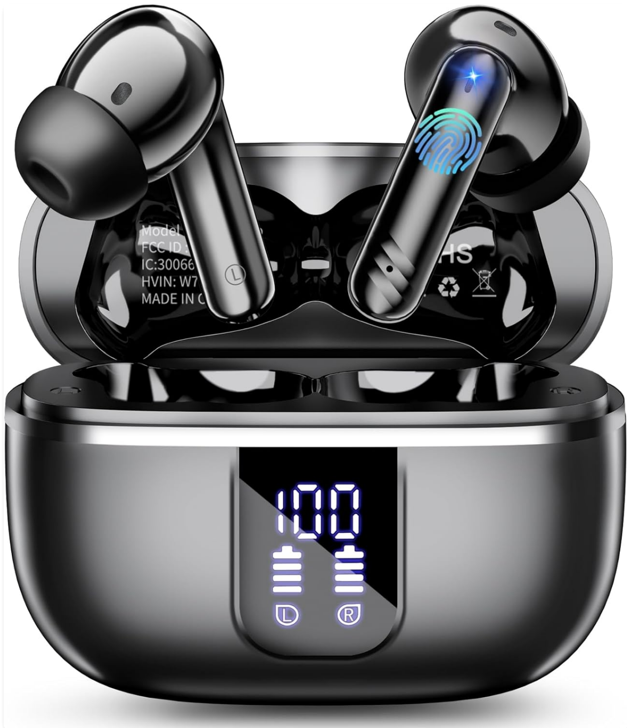
Image 1.1: OWMSIC W70 Pro Bluetooth Wireless Earbuds in their charging case.