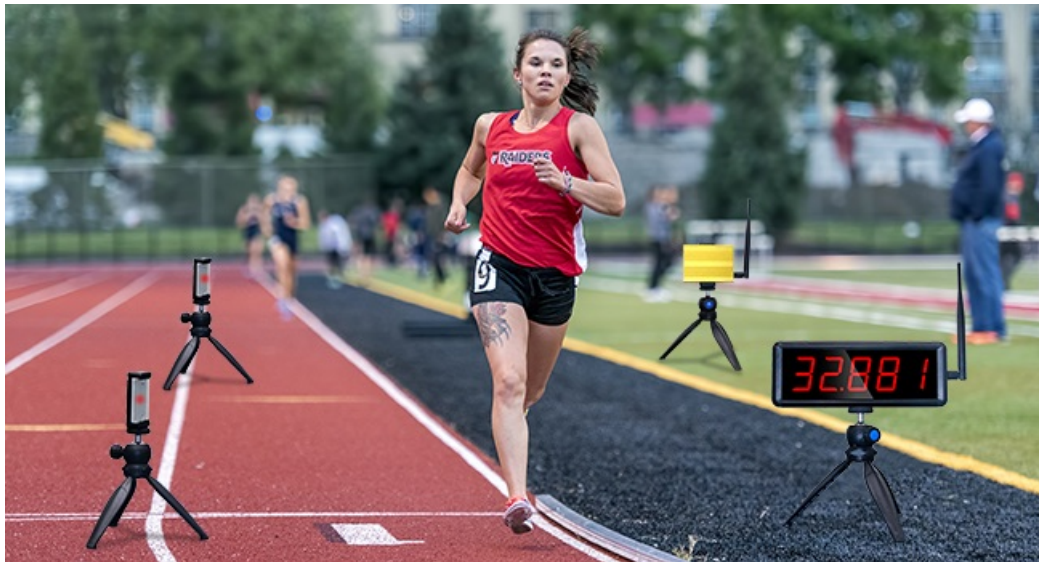
An athlete in motion, demonstrating the timer's use during a sprint on a track.