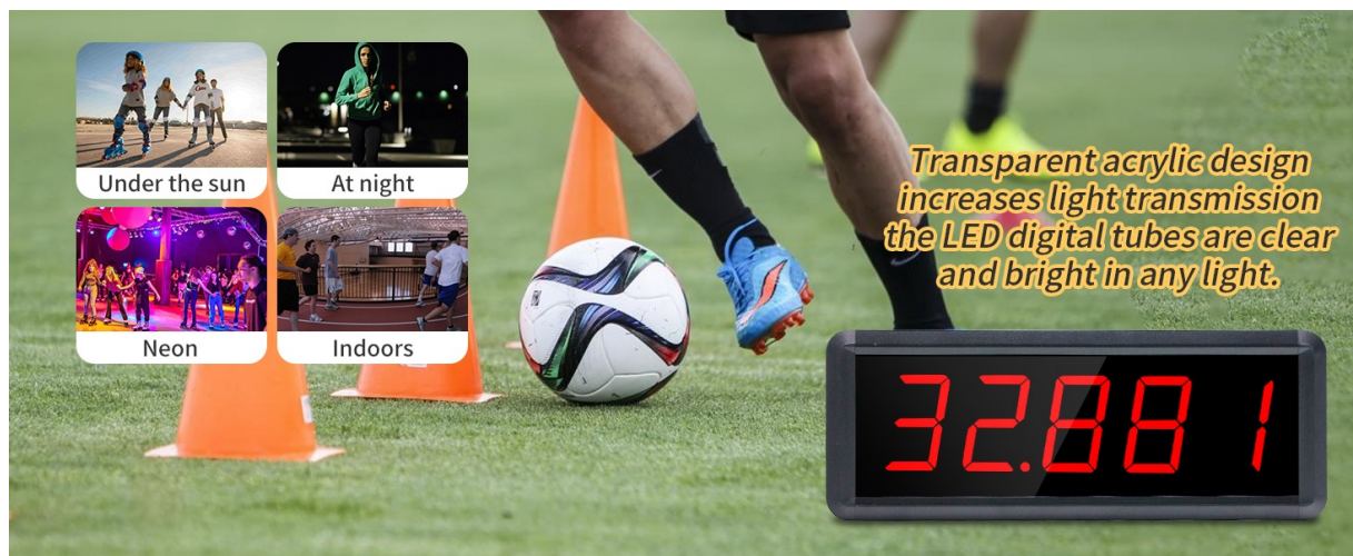
The clear and bright LED digital display, visible in various lighting conditions.

Video: Ousmile Operation of laser timer. This video demonstrates the timer in action, showing how it starts and stops automatically.