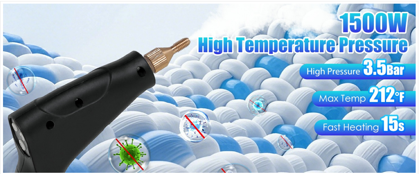
Figure 4.1: Key features of the TeqHome Handheld Steam Cleaner.