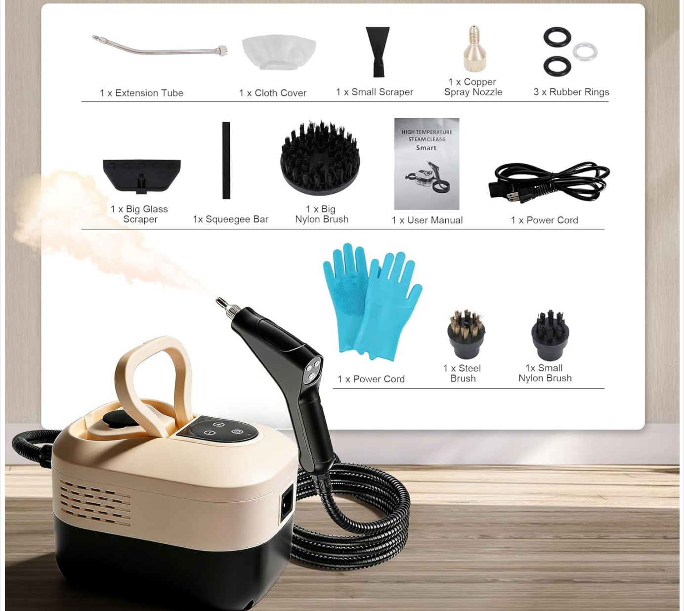
Figure 3.1: All included accessories for the TeqHome 1500W Handheld Steam Cleaner.