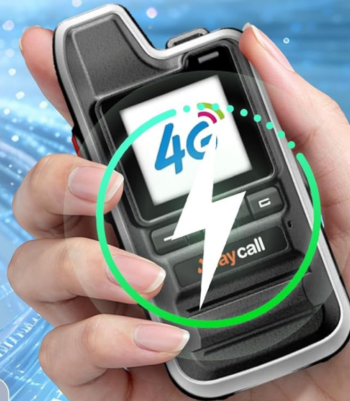
Figure 4.2: Charging options for the walkie talkie.