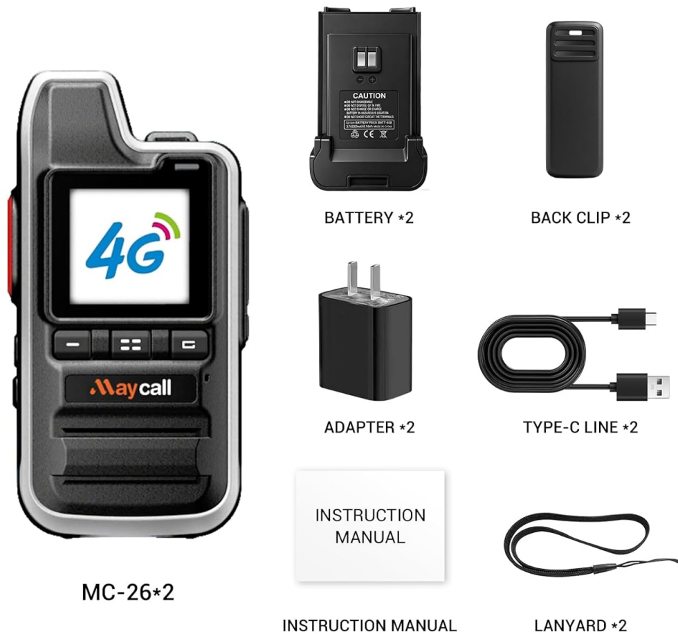
Figure 2.1: Contents of the Maycall MC-26 Walkie Talkie package.