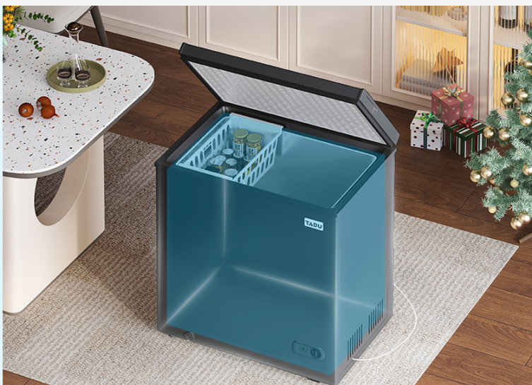
Image 5.2: The spacious interior and removable basket for organized storage.

Despite its small size, this chest freezer boasts a large capacity, allowing you to store plenty of frozen foods, including meats, vegetables, fruits, and more.