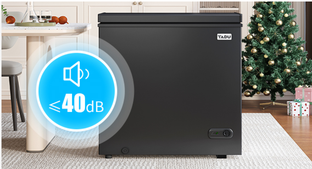
Image 5.3: The freezer operates quietly, with noise levels below 40dB.