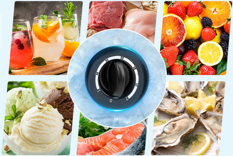
Image 6.1: The 7-level temperature control dial for precise freezing.