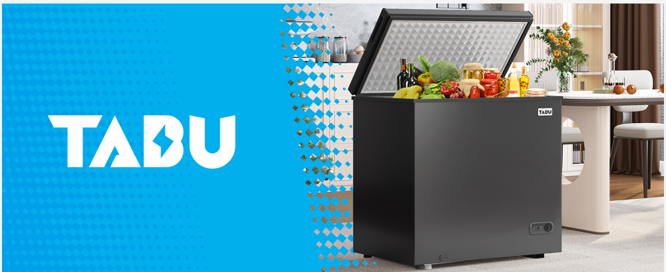
Image 1.1: The TABU 7 Cubic Feet Chest Deep Freezer in a kitchen environment.

This chest freezer is designed to provide reliable frozen food storage with adjustable temperature control and a convenient removable storage basket.