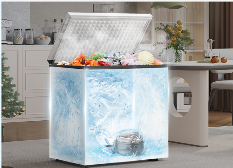
Image 5.1: Advanced Cooling Technology ensures efficient freezing.

Equipped with cutting-edge rapid cooling technology, this freezer swiftly lowers temperatures, effectively locking in nutrients and flavors.