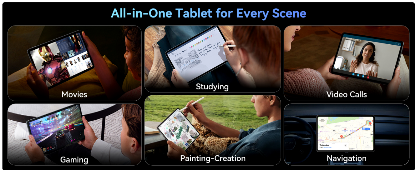
Figure 3: Widevine L1 certification allows for true 2K+ streaming on popular platforms.

The Nexall N90 is Widevine L1 certified, enabling high-definition streaming on platforms like Netflix, Prime Video, and more. The 12-inch 2K display and dual speakers provide an immersive entertainment experience.