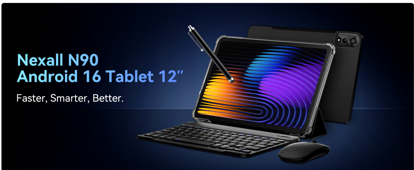
Figure 2: Android 16 offers smoother performance, smarter experience, and enhanced privacy.