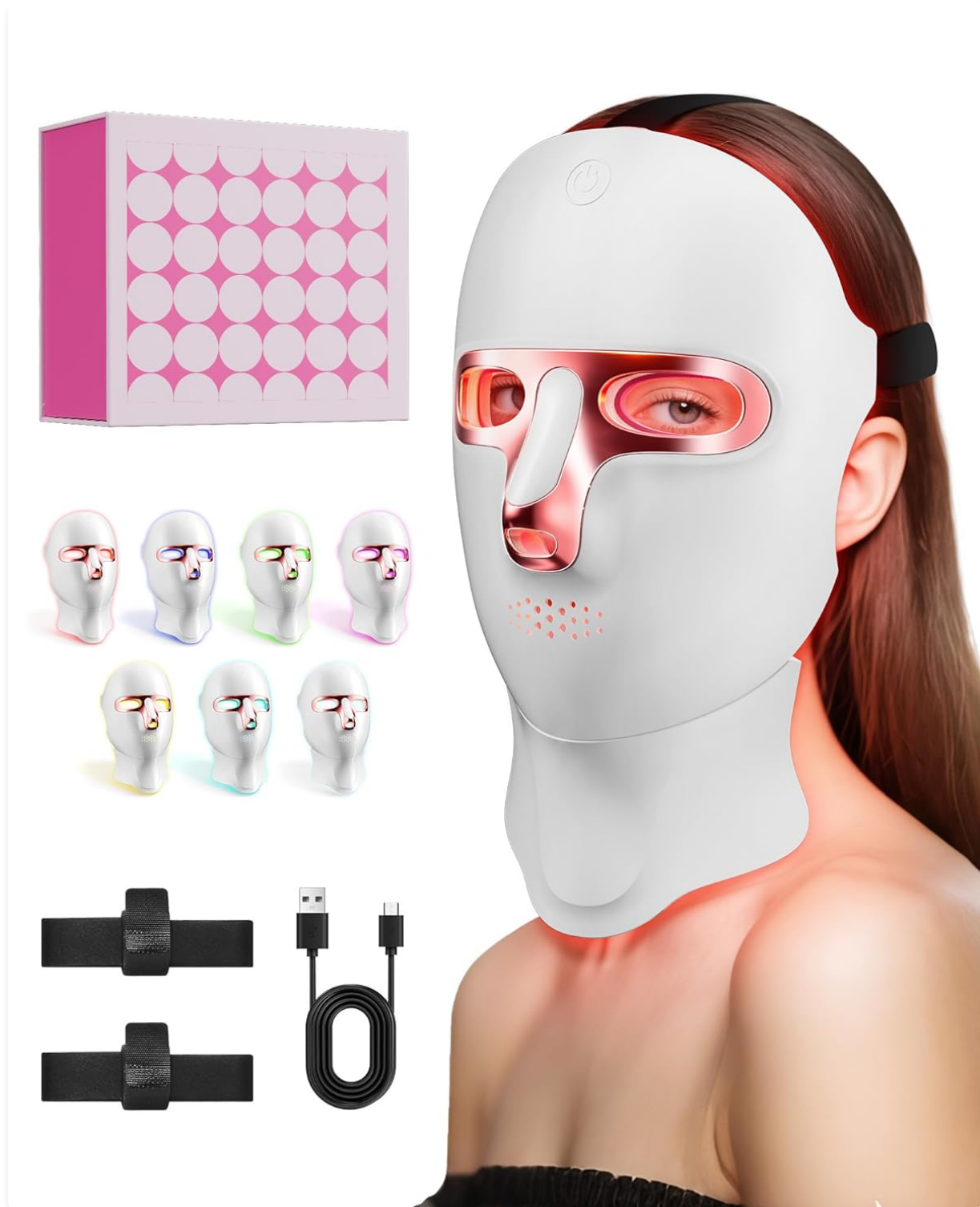
Figure 1: Components of the FOLOKE LED Light Therapy Mask, including the main mask, detachable neck piece, adjustable straps, and USB-C charging cable.