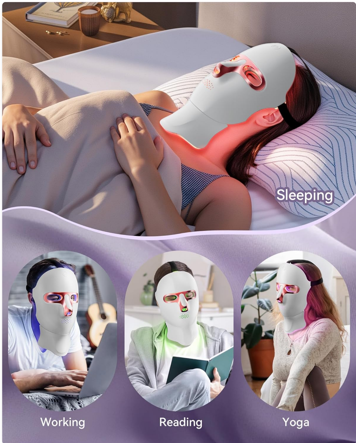
Figure 2: The cordless design allows for flexible use during daily activities such as working, reading, yoga, or simply relaxing.

Your browser does not support the video tag.