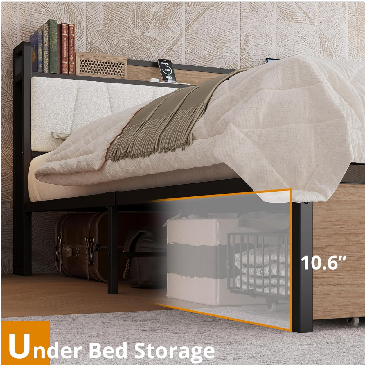
Figure 5: The bed frame offers 10.6 inches of clearance for additional under-bed storage, even with the drawers in place.