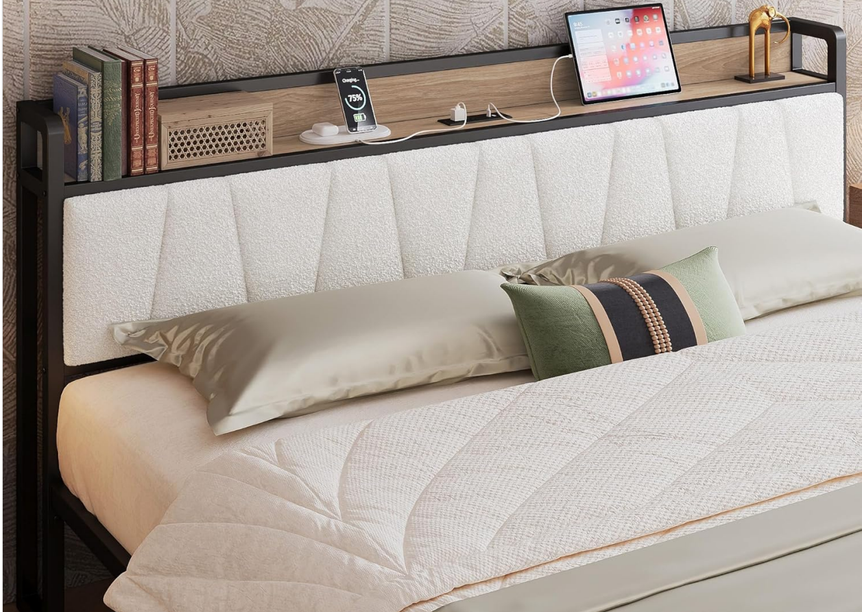
Figure 3: The upholstered headboard features a convenient shelf and a built-in charging station with USB ports and AC outlets.