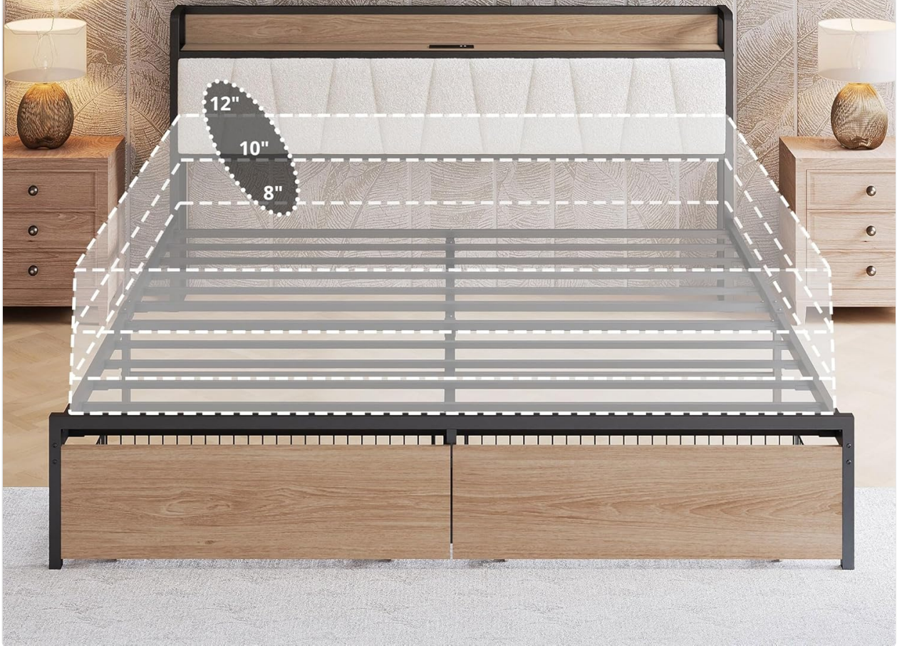
Figure 2: Detail of the solid and stable metal frame construction, highlighting the slat supports that eliminate the need for a box spring.