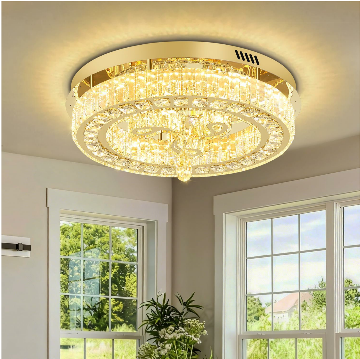
Image 1.1: The IDEQUY 20-inch Gold Modern Crystal LED Dimmable Flush Mount Chandelier installed in a living room setting.