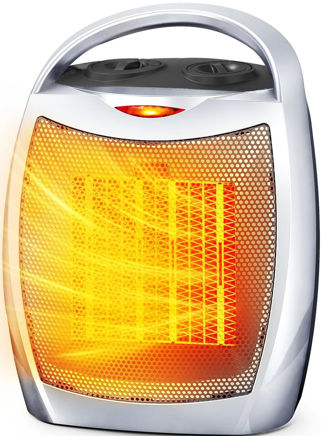
Image: Front view of the Electactic H36902 Portable Ceramic Space Heater.