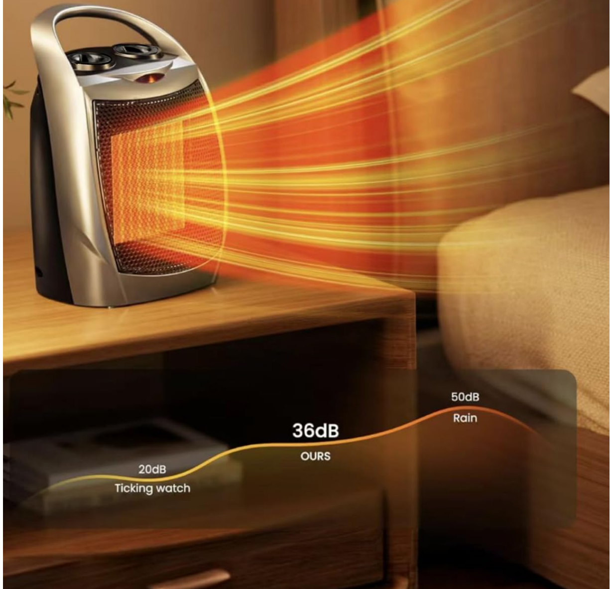
Image: Heater on a desk, illustrating its compact size and dimensions.