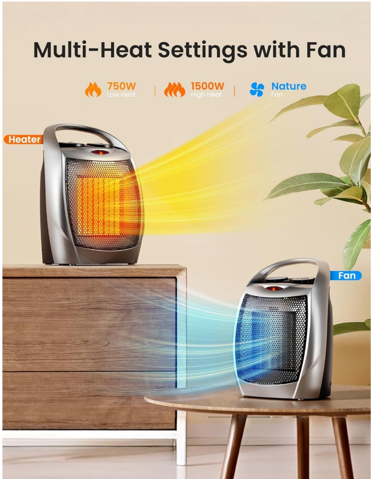
Image: Heater operating in a room, highlighting its coverage and control knobs.

The Electactic H36902 features two control knobs on the top for easy operation.