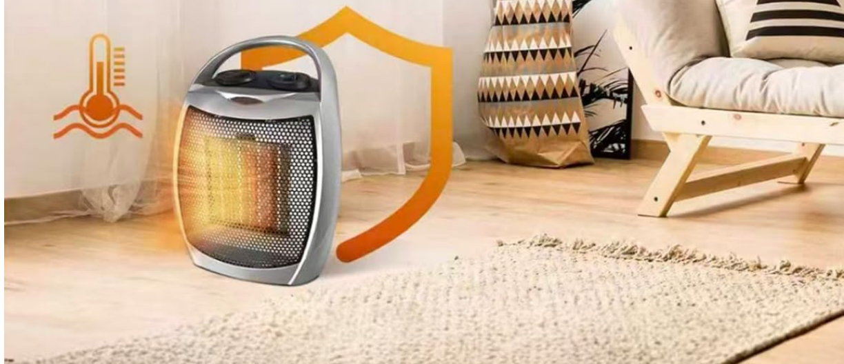
Image: Illustration showing the heater's rapid 2-second heating feature.