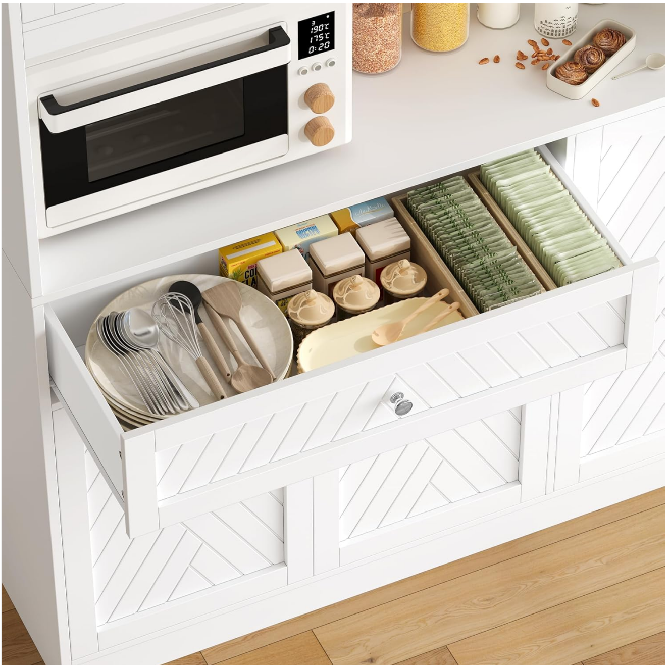
Figure 4: The spacious pull-out drawer, demonstrating its capacity for organizing cutlery, tea bags, and other small kitchen essentials.

Video 1: An official product video showcasing the various features and storage capabilities of the BOTLOG 72-inch Tall Kitchen Pantry Storage Cabinet, including adjustable shelves, spacious drawers, and soft-close doors.