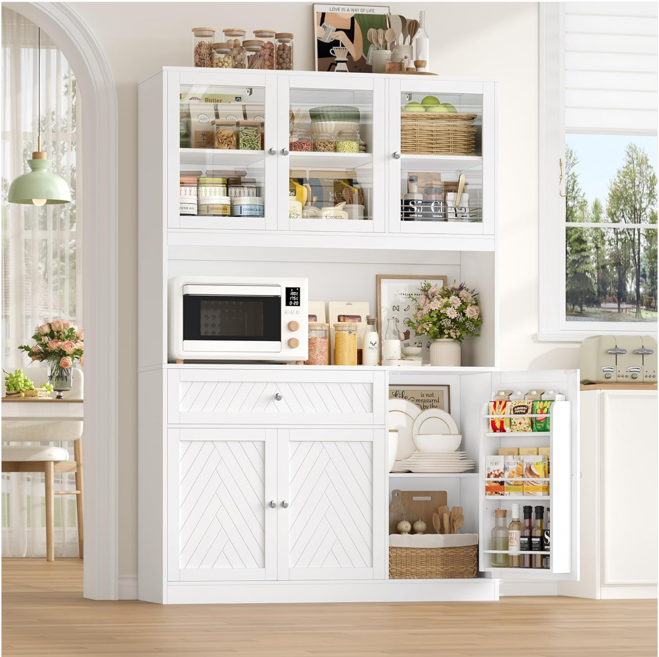
Figure 3: The cabinet with all doors open, showcasing the versatile storage options including adjustable shelves, door shelves, and the central countertop area, all neatly organized with various kitchen items.