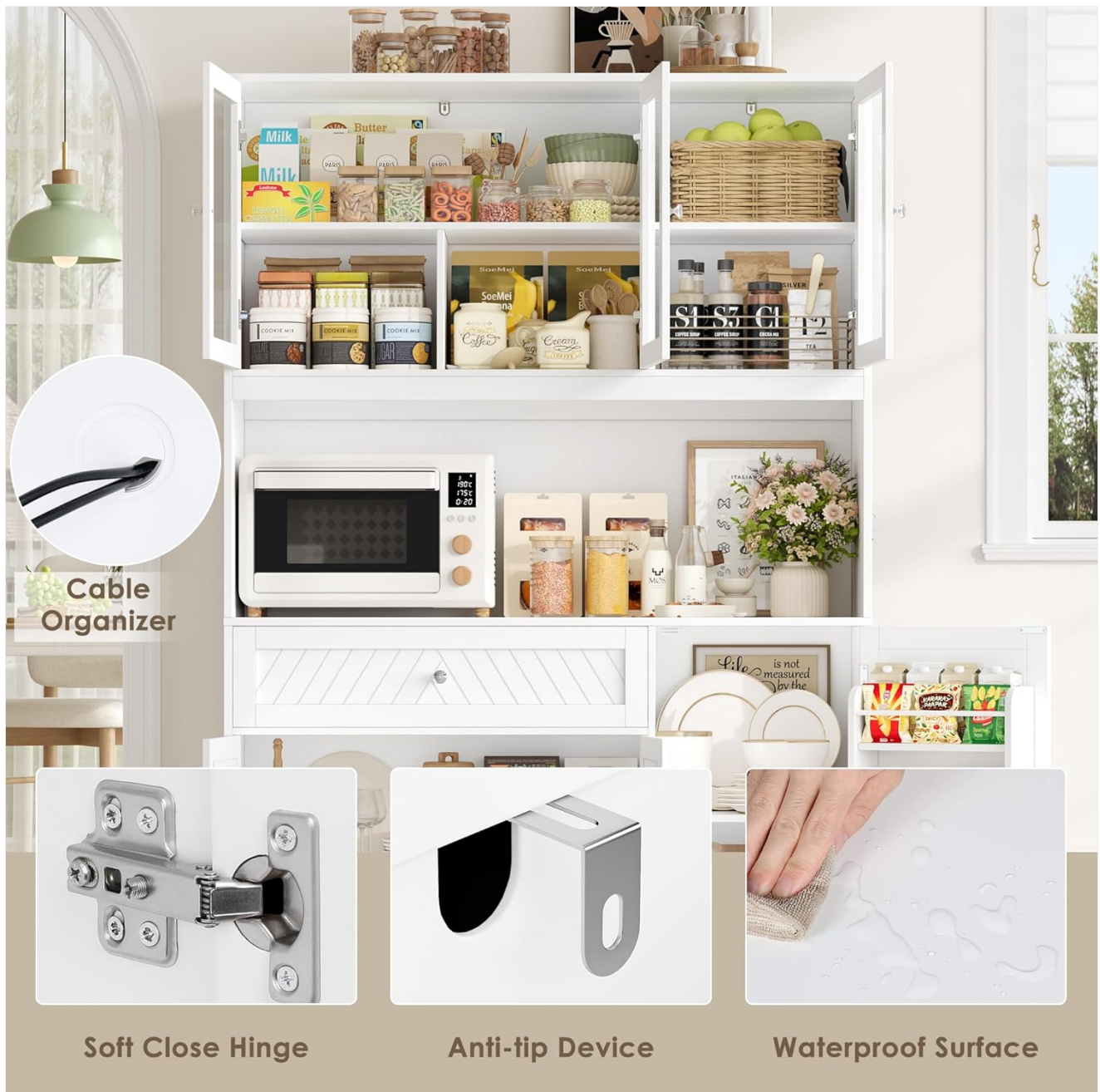
Figure 2: Close-up view of key features including the cable organizer, soft-close hinges, anti-tip device, and waterproof surface.