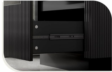
Extended slide rails