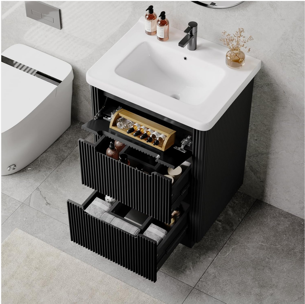
Image: Overhead view of the vanity with all drawers open, demonstrating the storage capacity for various bathroom essentials.