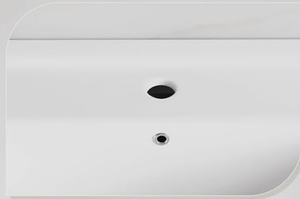
Pre-drilling faucet hole