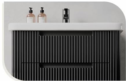
Modern fluted design

Image: Close-up view of the vanity's internal features, highlighting the U-shaped drawer design for plumbing and the extended slide rails for full drawer access.