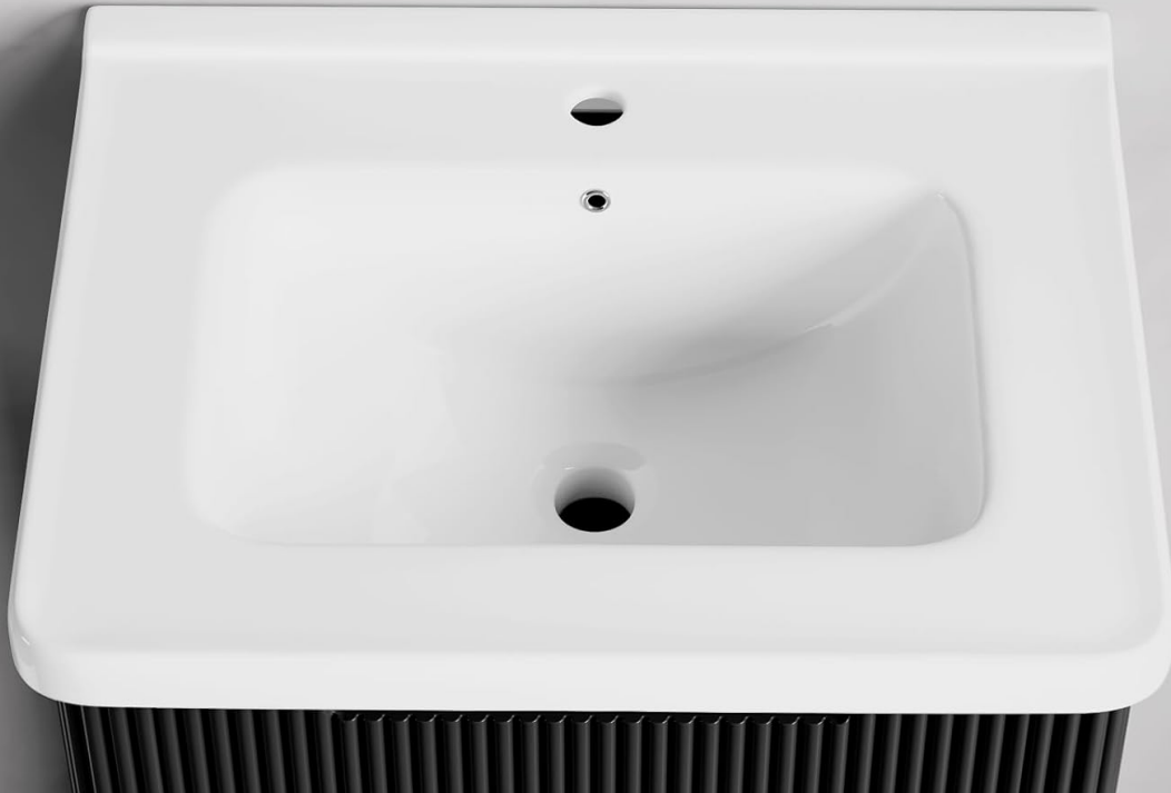
Image: Detailed view of the integrated ceramic sink, showing its smooth, easy-to-clean surface and the pre-drilled faucet hole.