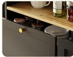
Bocaux à épices