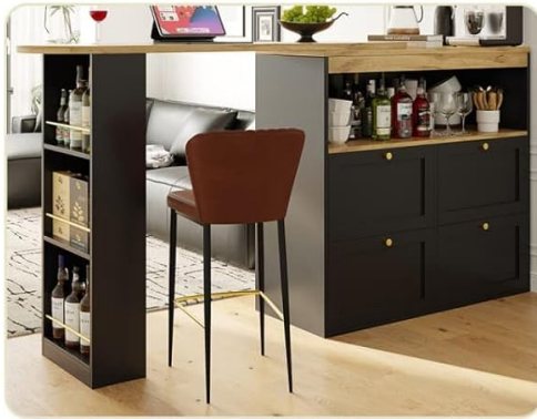
Restaurant - Table à manger

Excellent produit pour diviser l'espace familial