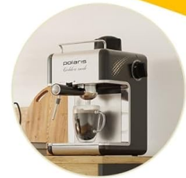
Petits appareils de cuisine