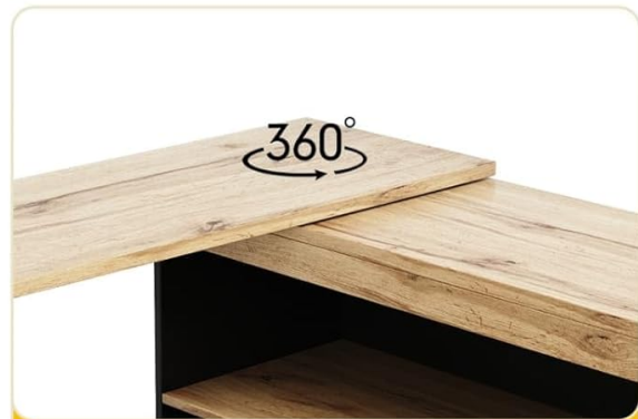
Rotation libre à 360 degrés