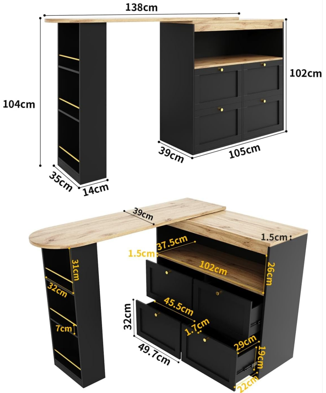
Figure 1: Product Dimensions. This image illustrates the detailed measurements of the table in its compact configuration, including the main cabinet (105cm wide, 39cm deep, 102cm high) and the side shelving unit (35cm wide, 14cm deep, 104cm high). It also shows the tabletop length of 138cm and various internal compartment dimensions.