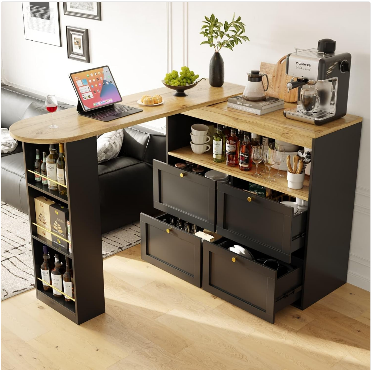
Figure 5: Open Drawers. This image shows the KOMHTOM table with its drawers pulled open, revealing the internal storage space. It demonstrates the accessibility and capacity of the four large drawers for organizing various household items.