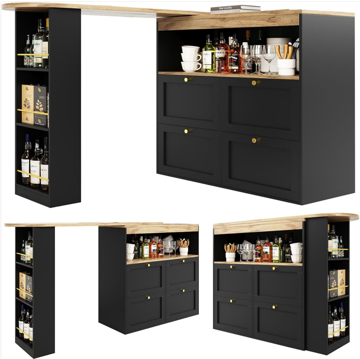
Figure 2: Product Views. This image displays the KOMHTOM table from various angles, showcasing its design and the arrangement of the main cabinet and the side shelving unit. It provides a comprehensive visual overview of the product's structure.