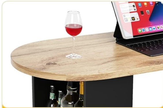
Matériaux de dalle MDF de haute qualité