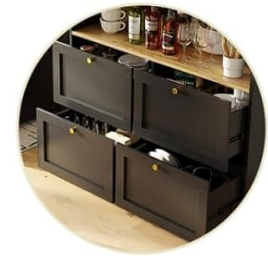
Quatre Tiroirs De Grande Capacité