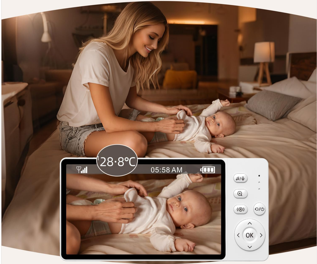
Image 3.2: The JeeBer baby monitor highlighting its "No WiFi Required" feature, emphasizing privacy protection through FHSS technology.