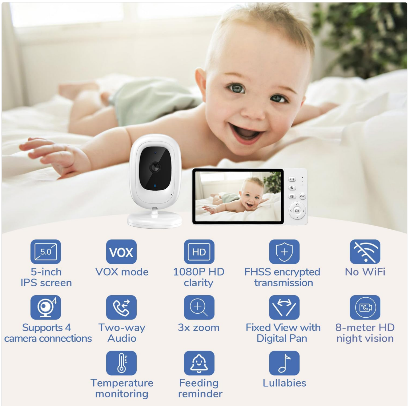
Image 3.1: Overview of the JeeBer VB619 Baby Monitor system, showing the parent unit (monitor) and the baby unit (camera) with a baby in the background. Key features like 5-inch IPS screen, VOX mode, 1080P HD clarity, FHSS encrypted transmission, no WiFi, 4 camera support, two-way audio, 3x zoom, fixed view with digital pan, 8-meter HD night vision, temperature monitoring, feeding reminder, and lullabies are highlighted.