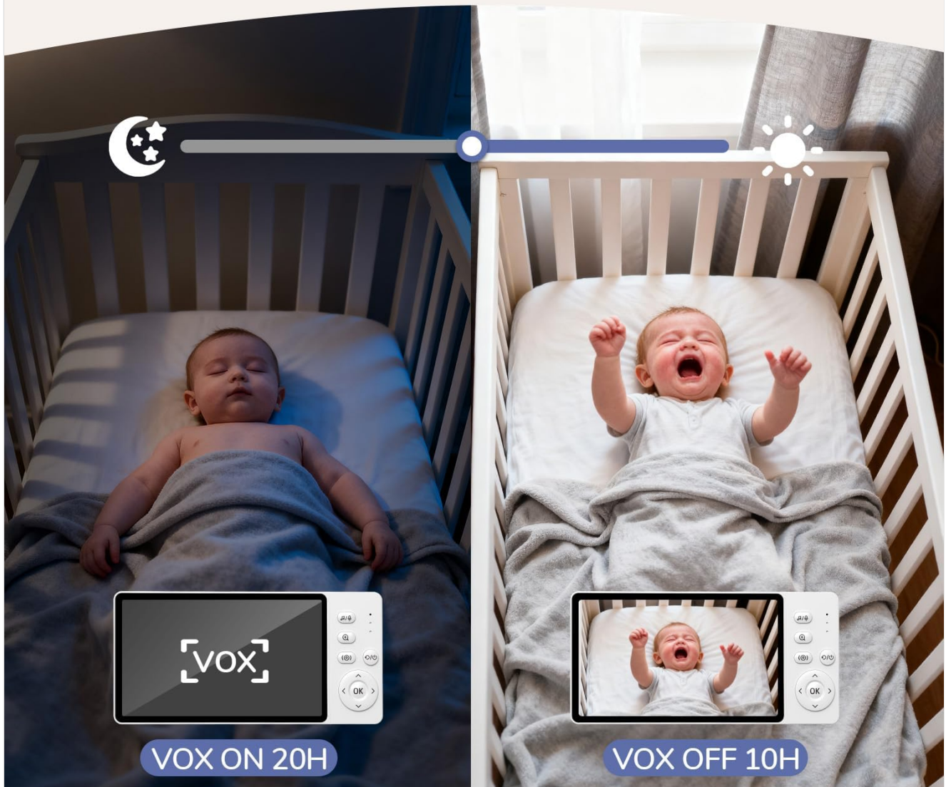
Image 5.3: This image illustrates the Smart VOX Mode, showing the monitor screen off when the baby is sleeping (VOX ON, 20H battery life) and the screen on when the baby is crying (VOX OFF, 10H battery life), highlighting its voice-activated screen and extended battery life.

Voice-Activated Screen With Extended Battery Life