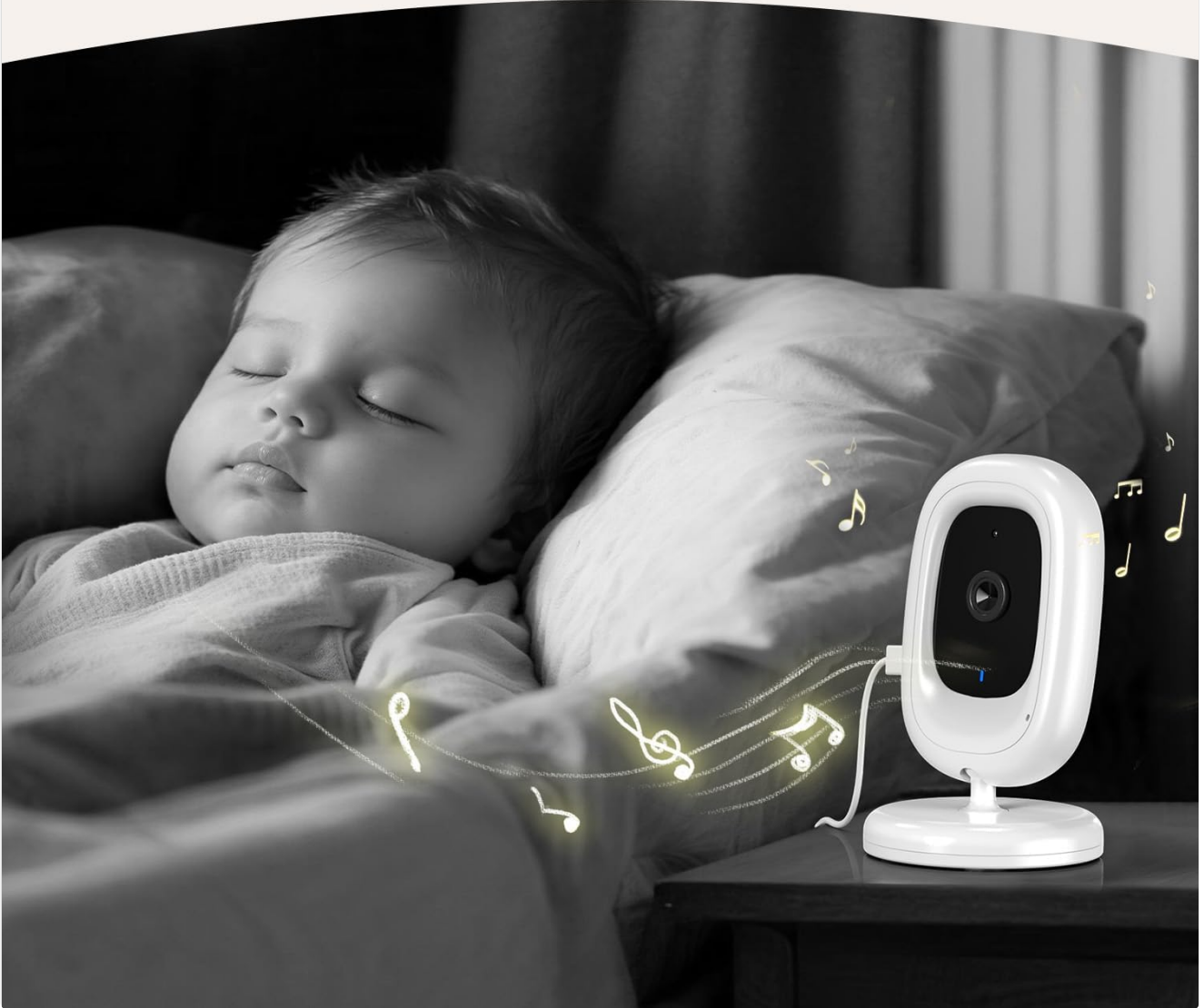
Image 5.2: An image depicting a baby sleeping peacefully, with musical notes floating around, symbolizing the 8 soothing lullabies feature designed to aid healthy sleep habits.