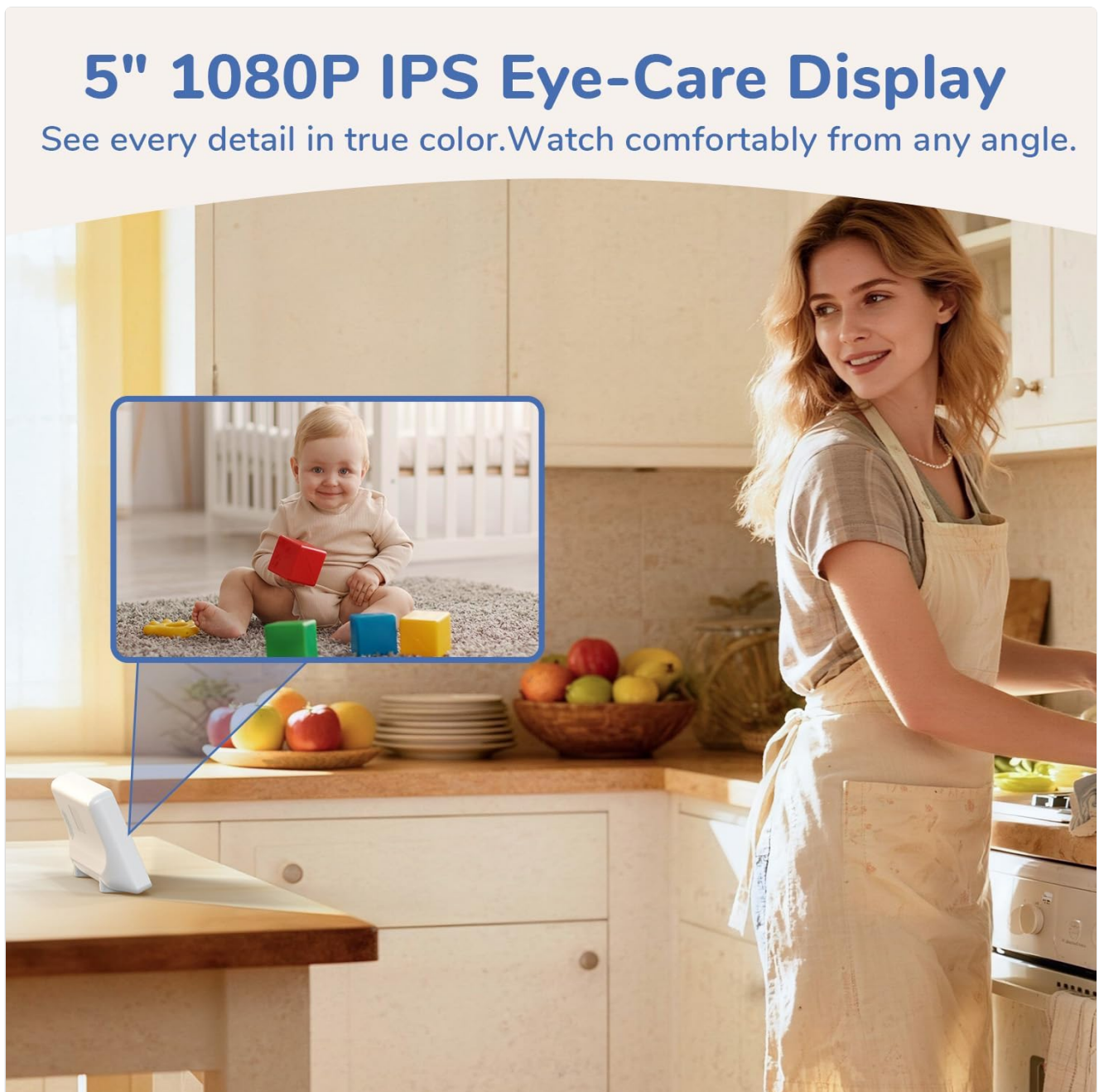
Image 4.1: A woman in a kitchen observing her baby on the 5-inch 1080P IPS Eye-Care Display of the JeeBer baby monitor. The