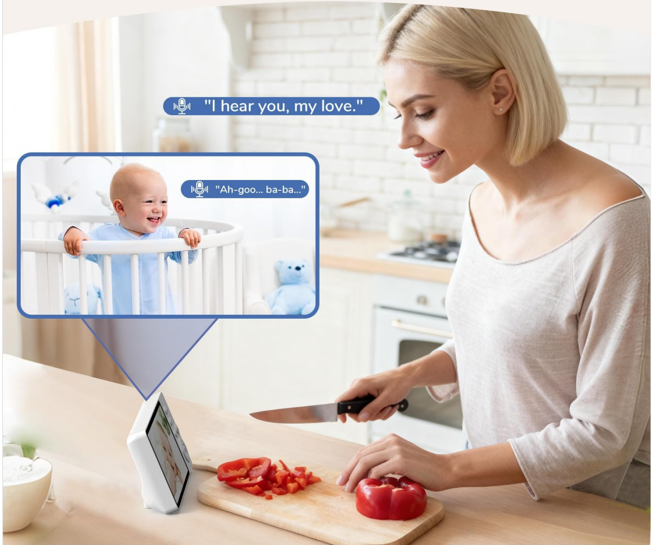
Image 5.4: A woman in a kitchen using the two-way noise-canceling call feature of the JeeBer baby monitor to communicate with her baby in the crib, with speech bubbles indicating "I hear you, my love." and "Ah-goo... ba-ba...".

Hear What Matters. Powered by Advanced Noise Cancellation