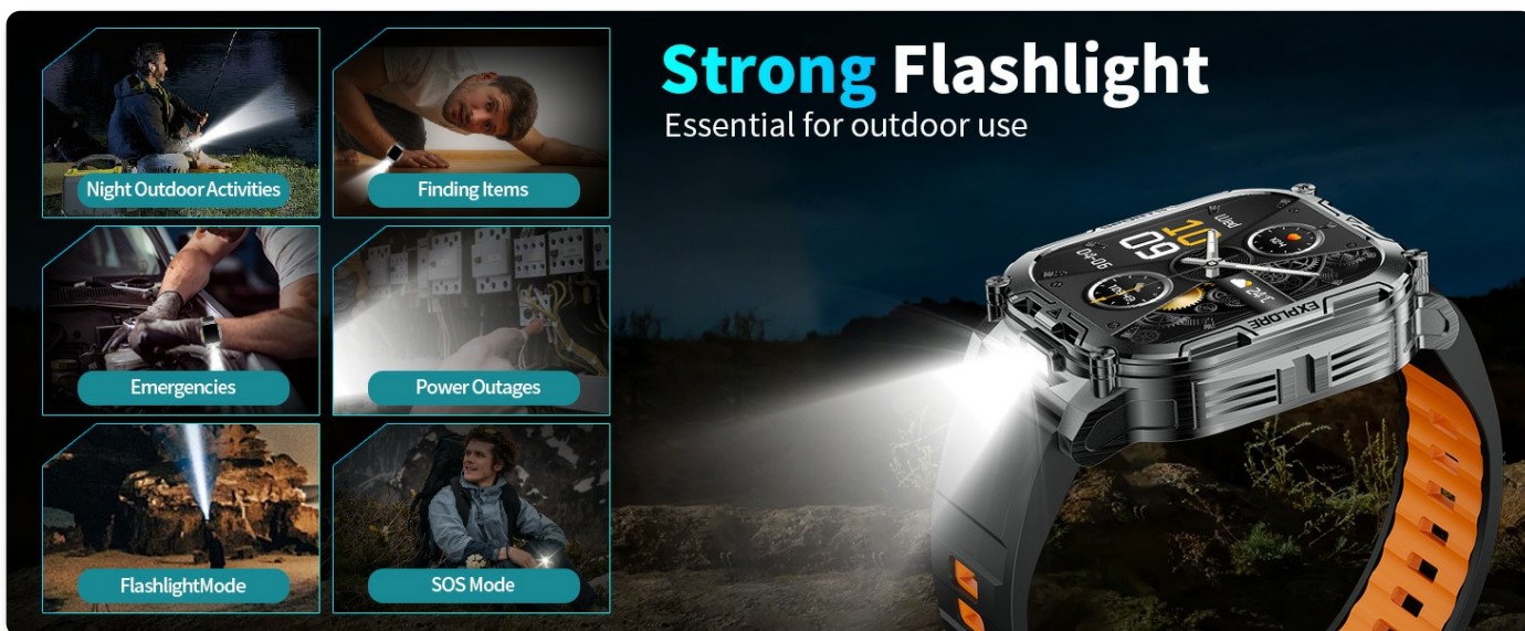
Image: The smartwatch demonstrating its strong flashlight feature, highlighting its utility in various low-light situations.