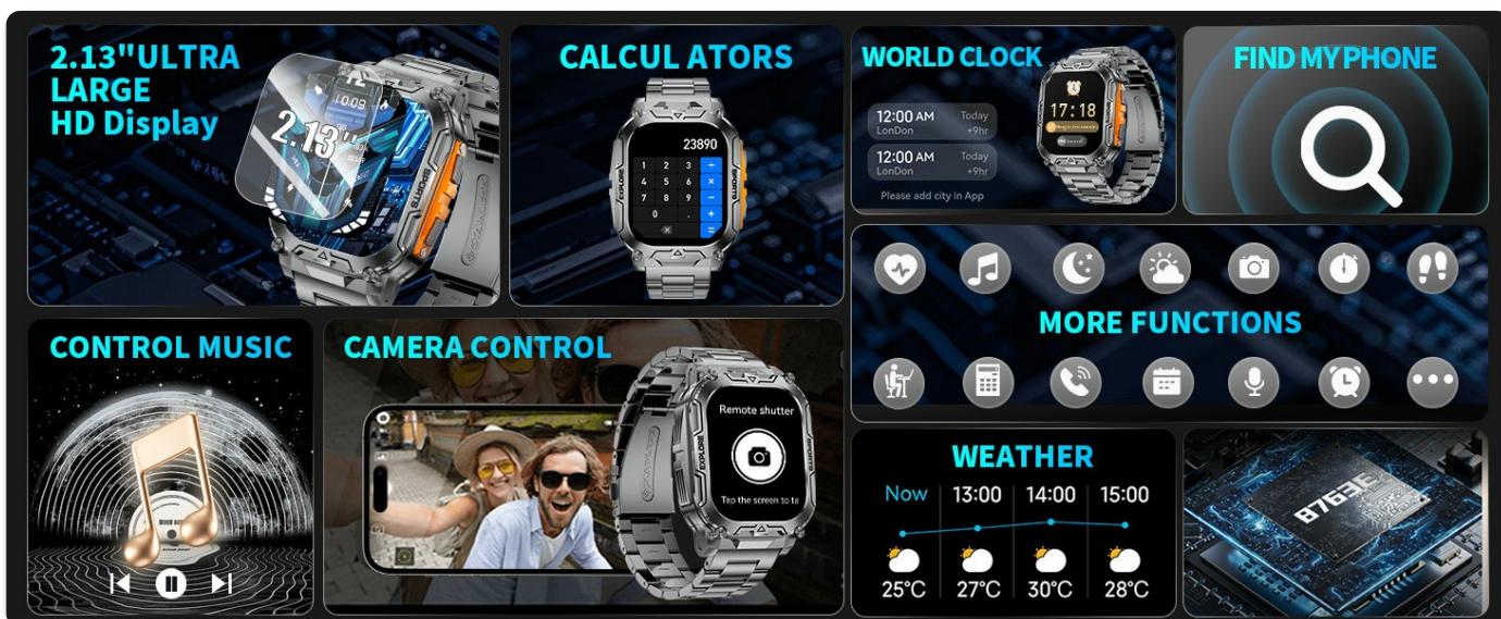
Image: The smartwatch interface showcasing additional features such as calculator, world clock, music control, and camera remote.

The TX12-C also offers AI voice assistant, music control, camera remote control, weather display, alarm clock, sedentary reminder, water reminder, and a "Find My Phone" feature.