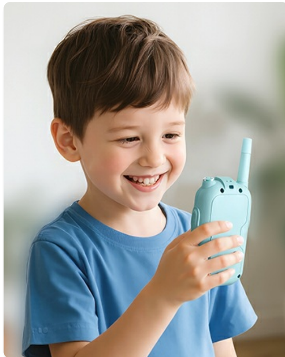
Image: The walkie talkies feature easy USB-C charging, eliminating the need for frequent battery replacements.