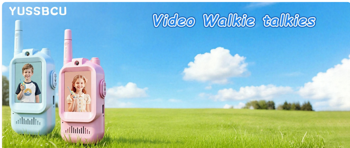
Image: The YUSSBCU Video Walkie Talkies offer advanced features like video calls and rechargeable batteries, a significant upgrade from traditional, battery-operated voice-only devices.

Thank you for choosing the YUSSBCU Video Walkie Talkies for Kids. This manual provides essential information for setting up, operating, and maintaining your new video intercom devices. Designed for children aged 3-12, these walkie talkies offer a unique blend of audio and video communication, enhancing interactive play both indoors and outdoors.