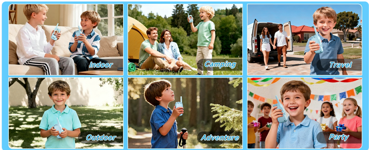
Image: The devices support communication through walls, making them suitable for indoor use across different rooms.