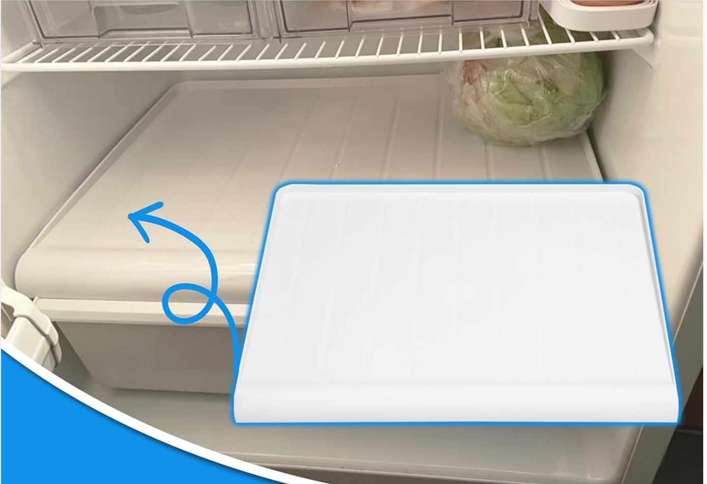
Figure 2: Illustration of the crisper drawer cover being placed into the refrigerator compartment.