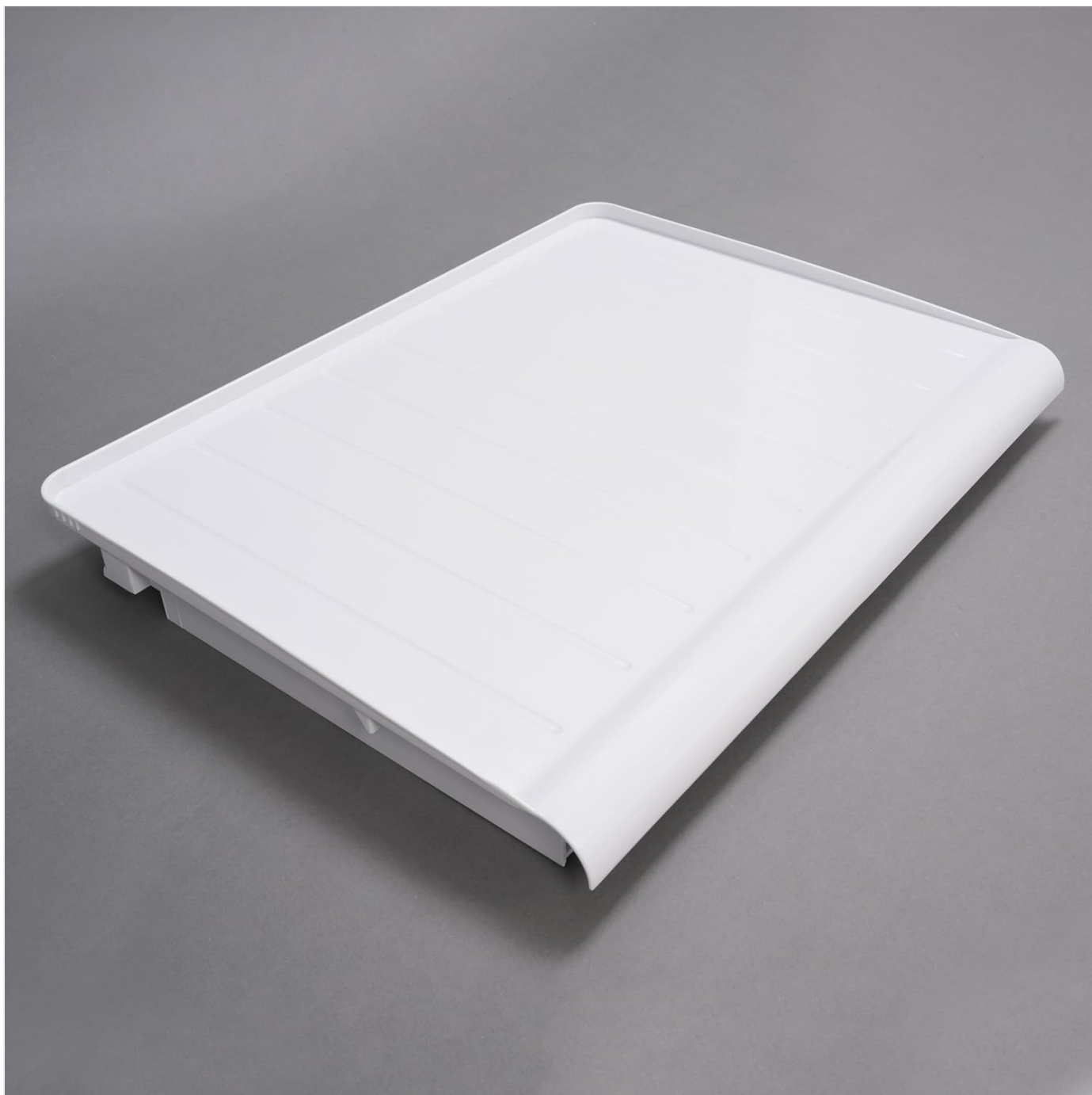
Figure 1: Crisper drawer cover showing approximate dimensions: 24-3/8 inches wide and 18-3/4 inches deep.