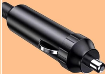
Cigarette Lighter Plug