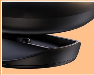
Non-Slip Stable Base