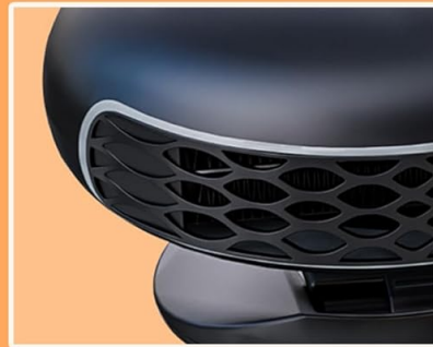
Wide Air Outlet