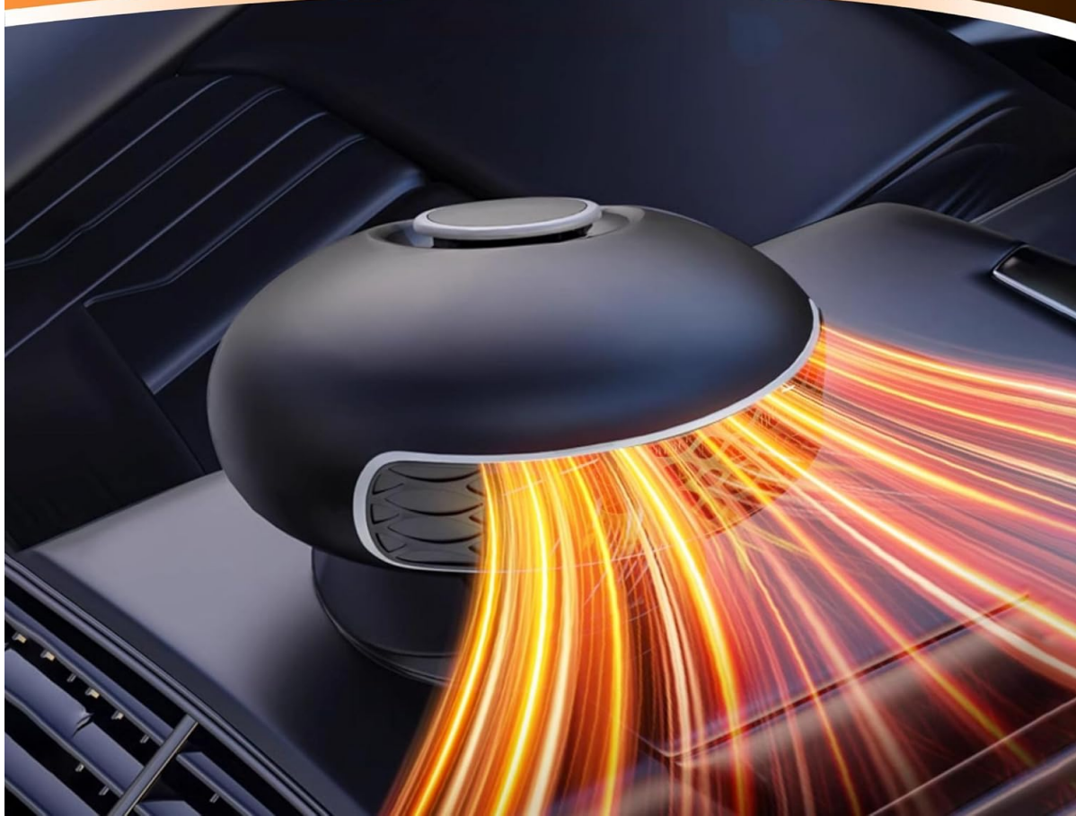
Image: The REVXON Car Heater and Defroster operating, illustrating its ability to provide both cold and warm air, and its effectiveness in defrosting and snow removal.