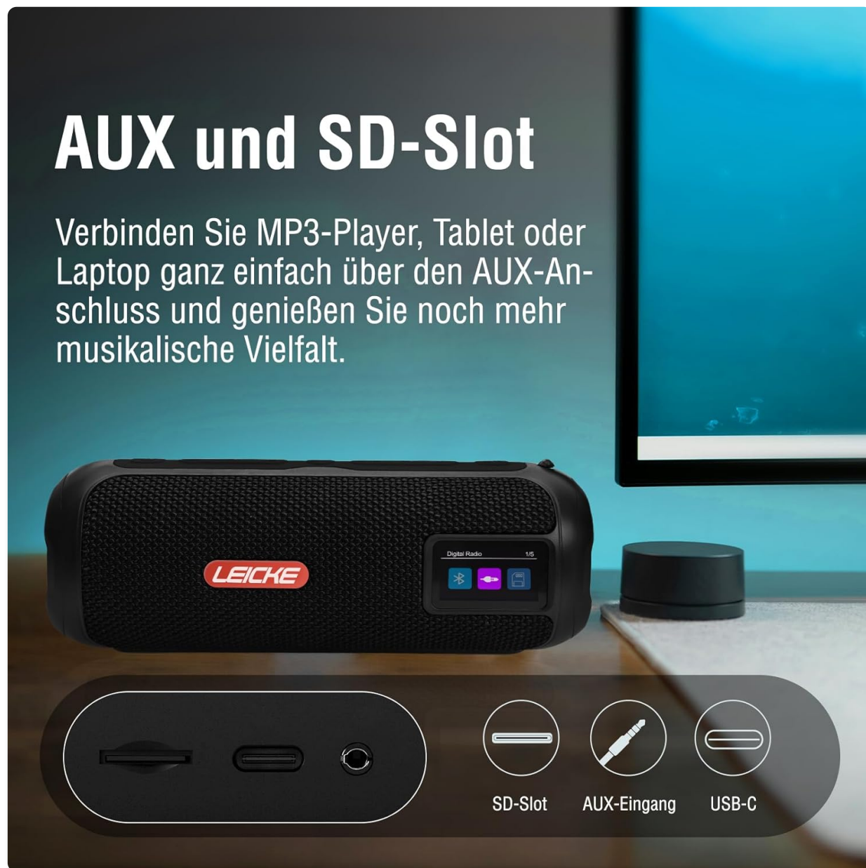
Image: Front view of the LEICKE DAB+ Radio Tube, highlighting the display, SD card slot, AUX input, and USB-C port.

Familiarize yourself with the various buttons, ports, and indicators on your LEICKE DAB+ Radio Tube.