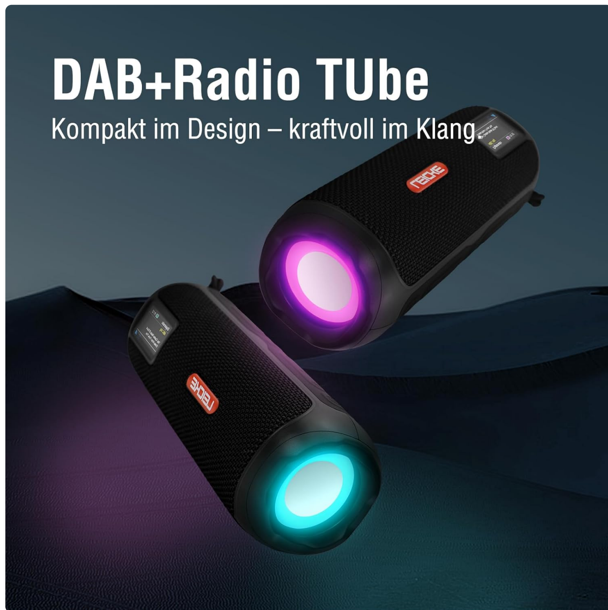
Image: Two LEICKE DAB+ Radio Tubes displaying their vibrant RGB LED lighting feature.

The RGB LED lights will automatically activate when the device is powered on. There may be a dedicated button to change light modes or turn them off (refer to device specific button layout if available).