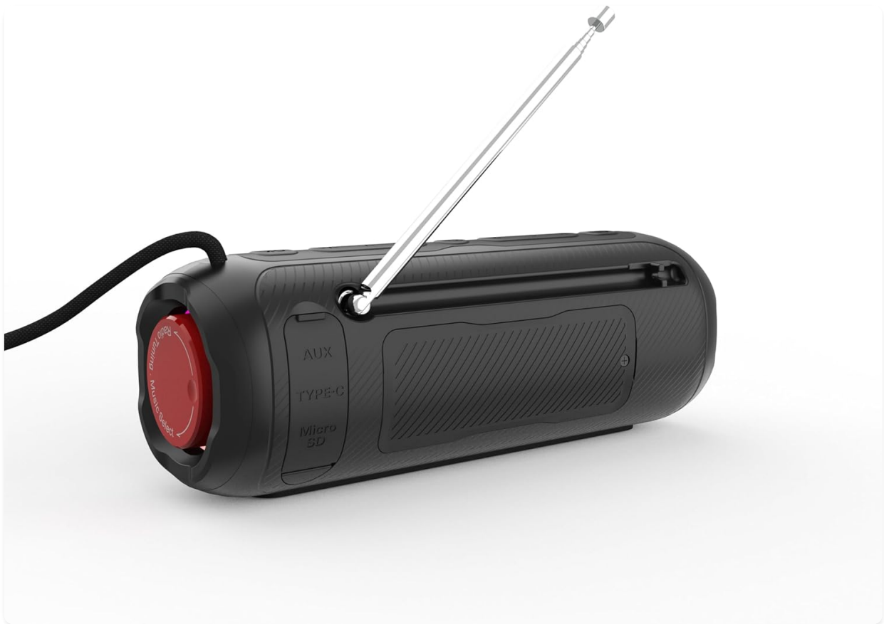
Image: Rear view of the LEICKE DAB+ Radio Tube, showing the extendable antenna, AUX port, USB-C port, and Micro SD slot.