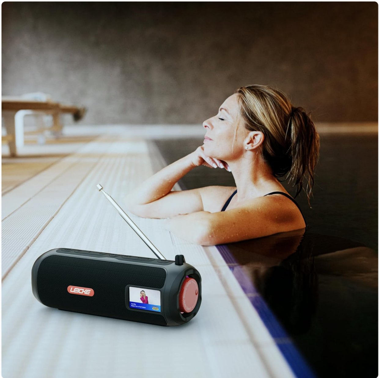
Image: The LEICKE DAB+ Radio Tube, showcasing its portable design, suitable for various environments like a poolside.