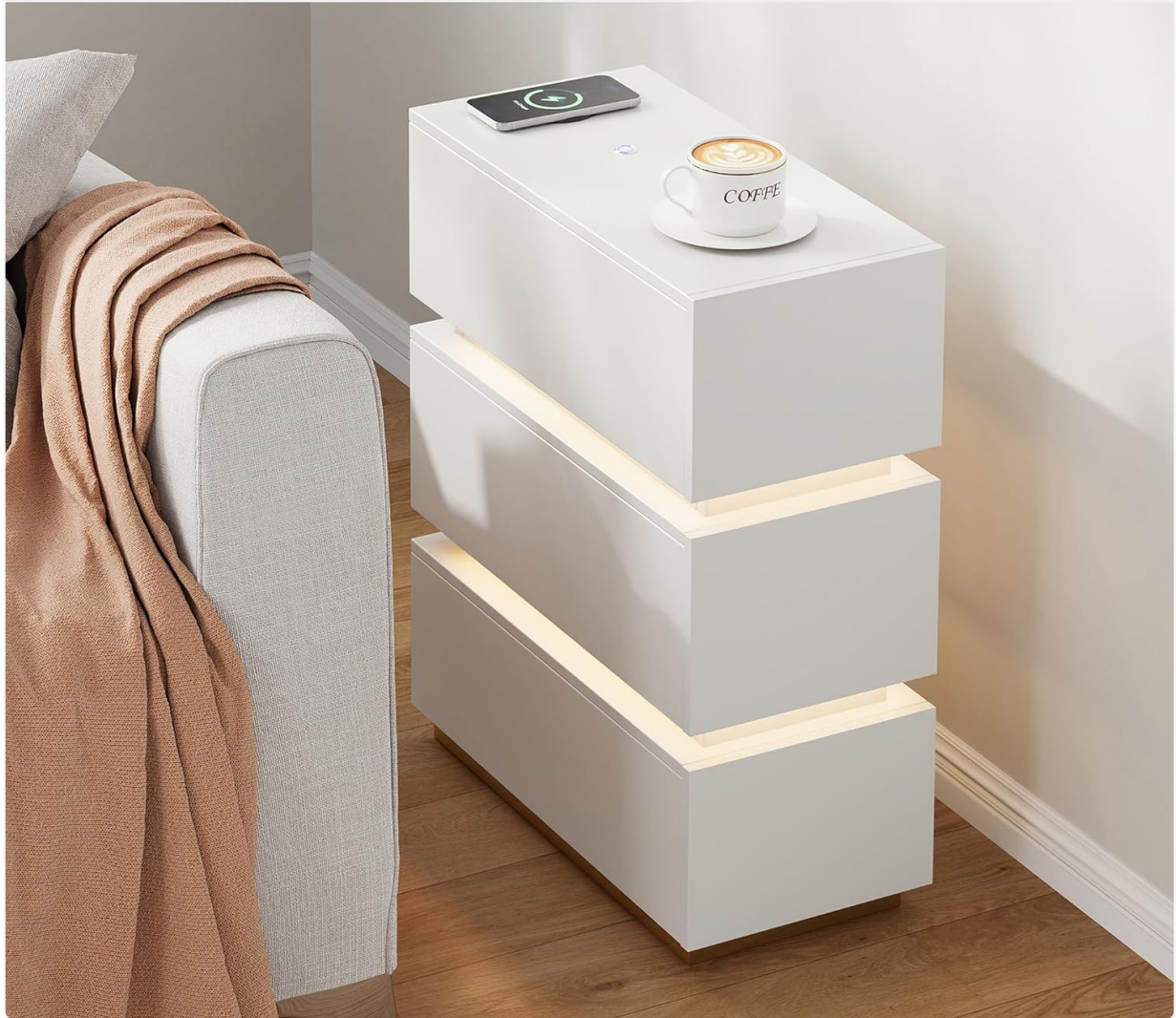
Image 5.1: The top surface of the nightstand demonstrating wireless charging in progress, with a phone placed on the charging pad. The image also clearly shows the integrated USB and Type-C charging ports.

Table de Chevet Gain de Place avec Fonctions Complètes au Chevet