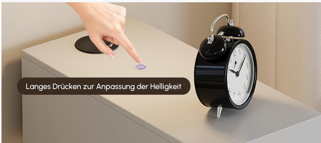
Image 1.1: The Homary Smart Narrow Nightstand positioned next to a bed, illustrating its compact and modern aesthetic.

Perfekte Atmosphäre mit Anpassbarer Helligkeit Einstellen