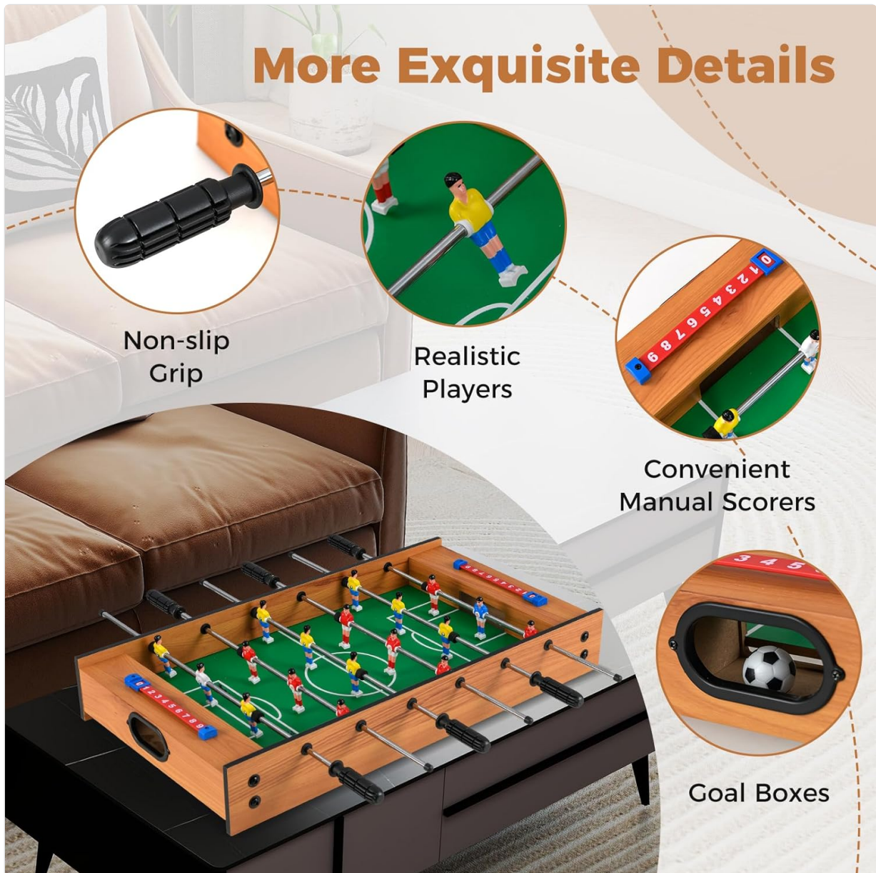
Image 4.1: Detailed view of the game table's features, including non-slip grips on the handles, realistic player figures, convenient manual scorers, and goal boxes for ball retrieval.