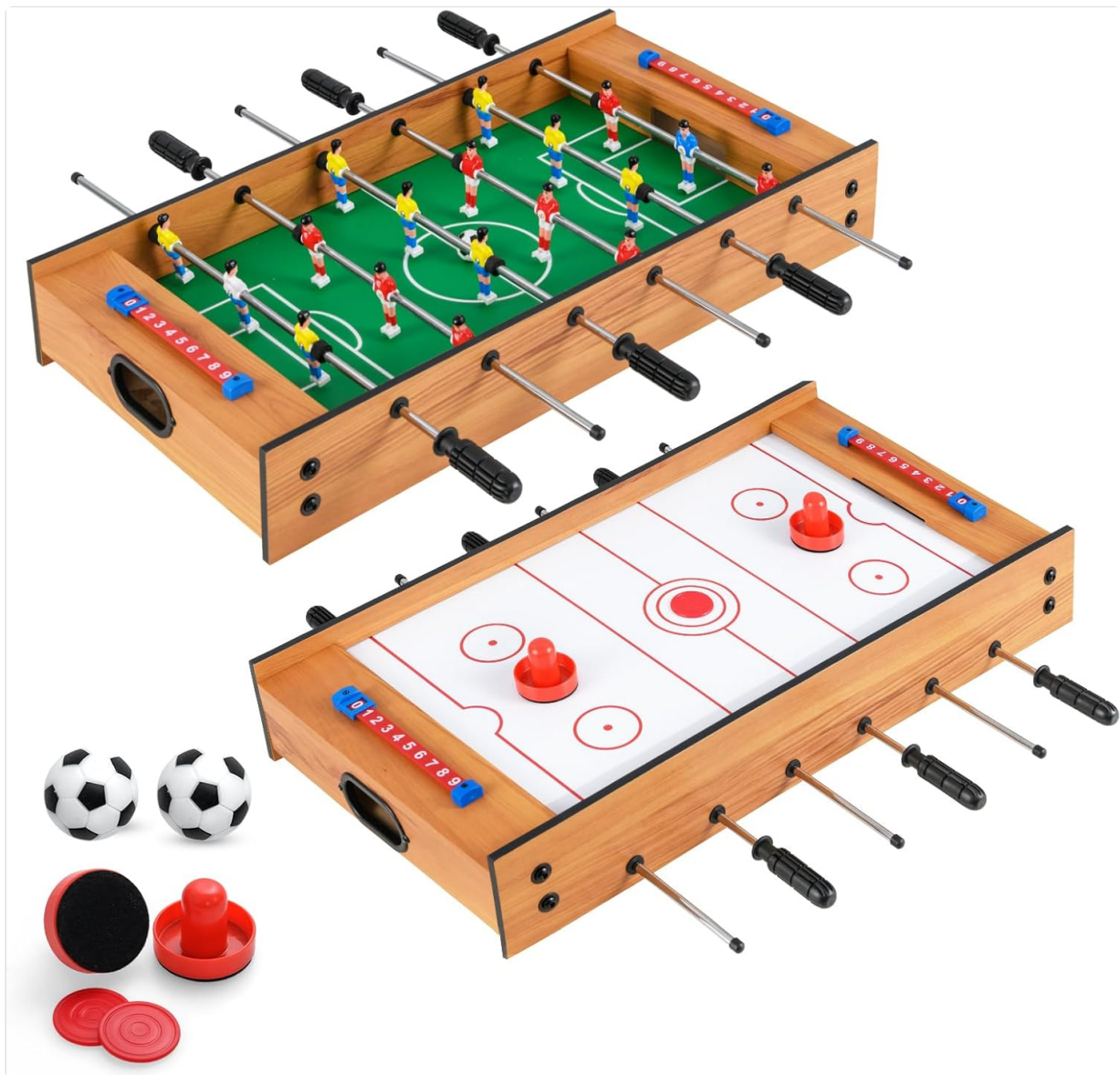
Image 1.1: The GYMAX 2-in-1 Multi Game Table, illustrating both the foosball and hockey configurations, along with included accessories like soccer balls, pucks, and pushers.