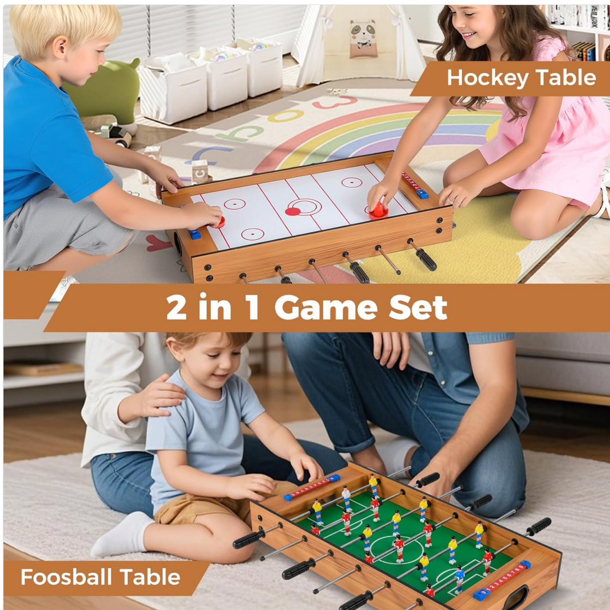
Image 5.1: Two children playing air hockey on the table, and a parent with a child playing foosball, demonstrating the dual functionality of the game set.