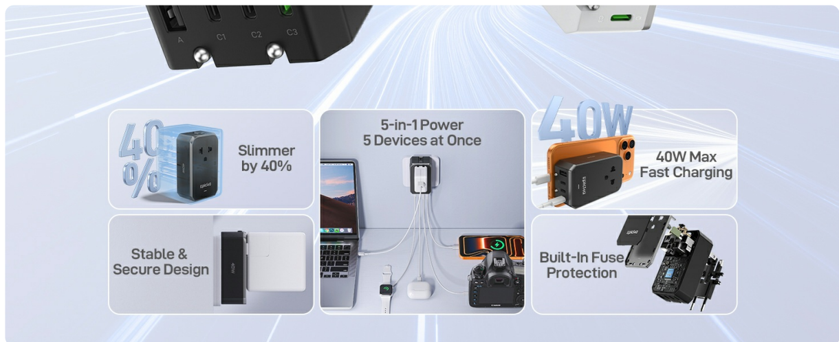
Figure 3: The adapter's stable design ensures a secure connection to wall outlets.

Ensure the selected plug type is fully extended and locked into place before inserting the adapter into a wall outlet. The adapter features a stable "Cookie" design for a tight fit in wall outlets.