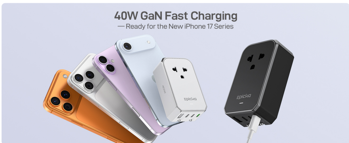
Figure 6: Fast charging an iPhone 17 with the adapter.

The 40W PD fast charging via the USB-C3 port is capable of charging an iPhone 17 to 50% in approximately 20 minutes. This feature is ideal for smartphones, tablets, smartwatches, fitness trackers, power banks, cameras, handheld game consoles, and headsets.