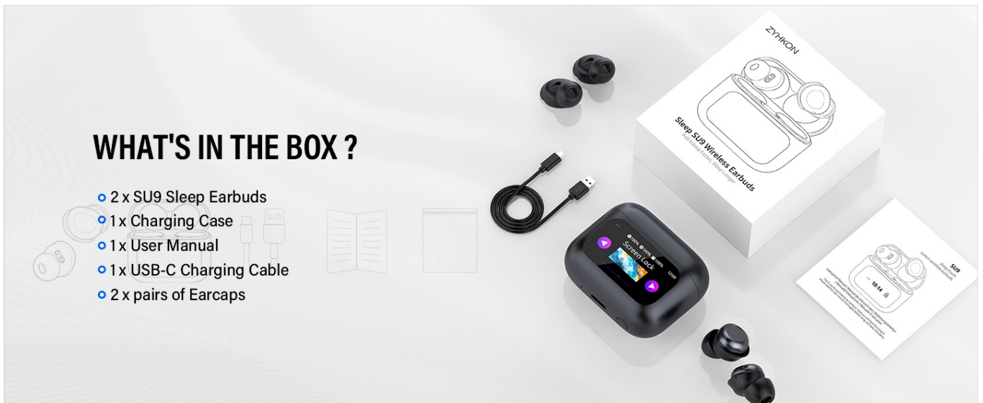
Illustration of all items included in the ZYHKON SU9 Sleep Earbuds package.