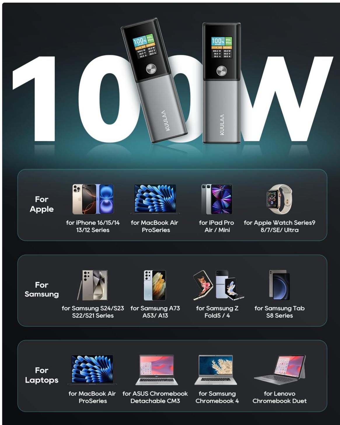
Image: Examples of devices compatible with the KUULAA 100W power bank, including iPhones, iPads, Galaxy phones, and various laptops.