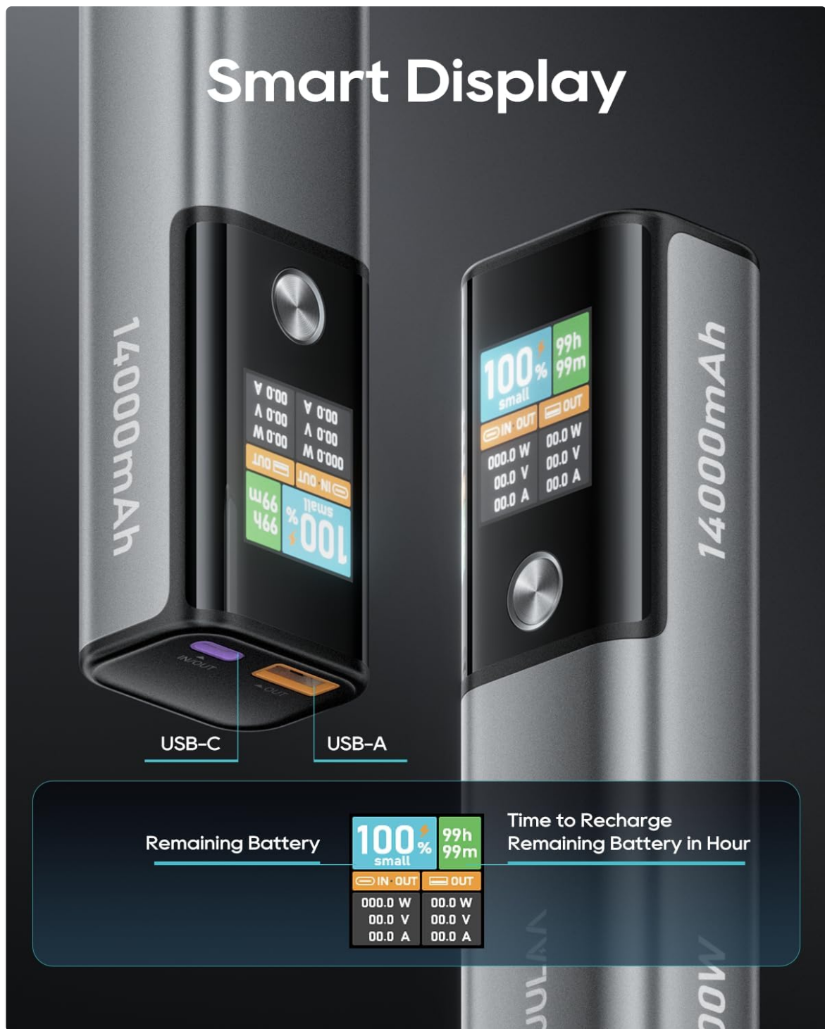
Image: The TFT display showing detailed charging information.