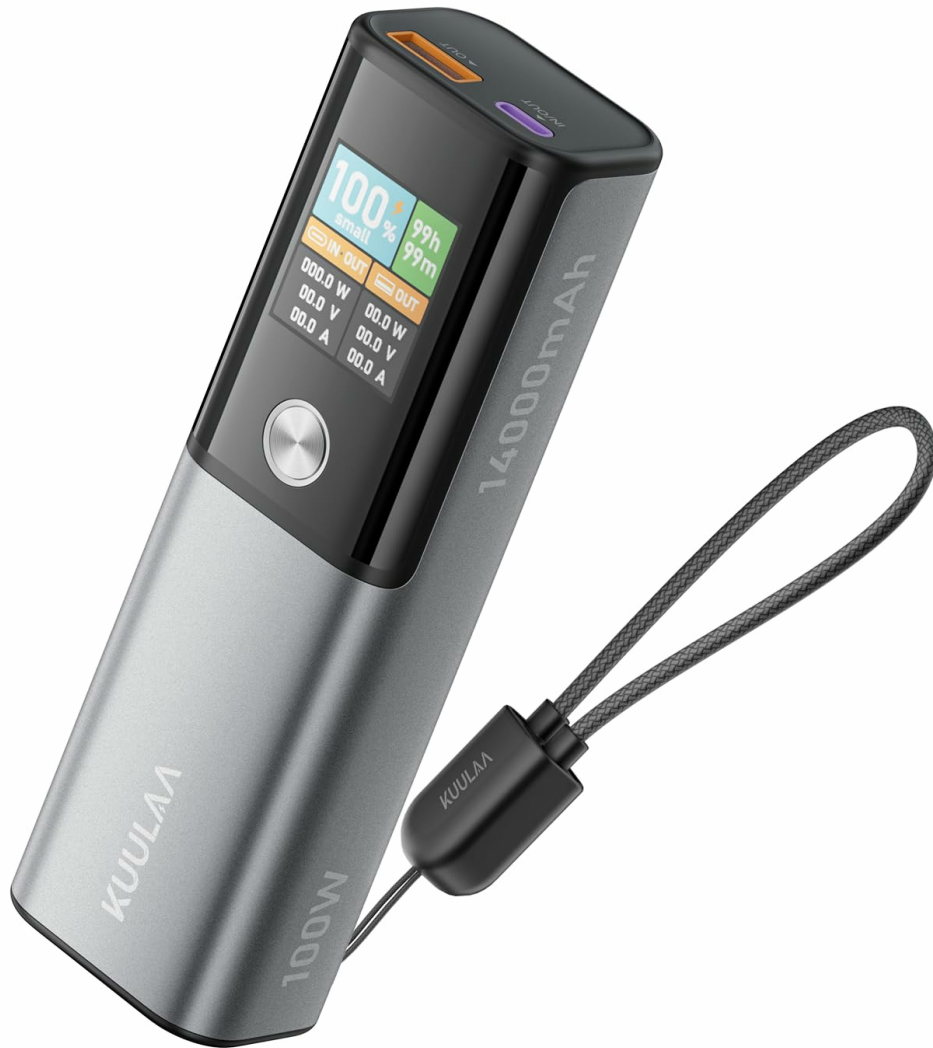
Image: The KUULAA KL-YD78 power bank, highlighting its 100W maximum output, 14000mAh high capacity, and an airplane icon indicating flight approval.