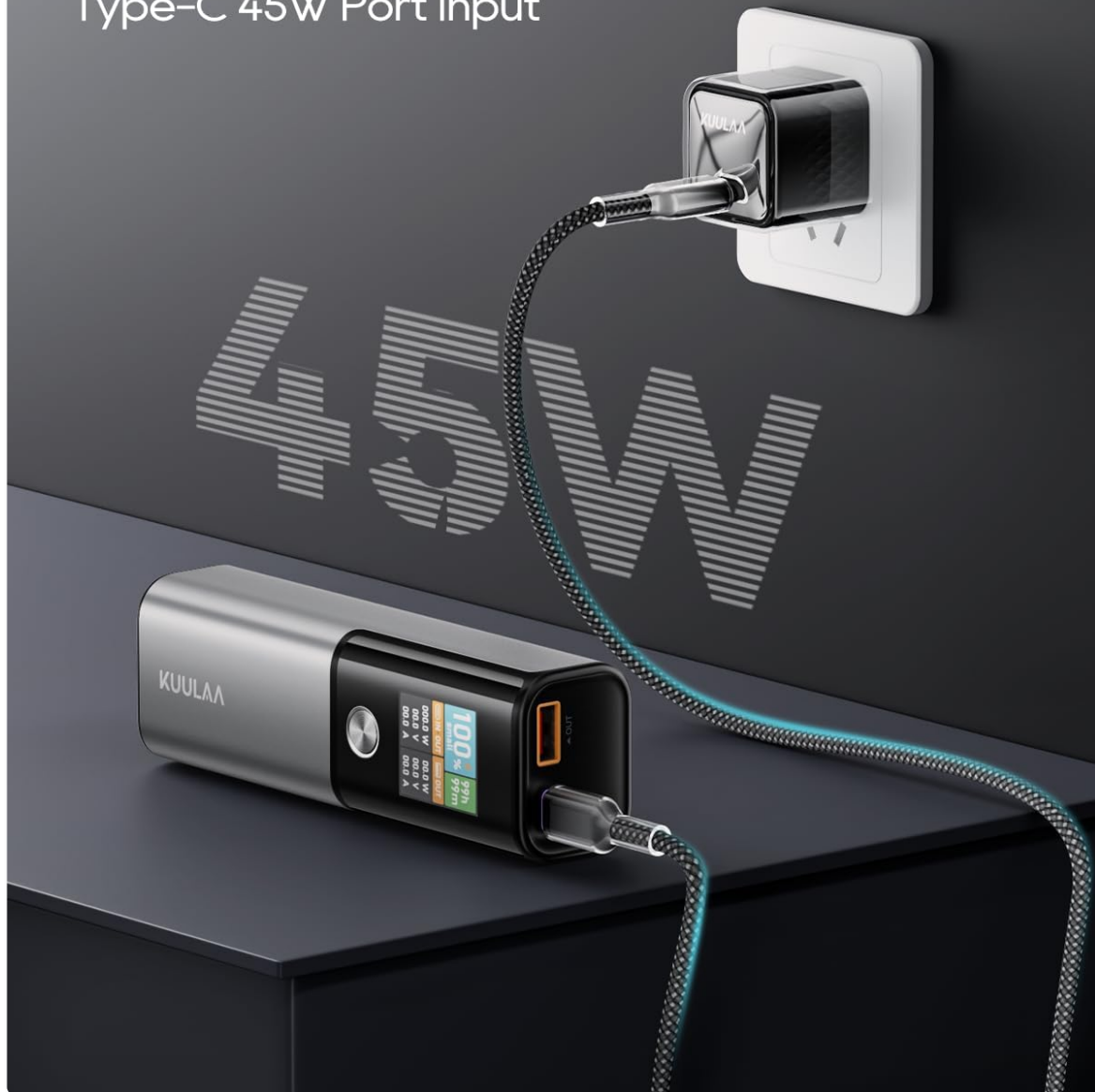
Image: The power bank being recharged, highlighting its 45W input and 2-hour full charge time.