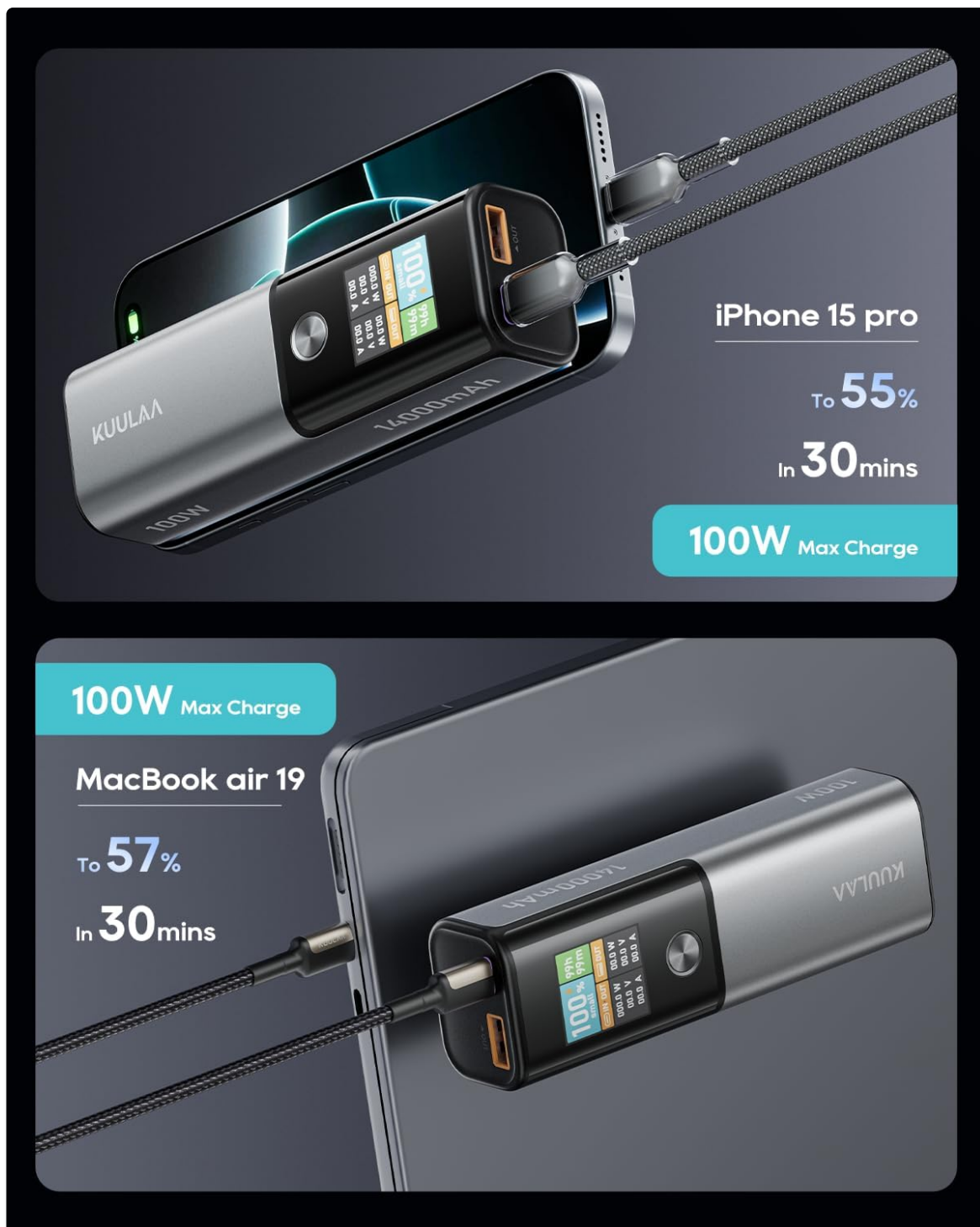
Image: The power bank demonstrating its 100W fast charging capabilities for an iPhone 15 Pro and a MacBook Air.