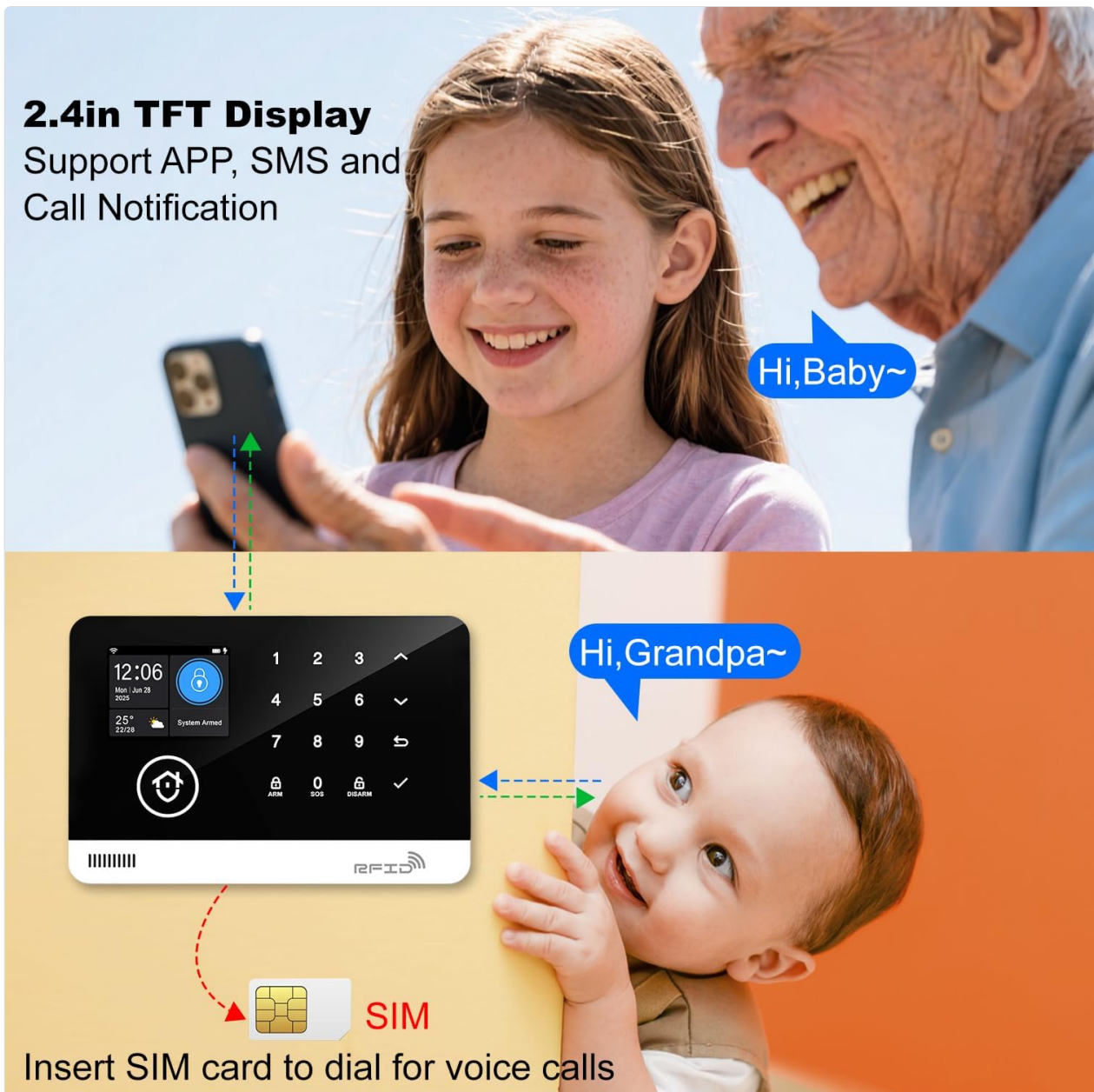
Image: An illustration demonstrating how to insert a SIM card into the control panel for 2G network functionality, enabling call and SMS notifications.