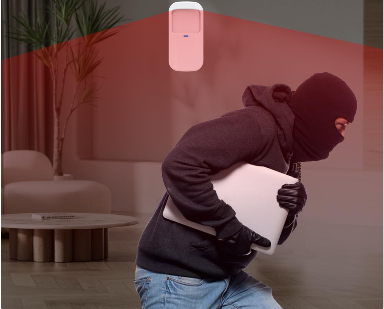
Image: A motion detector sensing movement in a room, indicating its role in triggering an alarm for real-time monitoring and instant notification.