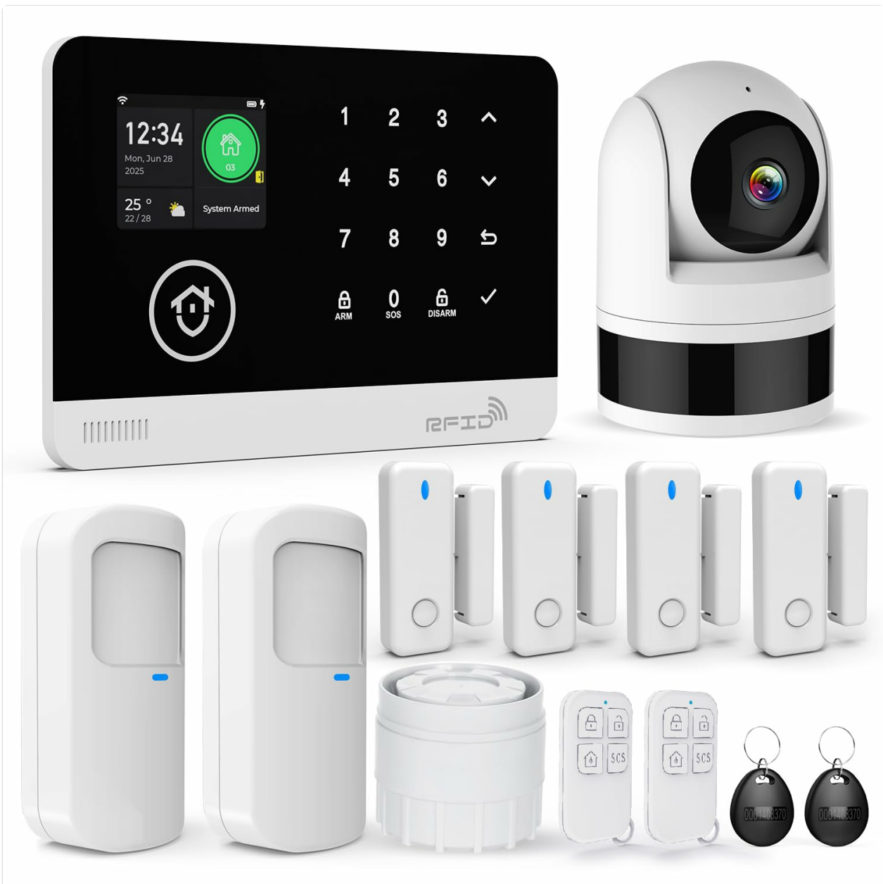
Image: The TUGARD G03SM-EB004-2E Home Security System, showcasing the control panel and various sensors.