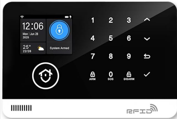
Alarm Control Panel*1