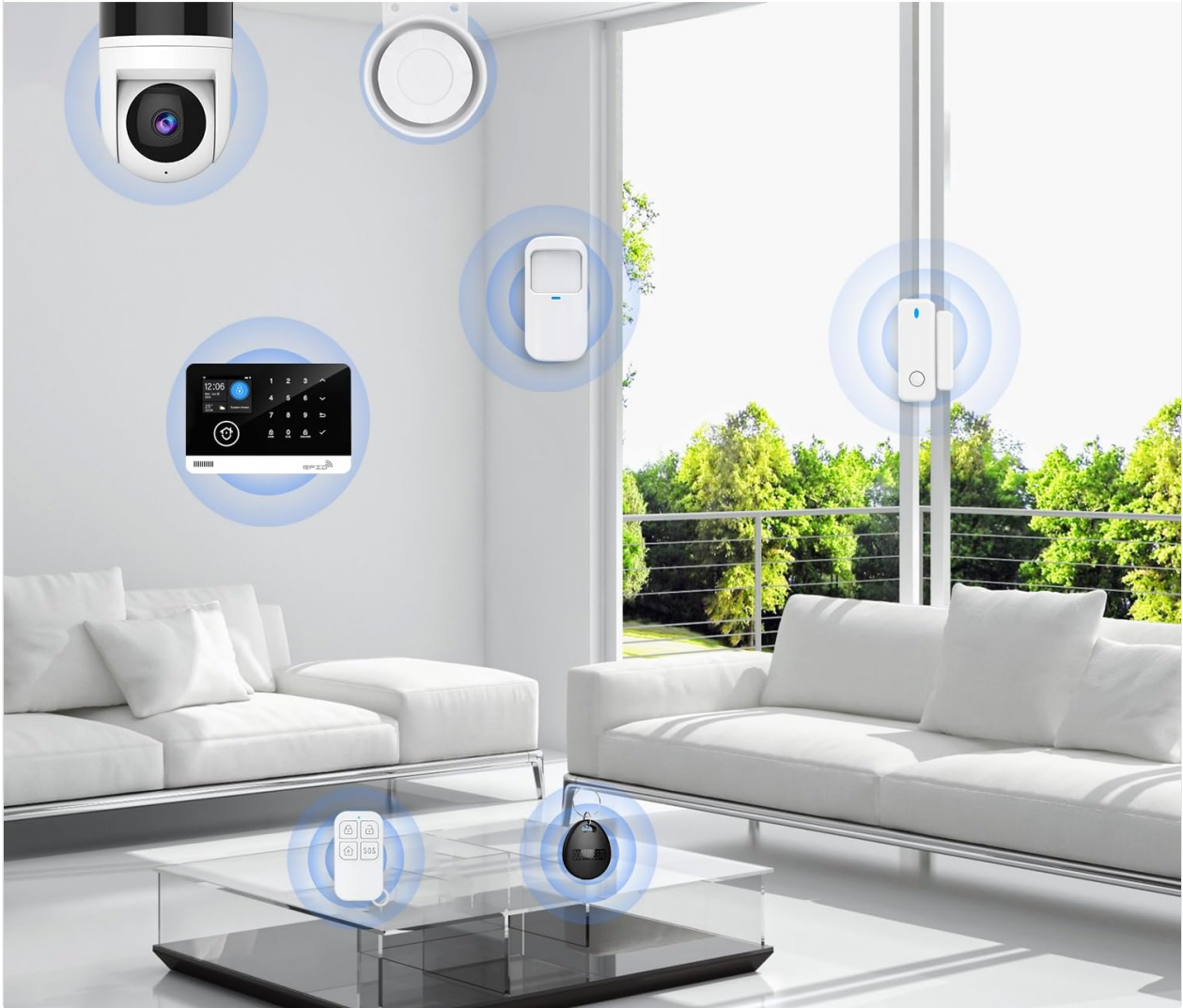
Image: A door/window sensor detecting activity, resulting in a base station alarm and phone push notification indicating a break-in.

Supports up to 100 sensors, 2 wired sensors and 10 remotes.