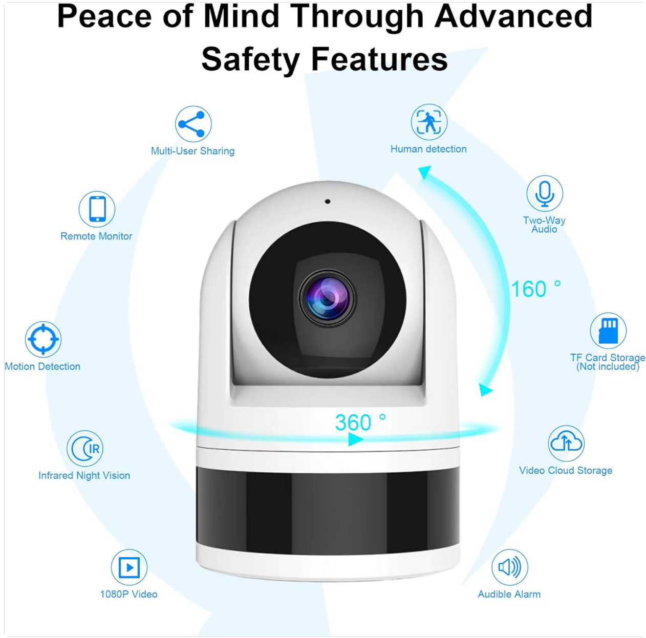
Image: A detailed view of the security camera, highlighting its features such as 360-degree rotation, 160-degree viewing angle, human detection, two-way audio, motion detection, infrared night vision, 1080P video, TF card storage, video cloud storage, and audible alarm.

The included camera provides 200W high-definition images and 1080P night vision. It supports human detection with automatic tracking and sends real-time alerts via the mobile app. The camera also integrates with Alexa/Google Home.