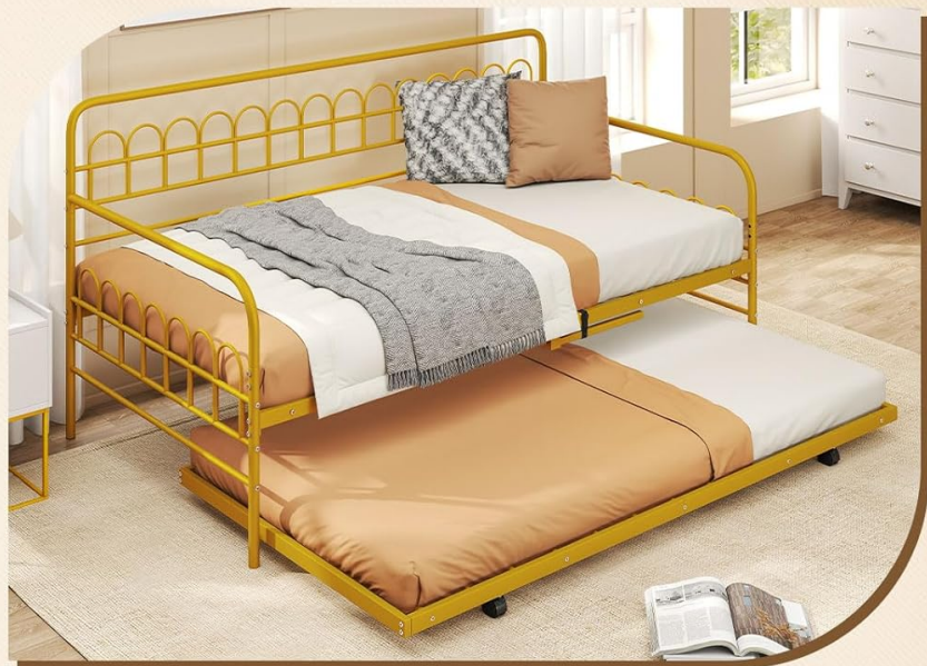
Figure 2.2: Daybed versatility: functions as a cozy sofa or an extra sleeping space.

Extra sleeping space for guests or sleepovers