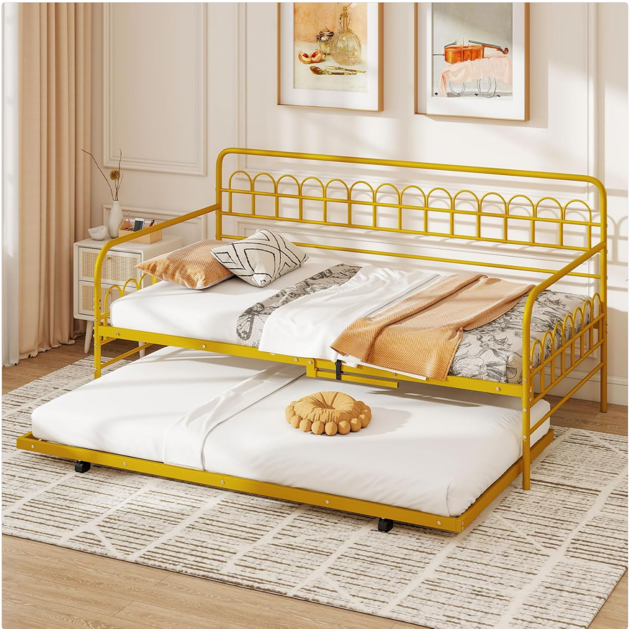
Figure 2.1: Giantex Twin Daybed with Trundle (Gold)