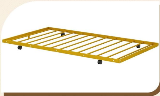
Space-saving Pull-out Trundle