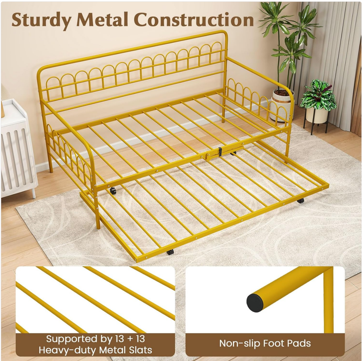
Figure 5.2: Detail of heavy-duty metal slats and non-slip foot pads for stability.