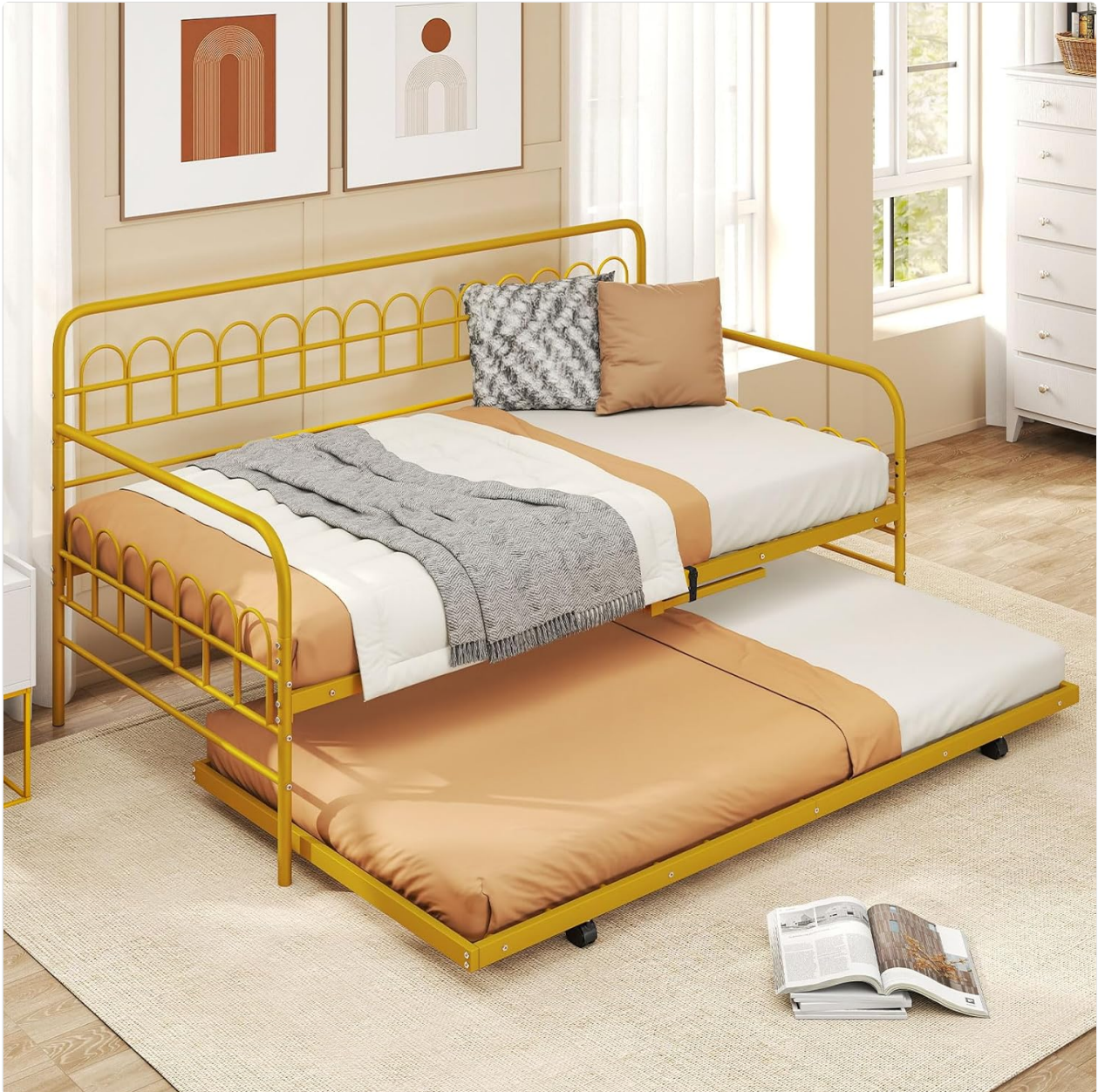
Figure 5.1: Fully assembled daybed and trundle.