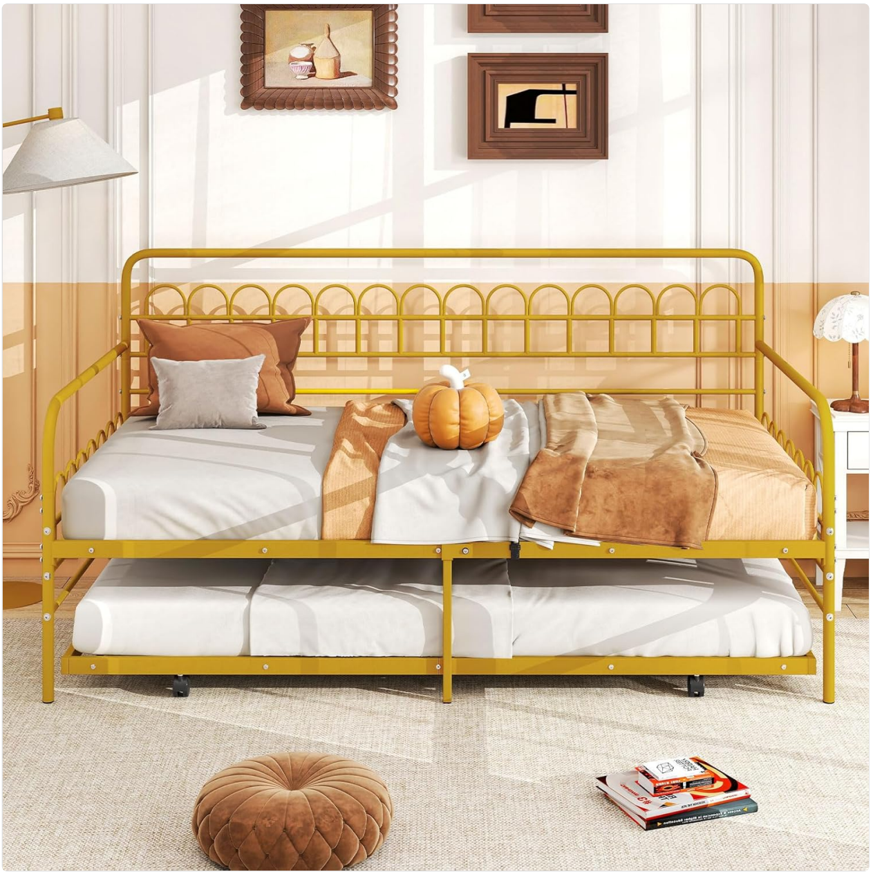
Figure 5.3: Trundle design with additional support leg and hook and loop fastener for easy operation.