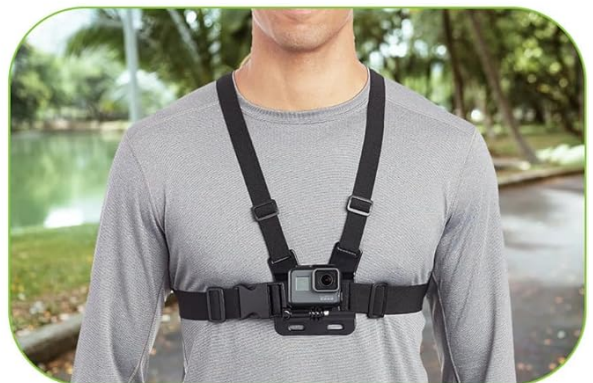
Figure 3: Additional accessories such as a floating handle grip, wrist strap for remote control, and a chest strap.