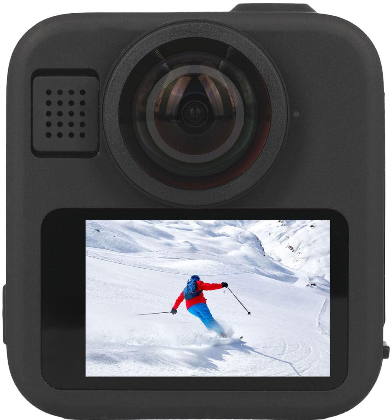
Figure 1: Front view of the GoPro MAX 2 8K 360 Action Camera.