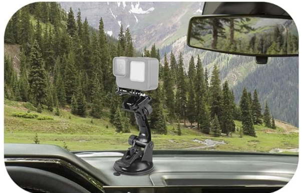
Figure 2: Various accessories for the GoPro MAX 2, including a flexible tripod, 360-degree wrist strap, and car suction mount.