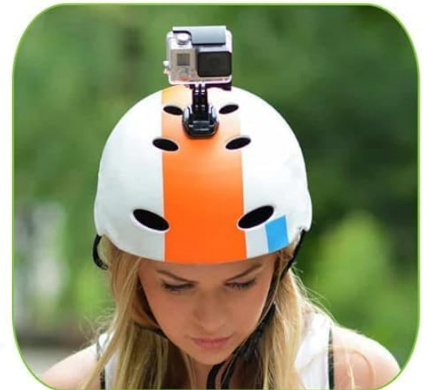
Figure 5: Mounting accessories for bicycles, clamps, and helmets.