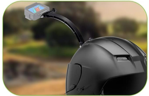
Figure 4: Accessories for head-mounted and extended perspectives, including a head strap, selfie stick, and helmet extension arm.