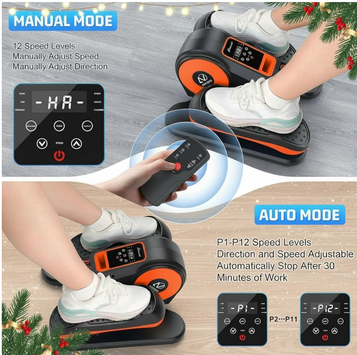
Image Description: A composite image detailing the elliptical's operational modes. It shows the control panel for Manual Mode (12 speed levels, adjustable direction) and Auto Mode (P1-P12 programs), along with the remote control and a person's feet on the pedals during use.