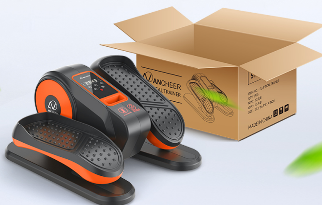
Image Description: The ANCHEER elliptical is shown next to its open packaging, with text highlighting that it is 100% pre-assembled and ready for immediate use.

Ready to use right out of the box for quick enjoyment.