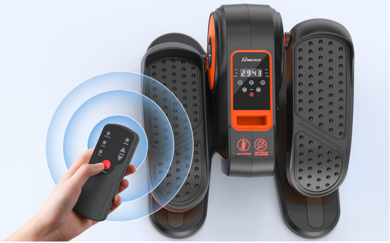
Image Description: The ANCHEER elliptical is shown with its remote control, illustrating the convenience of remote operation for adjusting settings without needing to bend down.

No need to frequently touch the equipment for adjustments, avoiding bending or reaching during exercise. This makes operation more convenient and usage safer