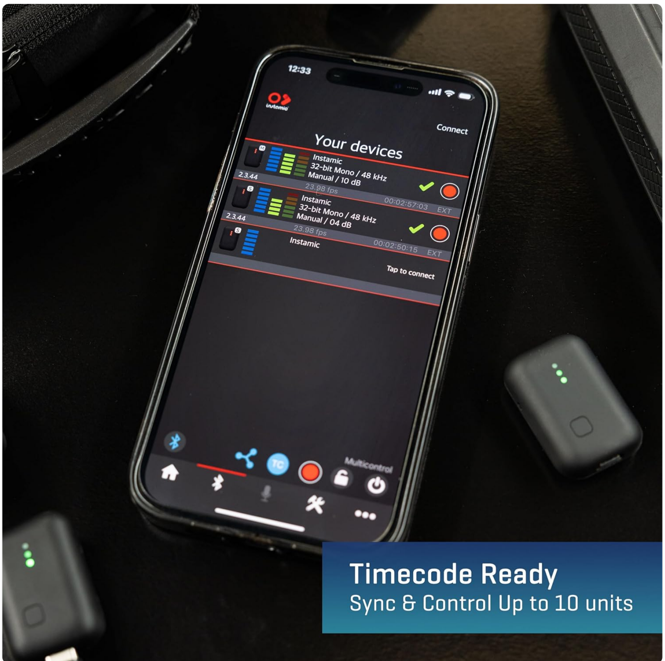
Figure 4: The Instamic app interface for remote control and monitoring.