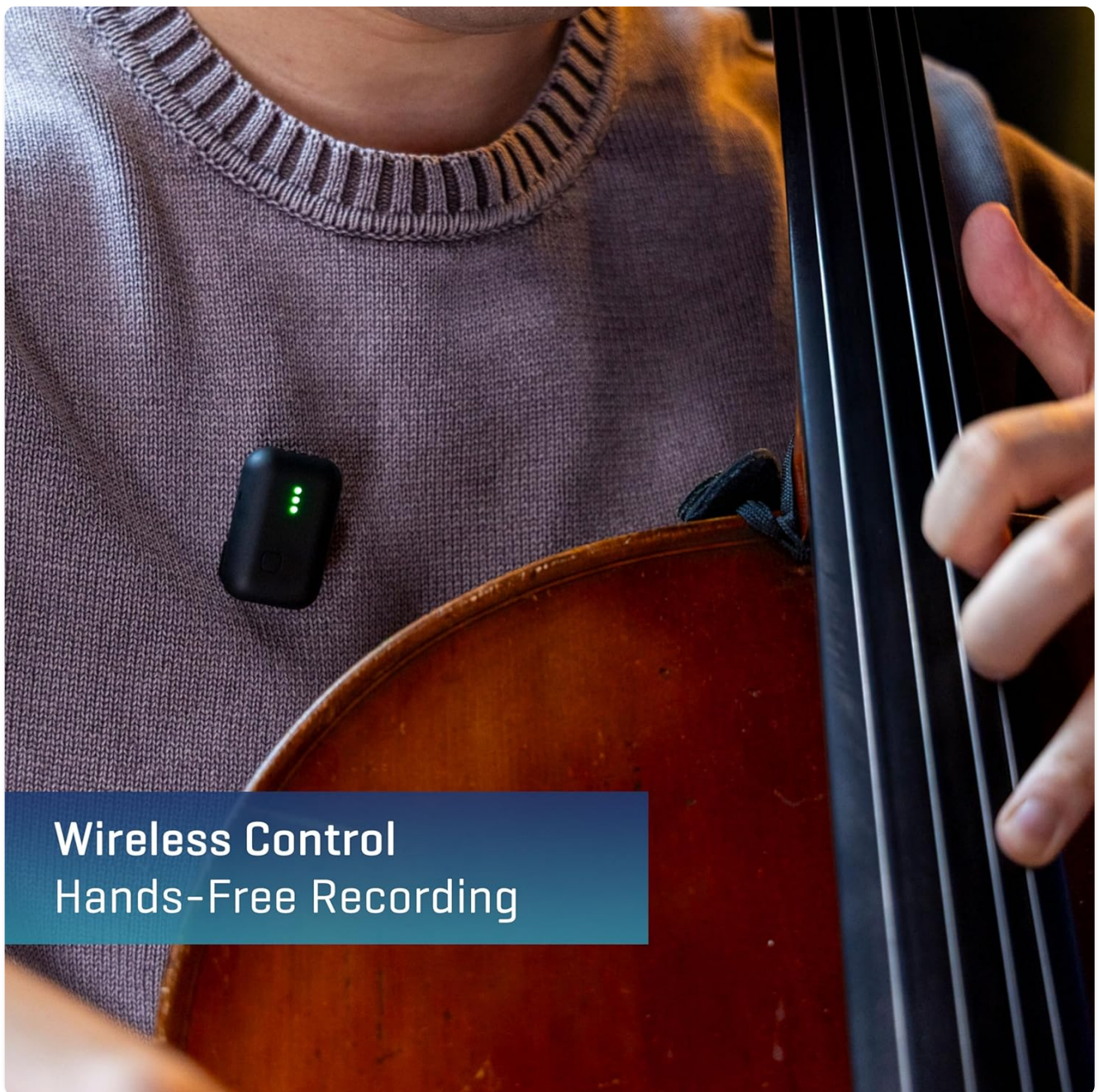
Figure 3: Discreet placement of the Instamic for hands-free recording.