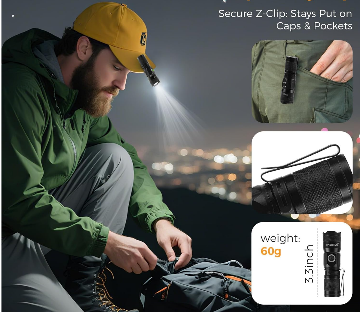
Image 4.3: The UNROEVS X30 Mini Flashlight demonstrating its hands-free headlamp mode by clipping onto a cap, and also showing its portability when clipped to a pocket.

Secure Z-Clip: Stays Put on Caps & Pockets