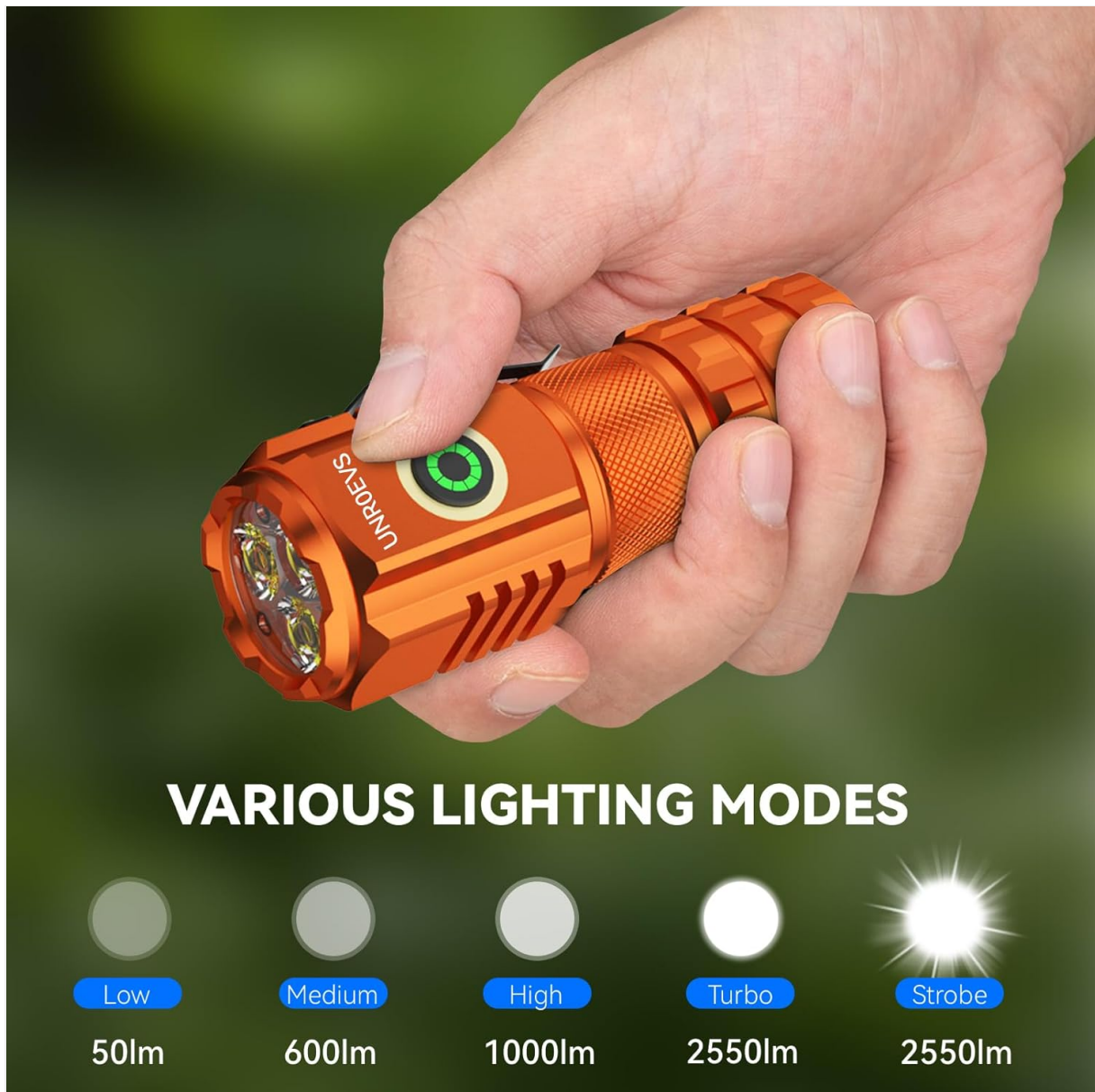
Image 4.1: Illustration of the UNROEVs X30 Mini Flashlight's various lighting modes, including Low (50lm), Medium (600lm), High (1000lm), Turbo (2550lm), and Strobe (2550lm).