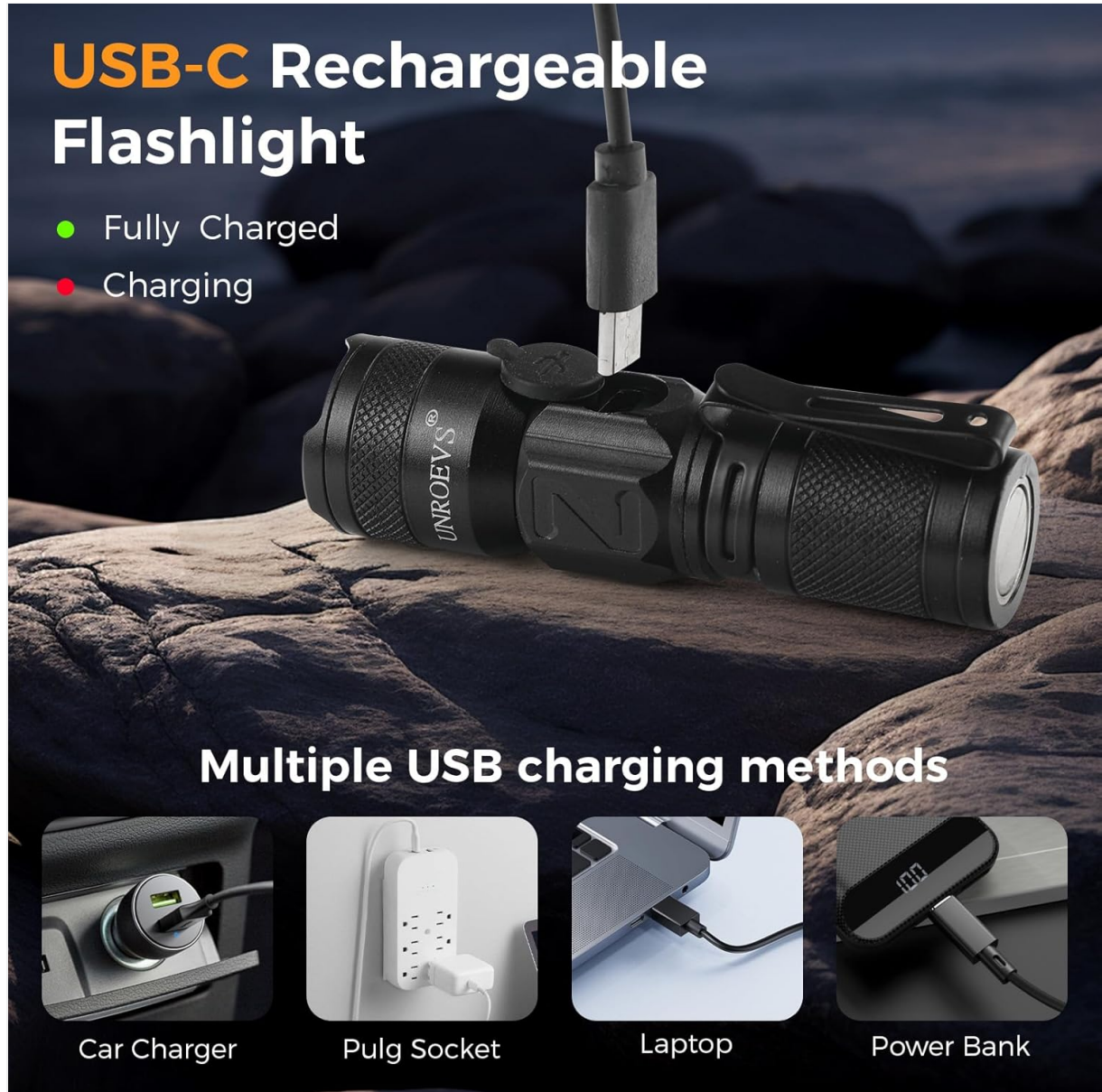
Image 3.1: The UNROEVS X30 Mini Flashlight connected to a USB-C charging cable, demonstrating various charging methods.