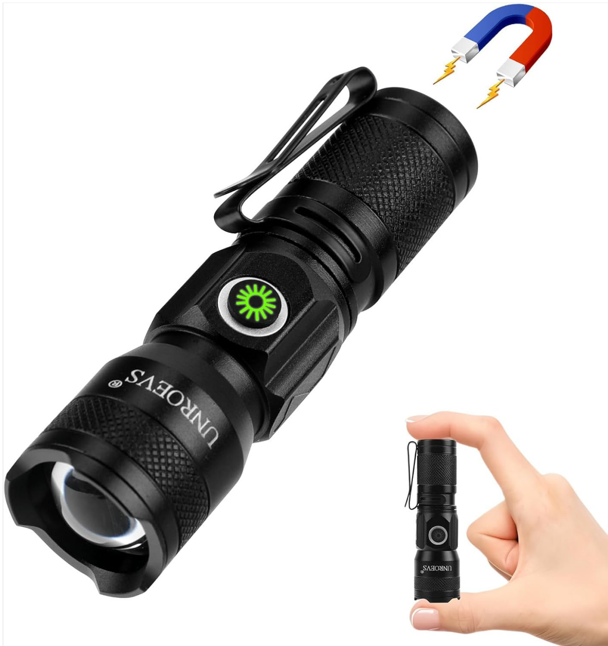
Image 1.1: The UNROEVs X30 Mini Flashlight, showcasing its compact design, side button, and magnetic tail cap.