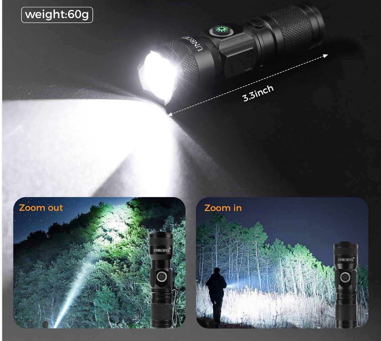
Image 4.2: The UNROEVs X30 Mini Flashlight demonstrating its adjustable zoom feature, showing both wide floodlight (Zoom out) and focused spotlight (Zoom in) capabilities.