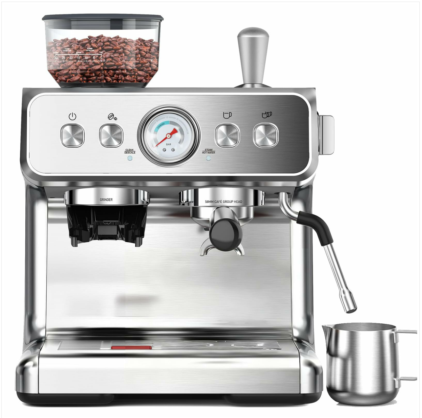
Image: Front view of the COWSAR 15 Bar Espresso Machine, showing the control panel, portafilter, and steam wand.