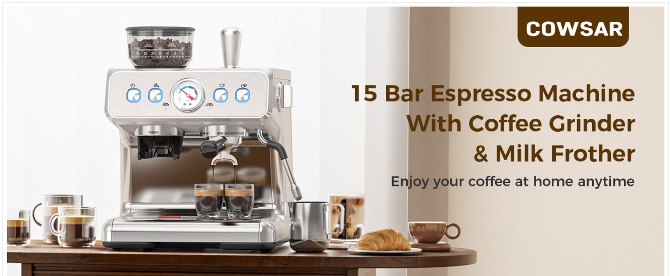
Image: 1 Cup and 2 Cup brew selection buttons. Preheating time is less than 90 seconds.