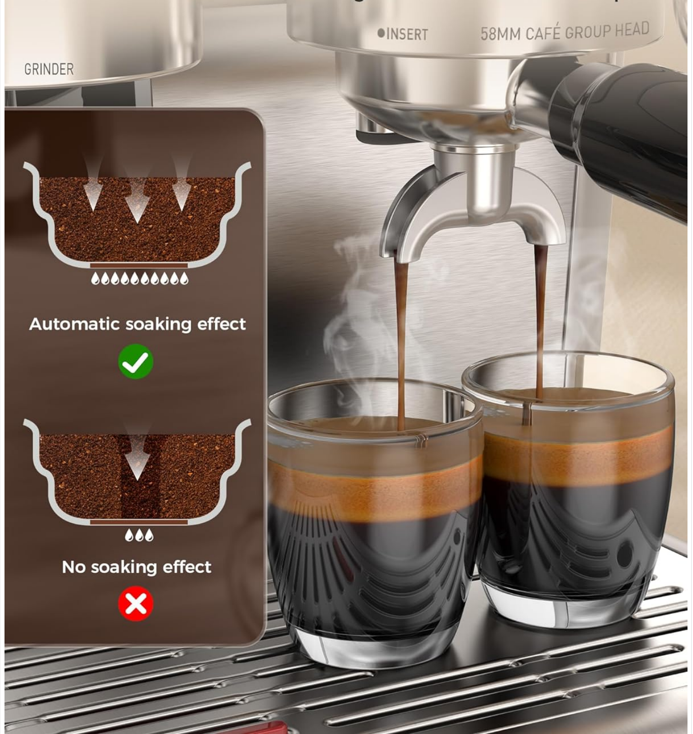
Image: COWSAR Espresso Machine with included accessories: milk jug, 58mm portafilter, tamper, single and dual wall filter baskets, and cleaning brush.

Pre-infusion can make the coffee powder fully absorb water on the surface before extraction, making the extraction more complete.