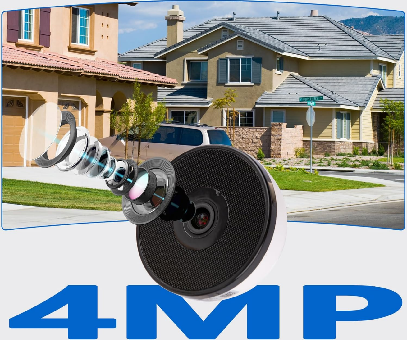
Image: Depiction of the camera's 4MP HD resolution and wide-angle lens for comprehensive coverage.

105° wide-angle lens providing a broad field of view