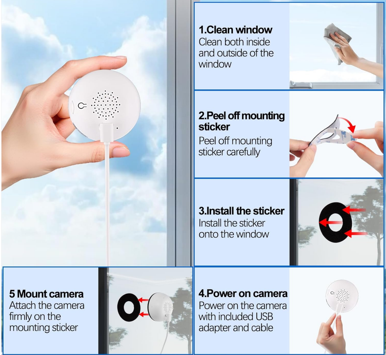
Image: Visual guide for the camera installation process, from cleaning the window to powering on the device.