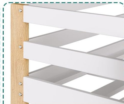
Solid Wood Frame