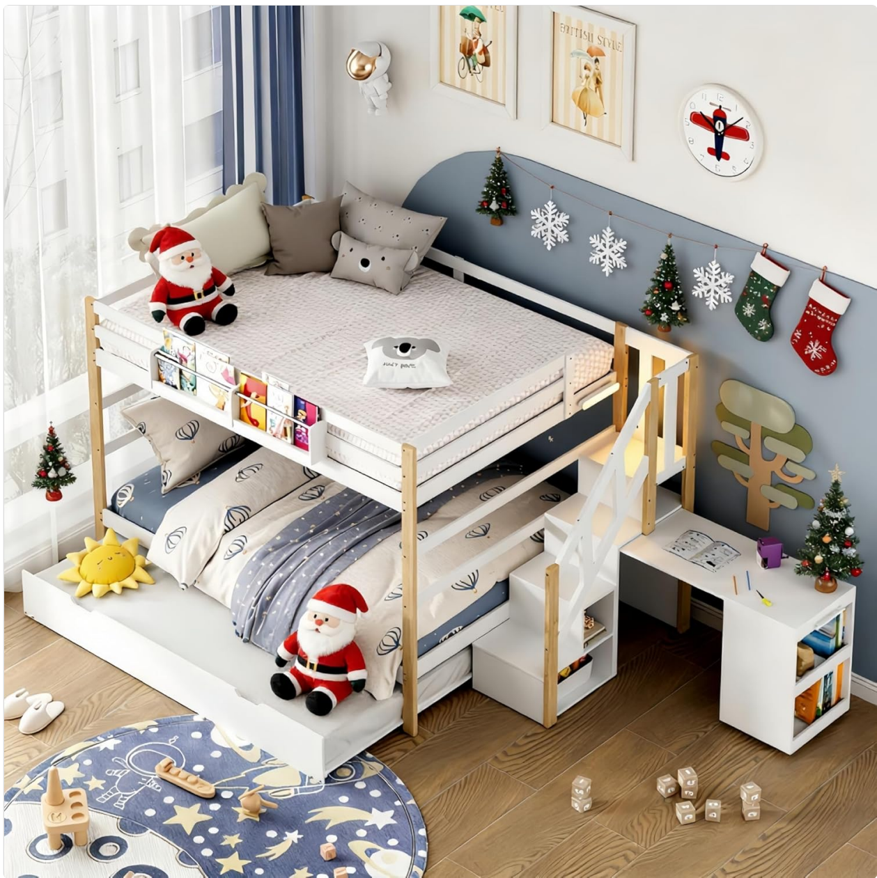
Image 1.1: Overall view of the Kikihouse Full Over Full Bunk Bed with Trundle and Storage Stairs, featuring a white and wood finish, a pull-out trundle, and integrated storage stairs.