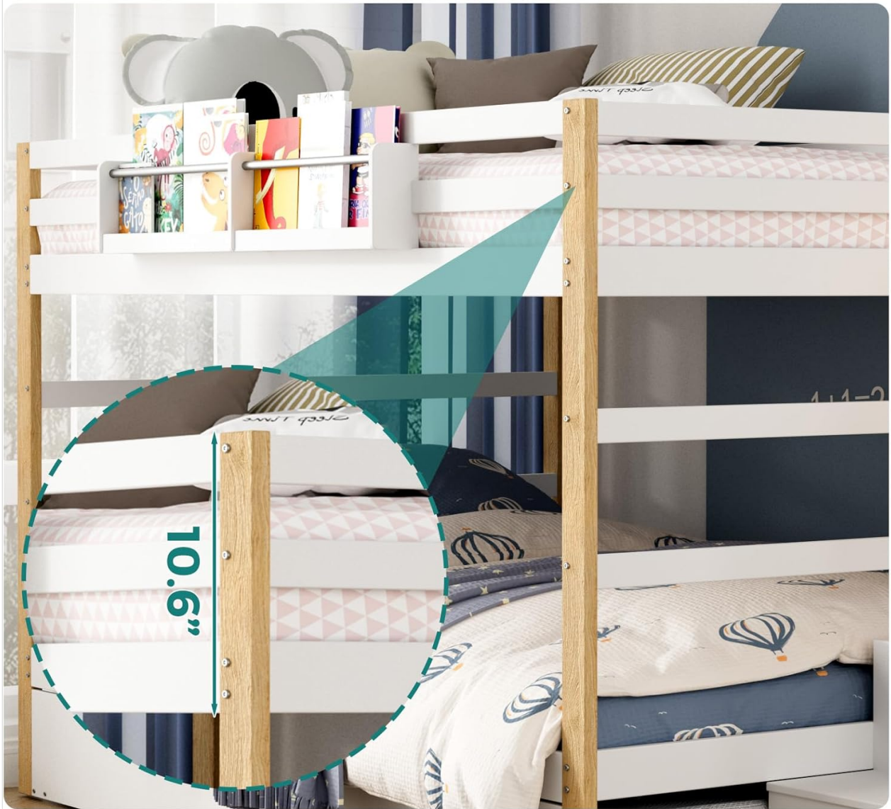
Image 2.2: Close-up view of the 360-degree enclosed safety rail on the top bunk, demonstrating the secure design for safe sleeping. The image also indicates a recommended mattress height of 10.6 inches below the top of the rail.