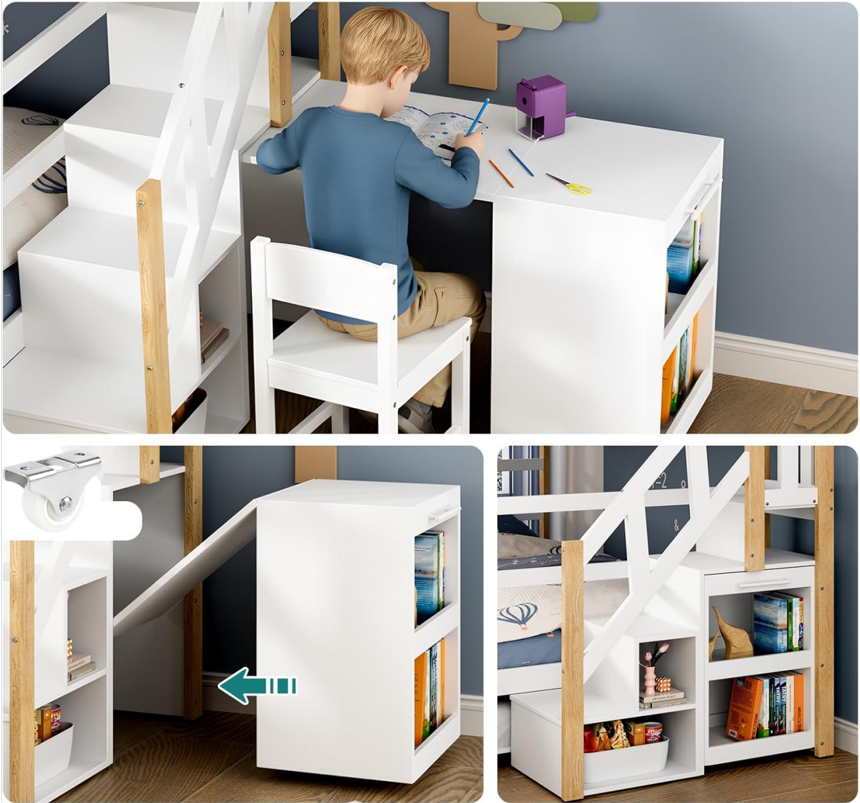
Image 5.2: A child using the pull-out foldable desk, demonstrating its functionality as a compact workstation for various activities.