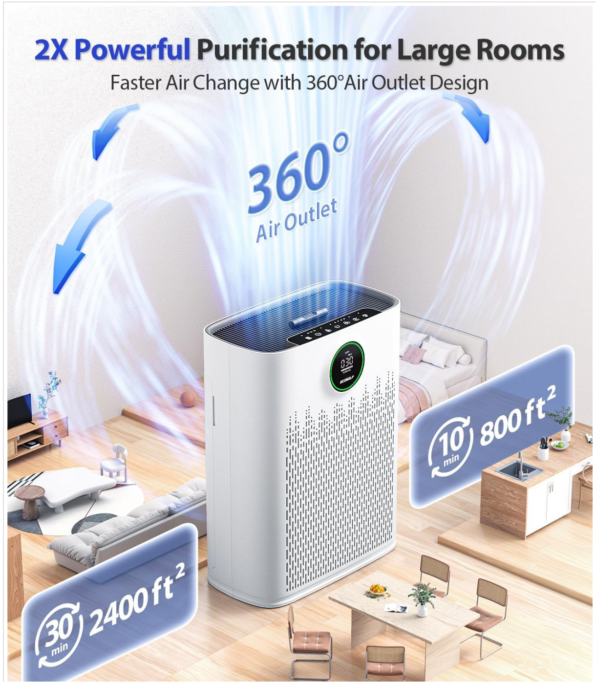
Image: Top view of the ECOSELF HAP603WF air purifier showing the touch control panel with buttons for power, fan speed, timer, child lock, auto mode, and light control. The central LED display shows PM2.5 levels and filter life.

The top panel features touch controls and an LED display for real-time air quality monitoring and settings adjustment.