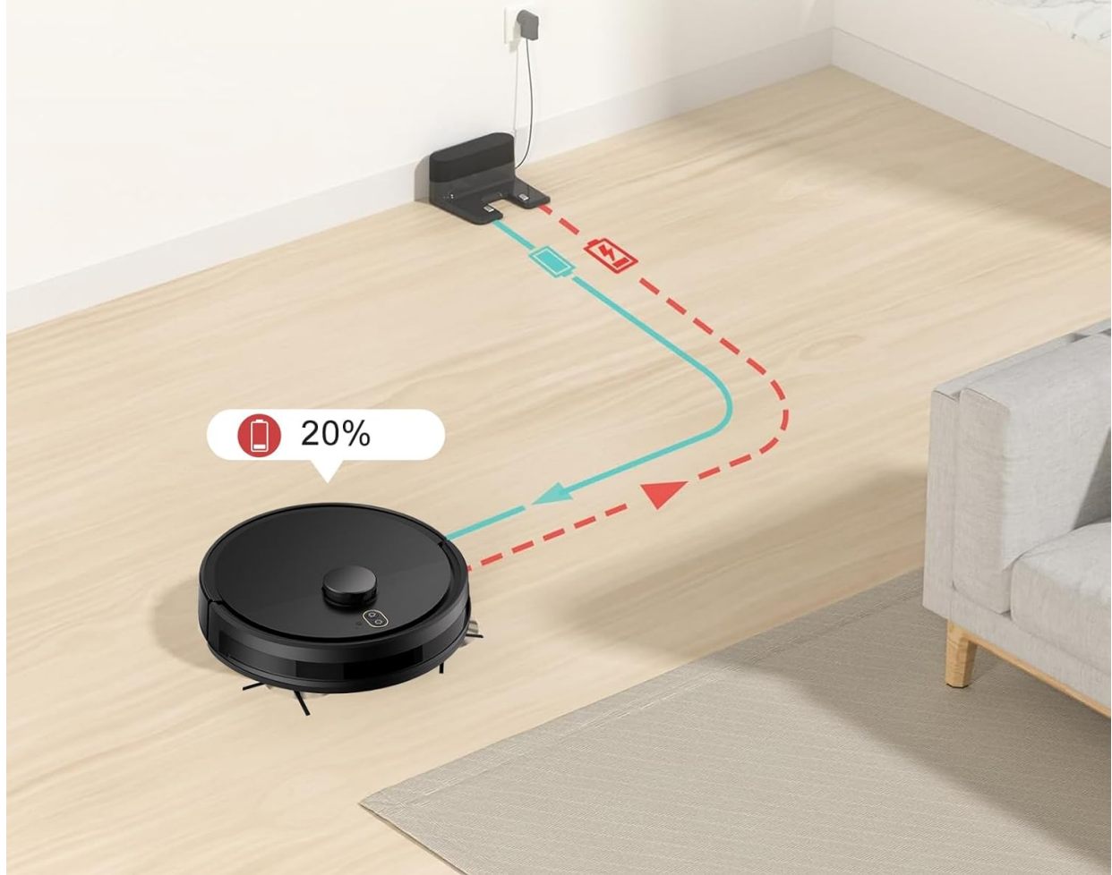
Image 6: The Yigars Y580 Robot Vacuum Cleaner automatically returning to its charging dock when the battery level drops to 20%, then resuming cleaning from its last position after recharging.

It will automatically recharge when the battery level drops to 20%, then return to its original location to resume cleaning once fully charged.