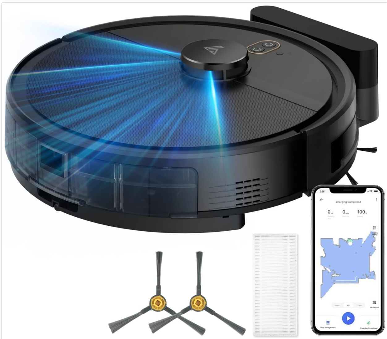
Image 1: The Yigars Y580 Robot Vacuum Cleaner, including the main unit, charging dock, two pairs of side brushes, and an extra high-efficiency filter.