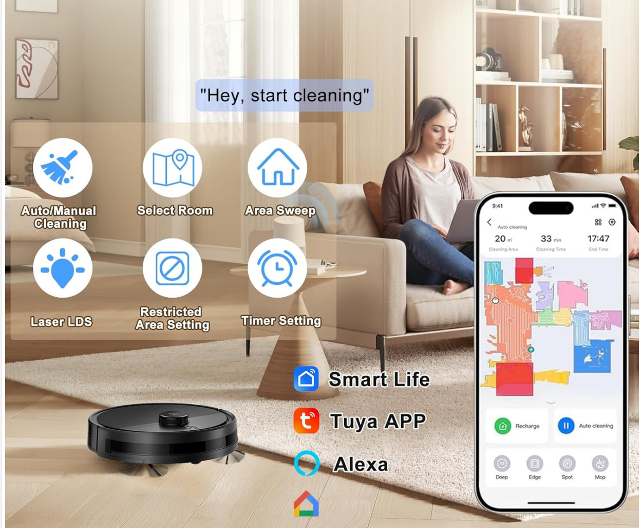
Image 3: The Yigars Y580 Robot Vacuum Cleaner demonstrating app and voice control capabilities, compatible with 2.4GHz Wi-Fi networks, Smart Life, Tuya APP, and Alexa.

Need to connect WiFi, only support 2.4GHz network