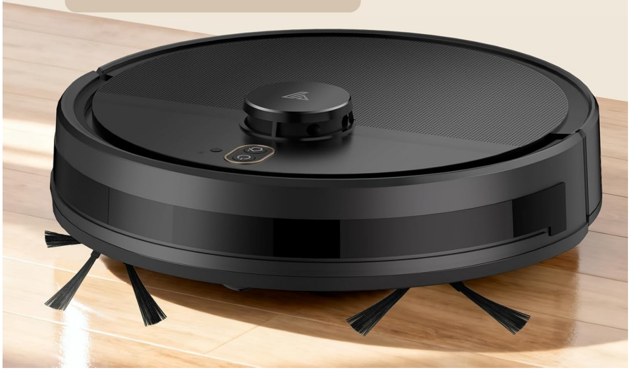
Image 8: The Yigars Y580 Robot Vacuum Cleaner supports automatic firmware and software updates (OTA) to ensure continuous improvement and new features.