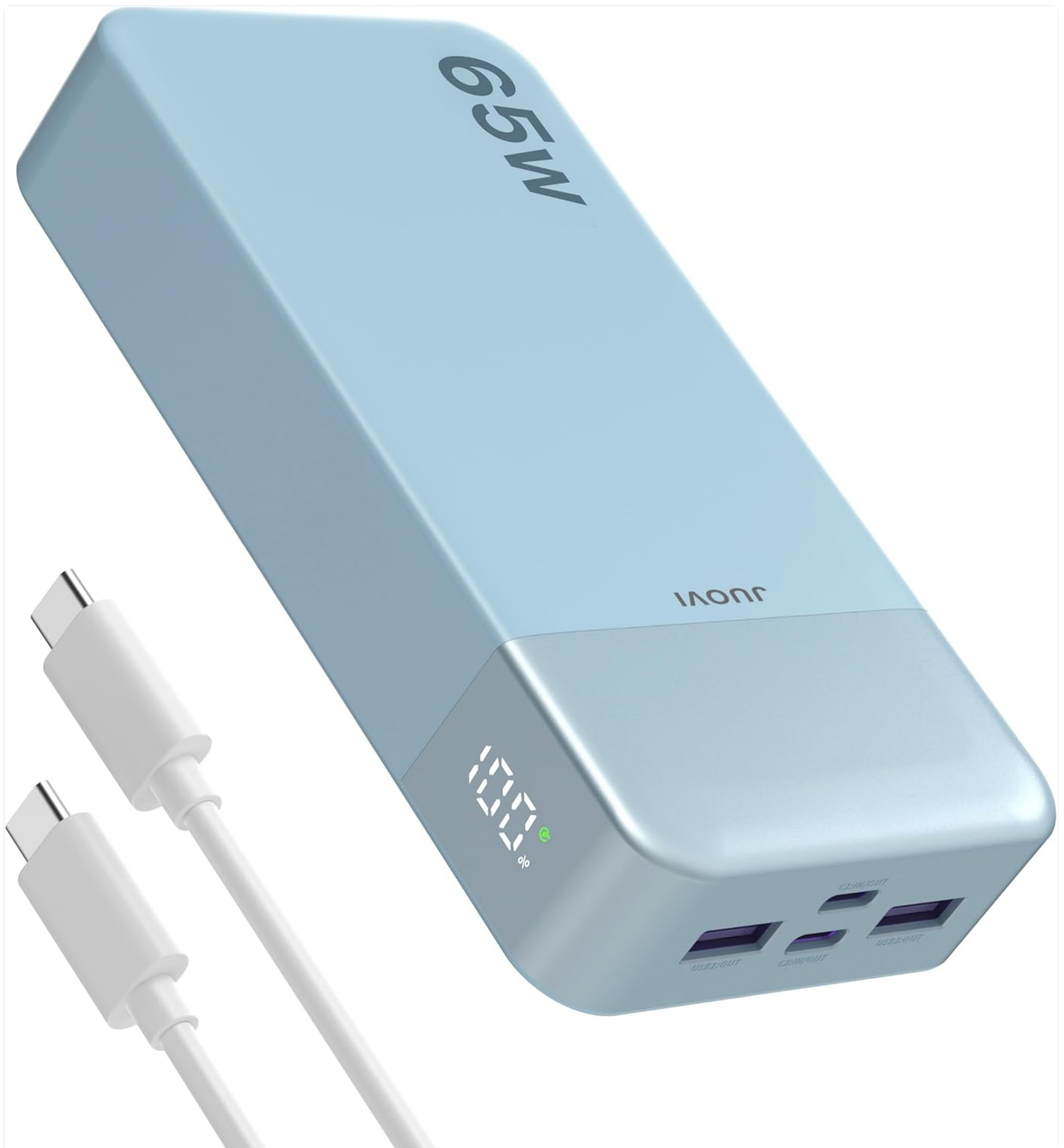
Image: Front view of the JUOVI 65W 20000mAh Power Bank, highlighting its compact design and digital display.