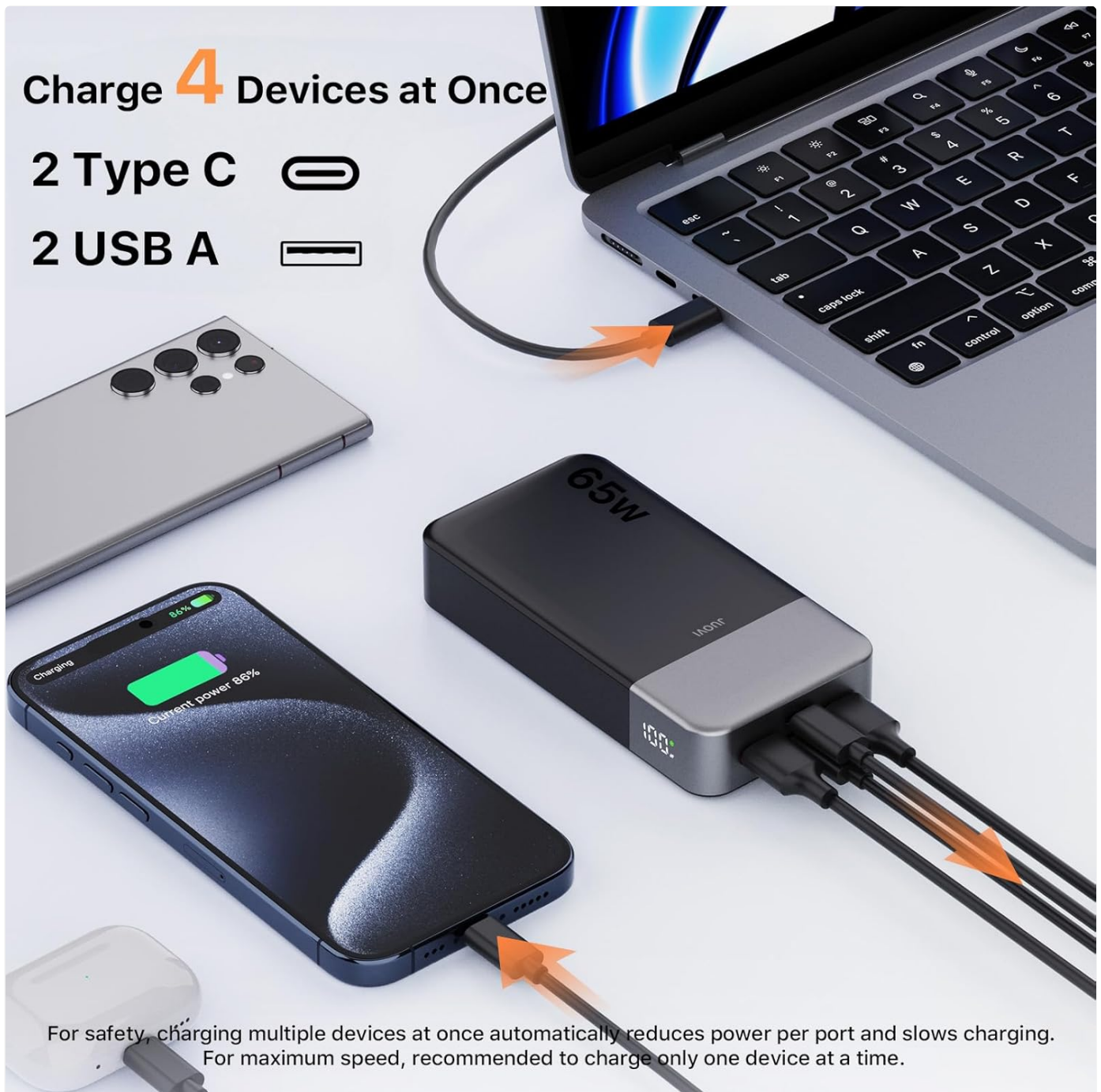
Image: The power bank connected to multiple devices, demonstrating its ability to charge up to four devices concurrently.