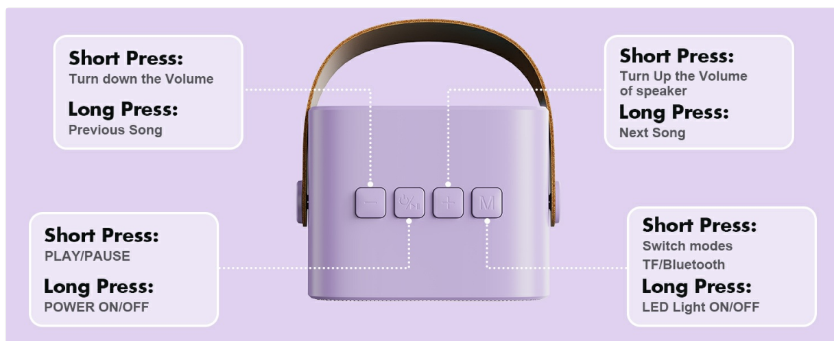
Image: Detailed diagram of the microphone controls and their functions.