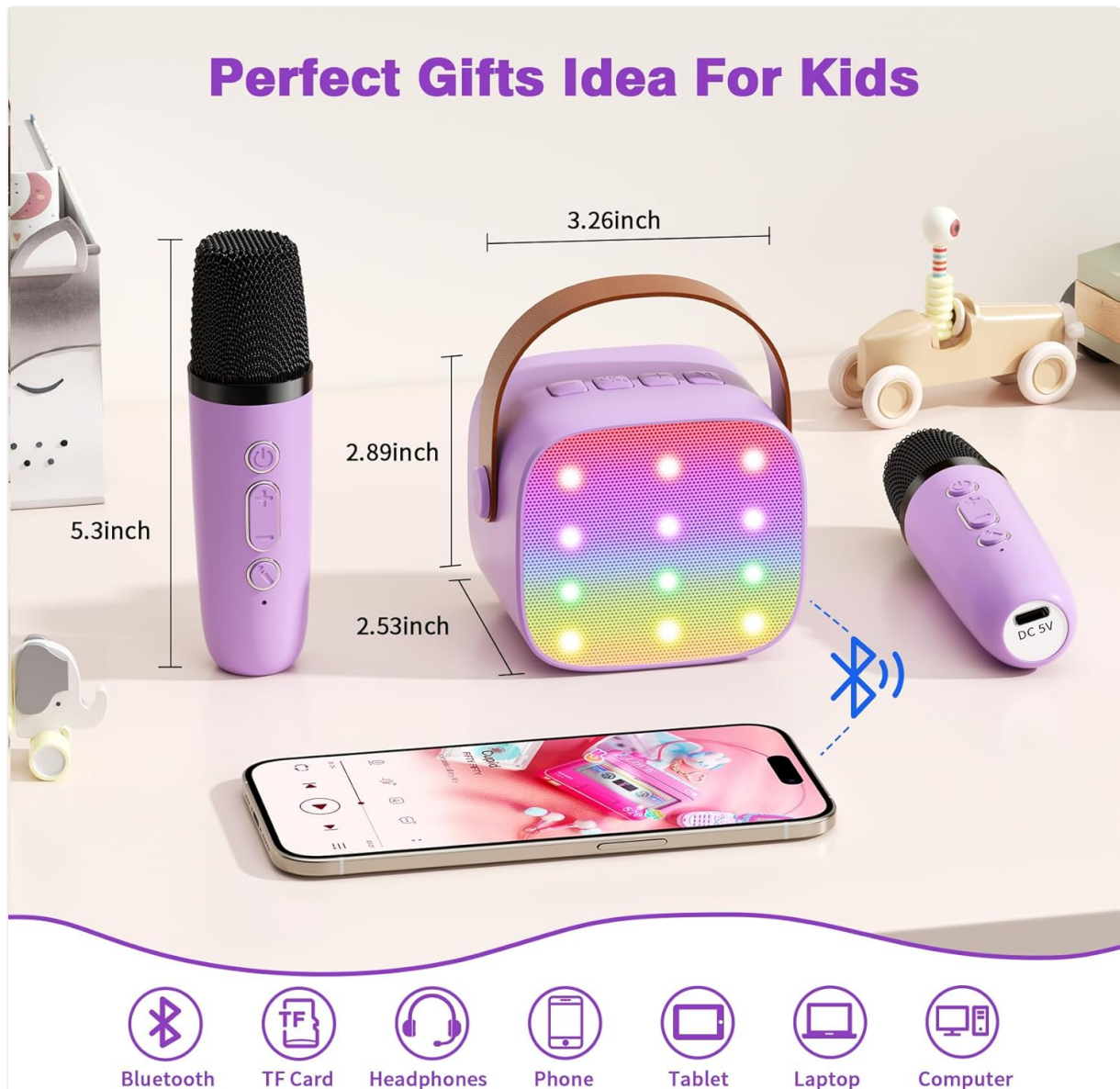
Image: Close-up of the two wireless microphones, highlighting their design and controls.

Two wireless microphones are included, allowing for duets or shared singing. Each microphone has independent controls for volume, echo, and voice effects.