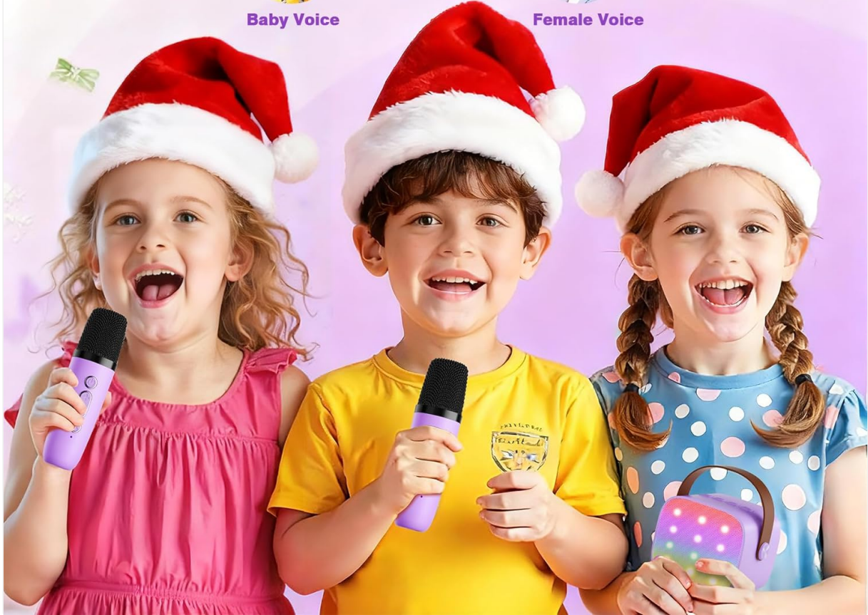
Image: The voijump Mini Karaoke Machine, including the main speaker unit and two wireless microphones.