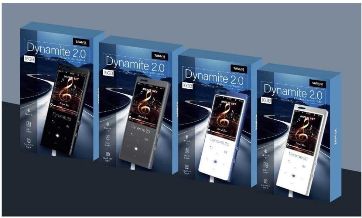
Figure 4.1: Front view of the Samvix Dynamite 2.0 MP3 Player, showing the screen and touch buttons.