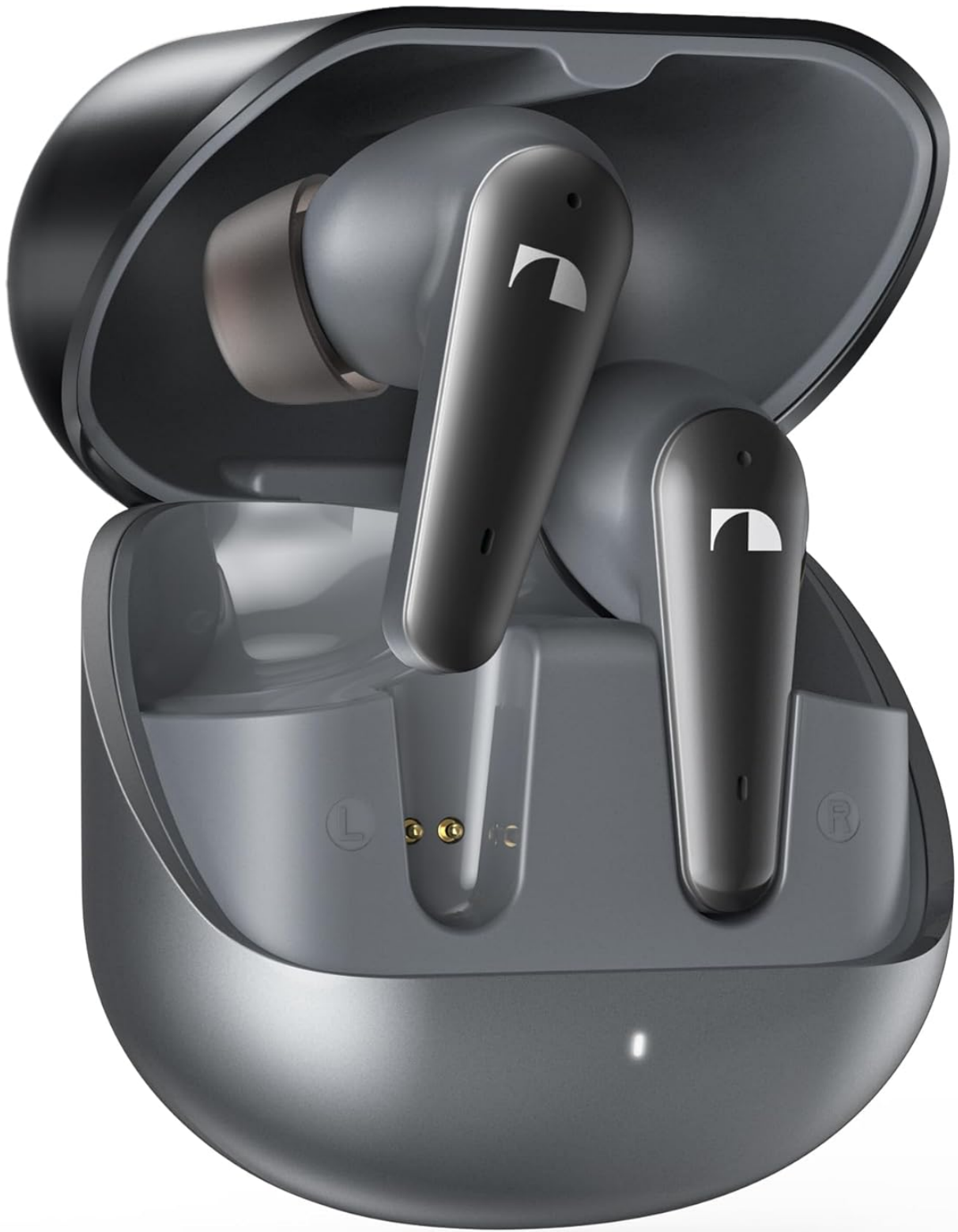
Image: Nakamichi TW130NC Wireless Earphones in their charging case, showcasing the sleek design.