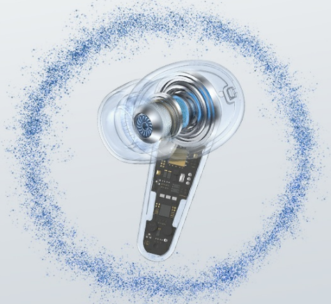
Image: Diagram illustrating the ergonomic design for a comfortable and stable fit in the ear.

低音が不足していると感じる場合や、音楽のジャンルによっては低音を強調したい場合に、バスブースト機能を活用することで、ワンタッチで迫力の重低音を体験できます。