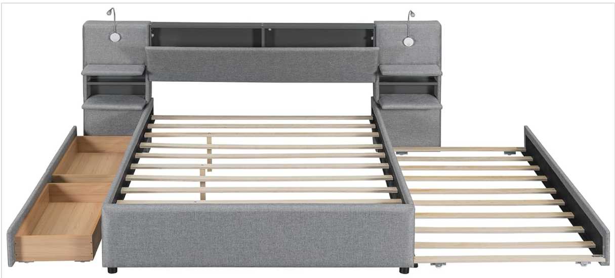
Figure 3: Trundle bed and storage drawers extended, illustrating their mechanism.