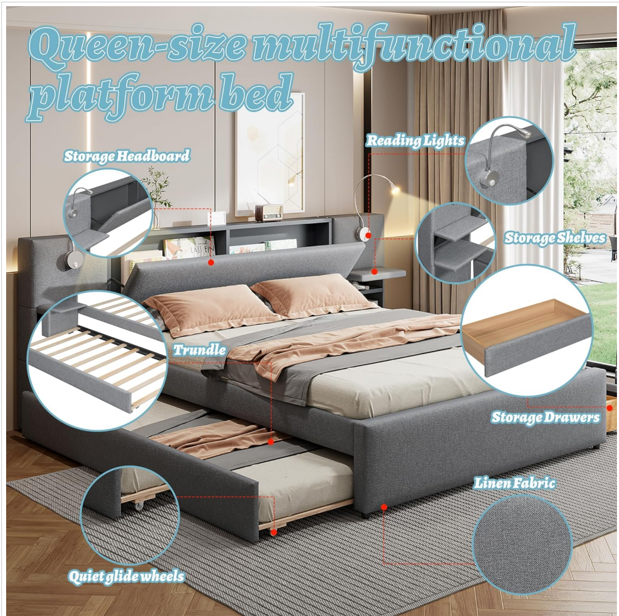
Figure 4: Key features of the OYUMOENTS Queen Bed.

This bed frame offers several integrated features for convenience and space optimization.