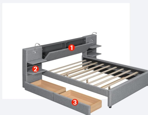
Figure 6: Various storage options including headboard, shelves, and drawers.