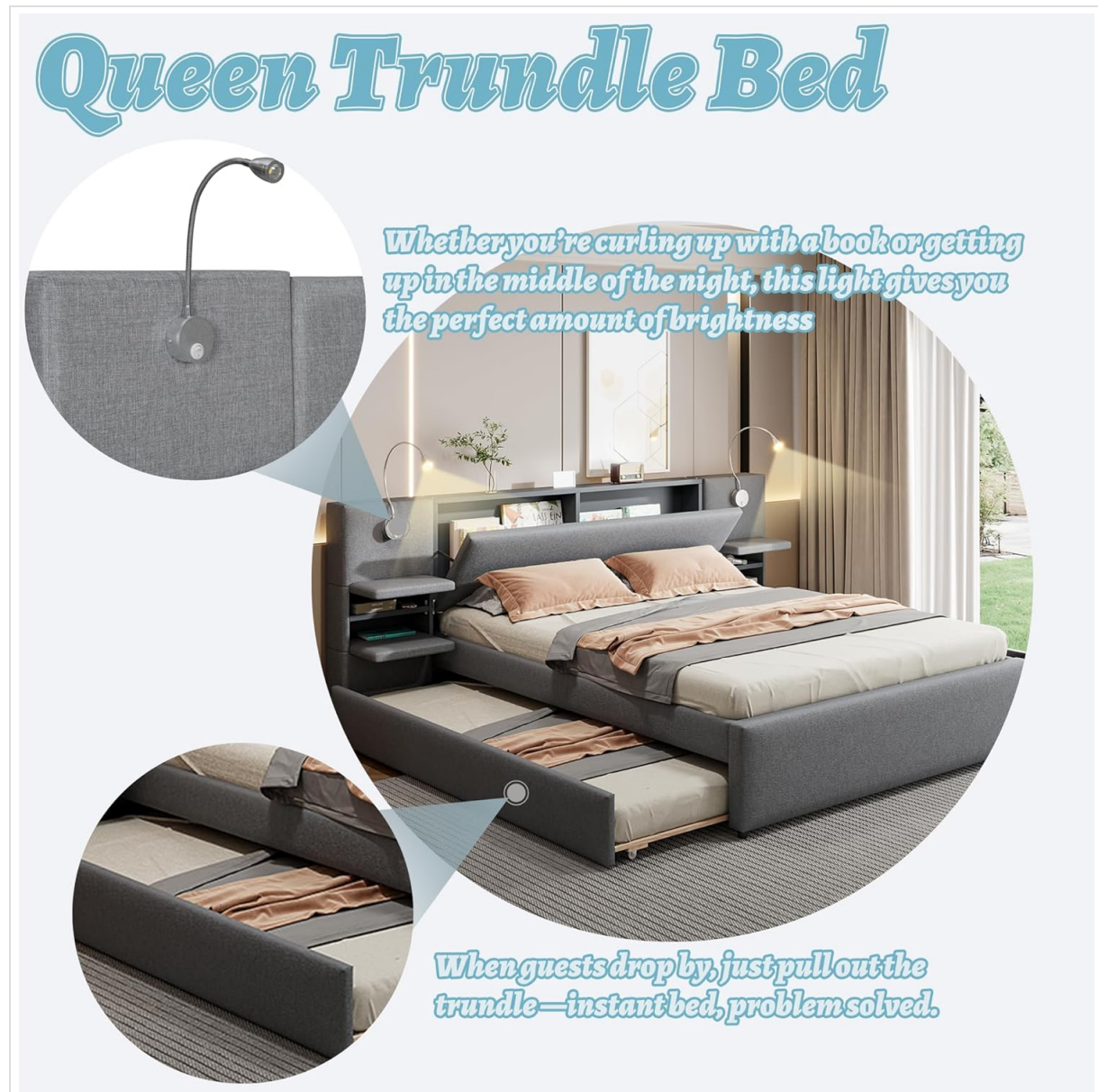
Figure 5: Trundle bed extended and reading light detail.

The trundle bed is designed to slide out smoothly from beneath the main queen bed frame. To use, gently pull the trundle frame outwards from the foot of the bed. The trundle is equipped with quiet glide wheels for easy movement. To store, push the trundle back into its compartment until it is fully recessed under the main bed.