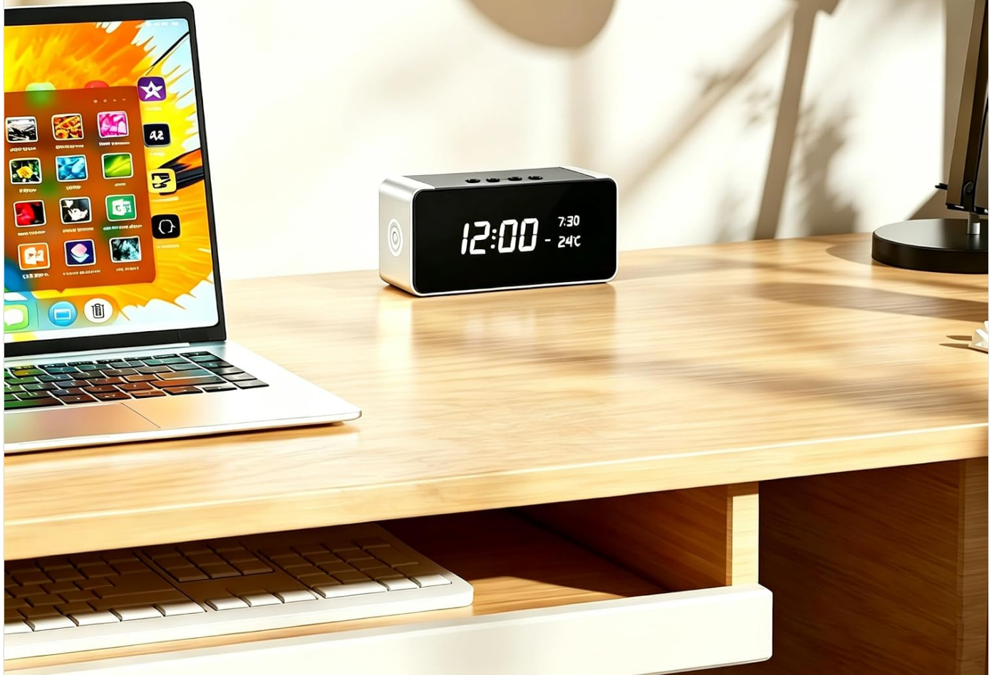
Image: The hidden camera clock displayed on a desk next to a laptop, highlighting its multiple functions as an alarm clock, thermometer, and security camera.