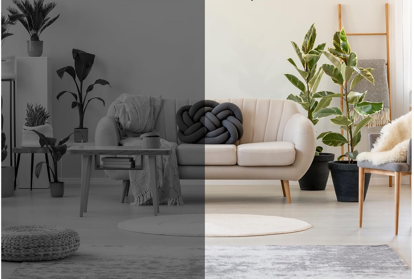
Image: A split image demonstrating the difference between day mode and night mode viewing from the camera, highlighting its night vision feature.