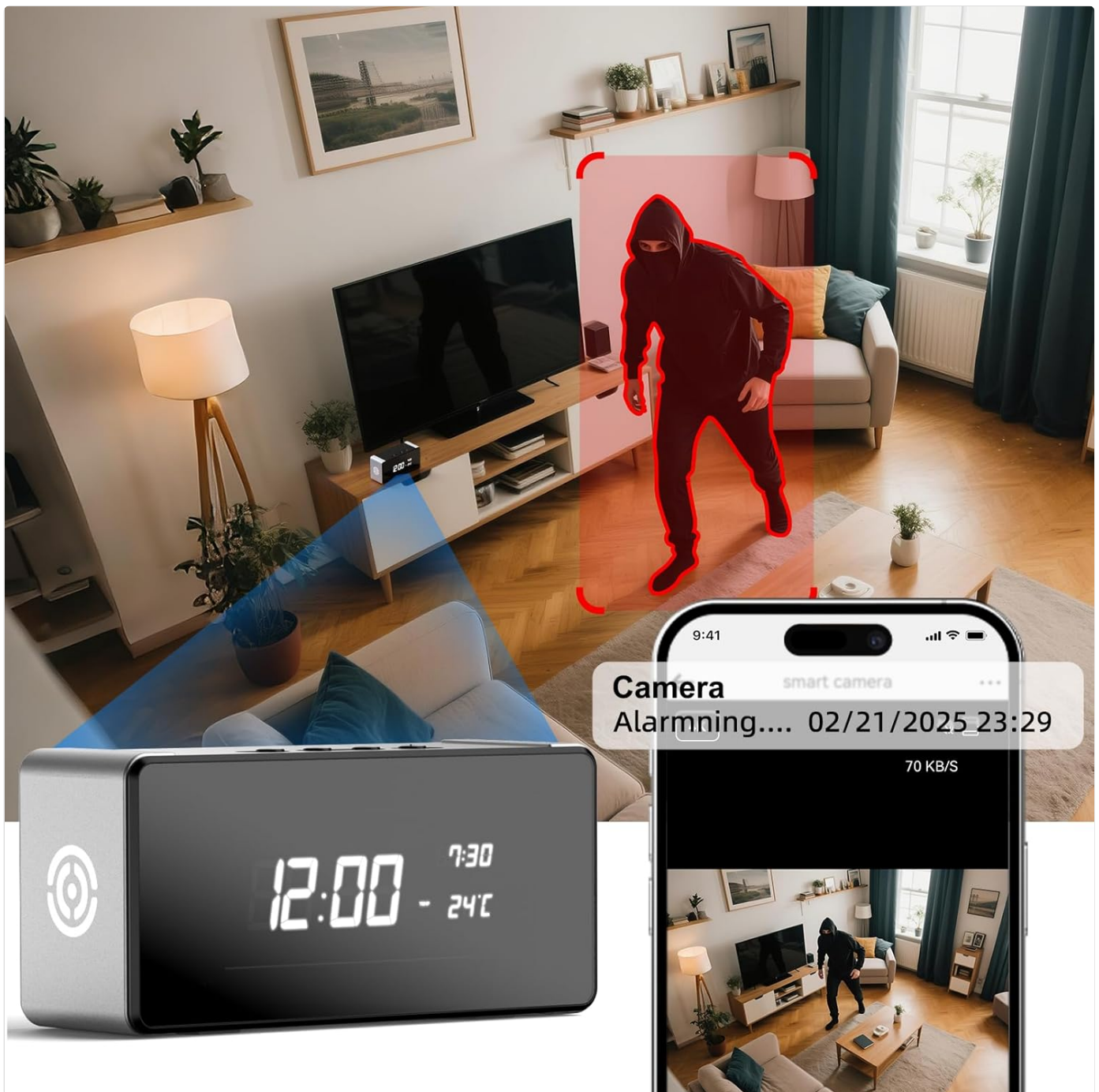
Image: An illustration showing the hidden camera clock detecting motion (a person) and sending an alert to a smartphone.