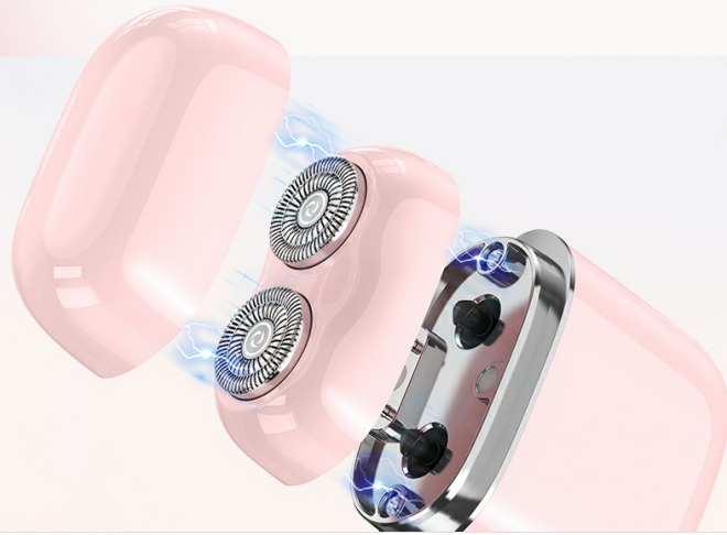
Image: A close-up view showing the magnetic head of the facial hair remover detaching from the main unit, highlighting the ease of removal and attachment.

Snap on & off effortlessly for easy cleaning and storage