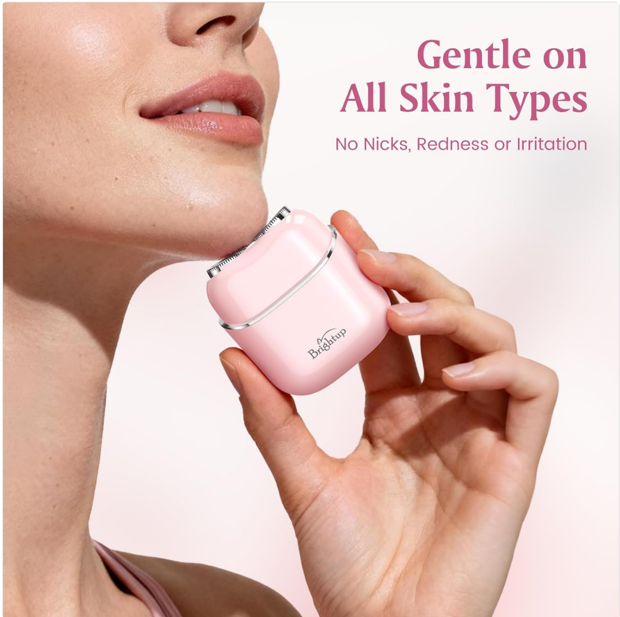
Image: A close-up of the Brightup Facial Hair Remover's dual-ring curved mesh and floating head, designed for fast, effective, and painless hair removal.

Gently glide the dual floating head with its curved double-ring mesh over the desired areas of your face, such as the upper lip, chin, cheeks, and forehead. The shaver is designed to capture and cut even the finest hairs in one stroke, ensuring a close and comfortable shave. The built-in LED light illuminates fine hairs for thorough removal.