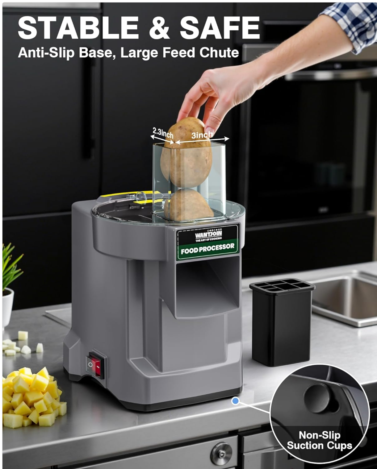
Image 3.1: The appliance positioned on a countertop, highlighting the large feed chute and non-slip suction cups for stable operation.