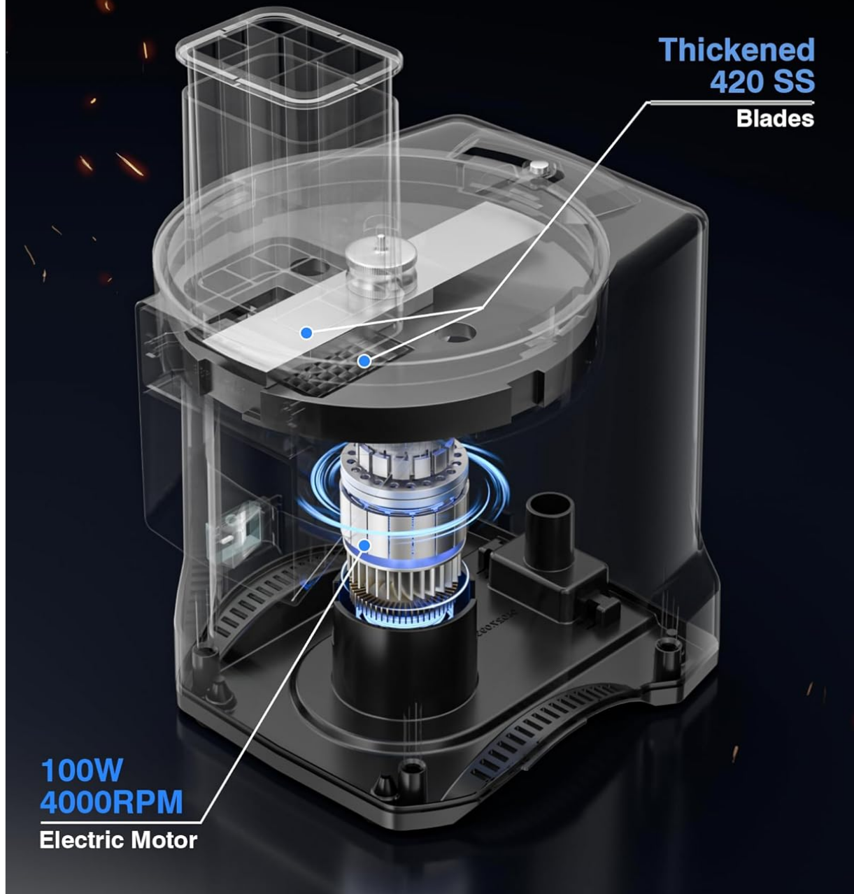
Image 2.3: An internal diagram highlighting the 100W 4000RPM motor and thickened 420 stainless steel blades.