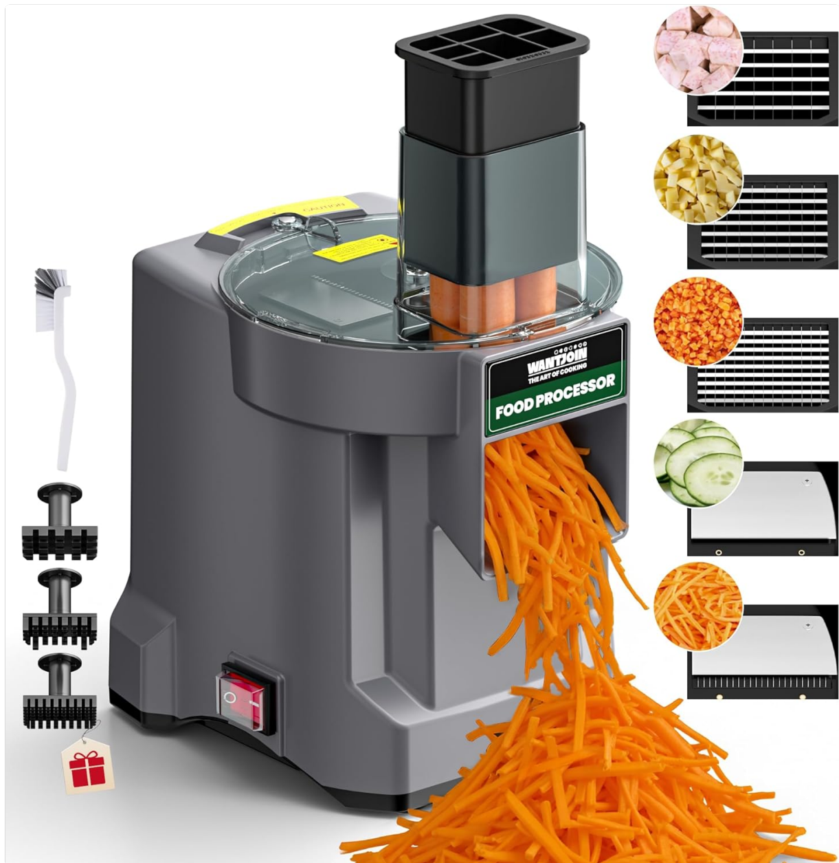
Image 2.1: The WantJoin 5-in-1 Electric Vegetable Chopper showing its main unit, various blade types, and cleaning tools.