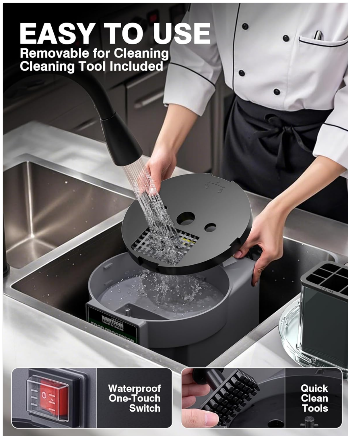
Image 5.1: The removable parts of the chopper being cleaned under running water in a sink, demonstrating the use of cleaning tools for thorough maintenance.