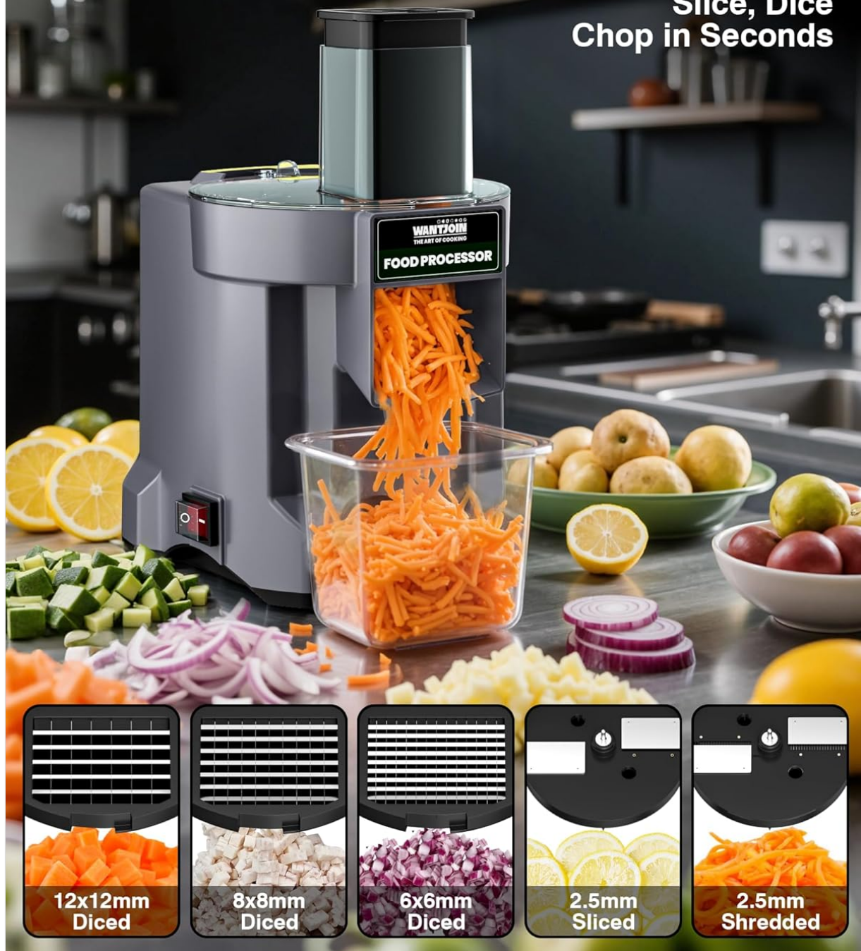
Image 2.2: Visual representation of the 5-in-1 functions, including different dicing sizes, slicing, and shredding.