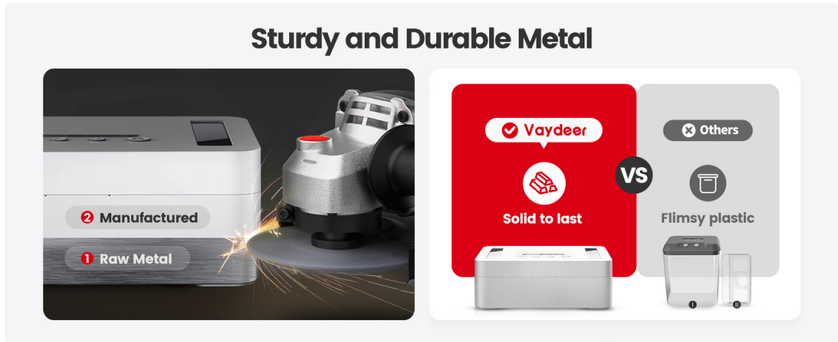
Image: Illustration highlighting the sturdy and durable metal construction of the lock box.