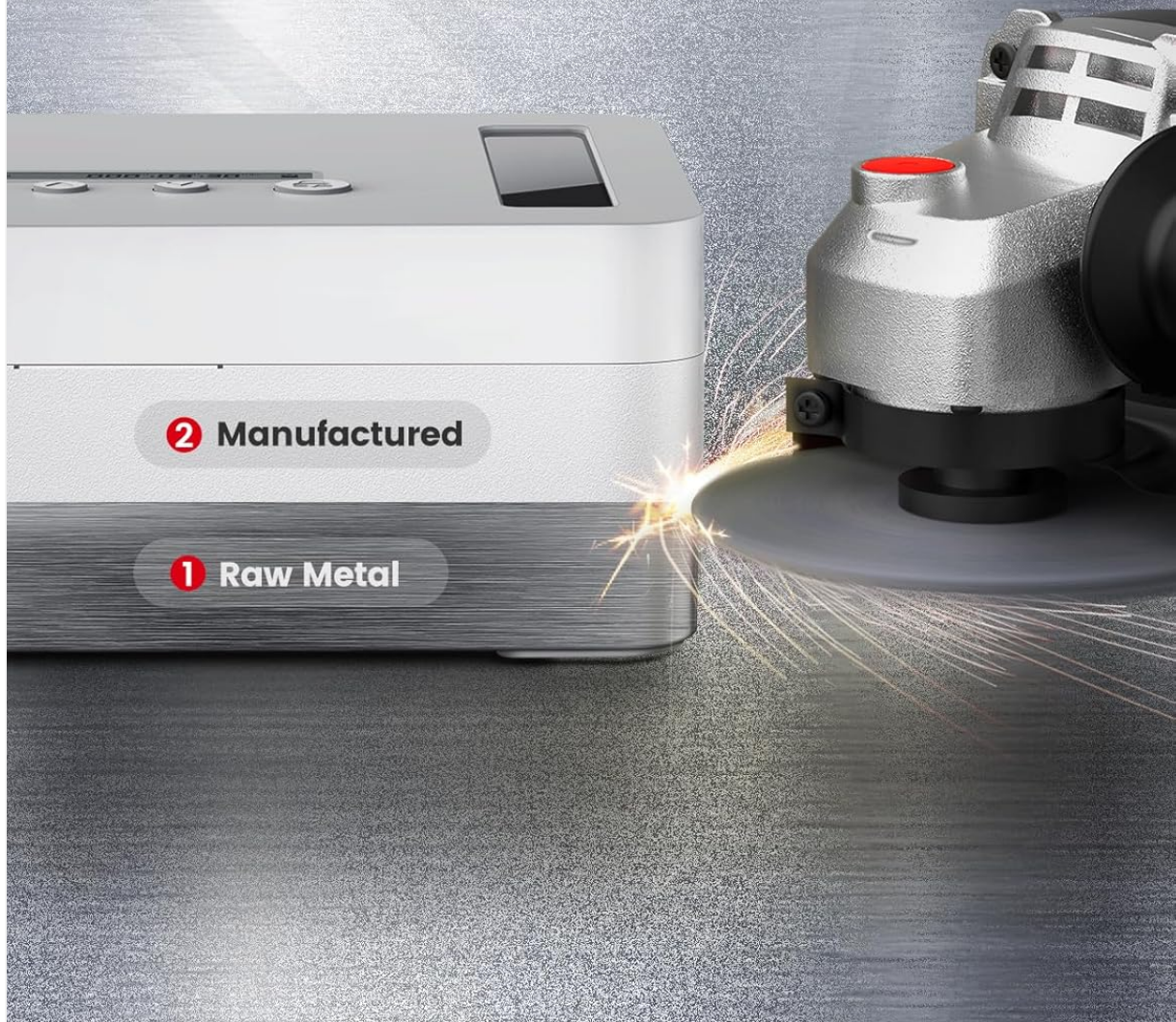
Image: Top-down view of the Vaydeer Metal Timed Lock Box, showcasing its sleek design and control panel.