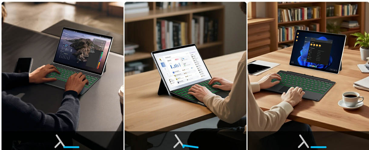
Image: Backlight color and brightness adjustment.