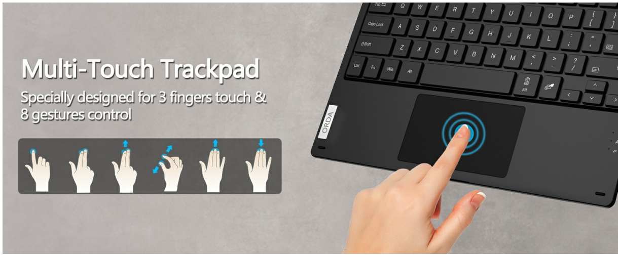
Image: Multi-functional trackpad gestures.