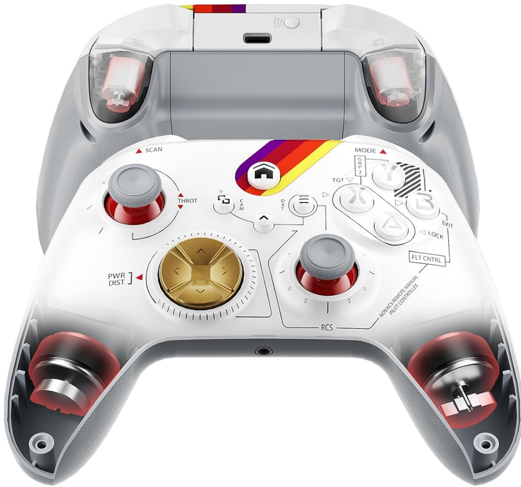
Image Description: A transparent view of the Dinosoo Wireless Controller, revealing the internal placement of four rumble motors, two in the main body and two within the triggers, designed for enhanced vibration feedback.