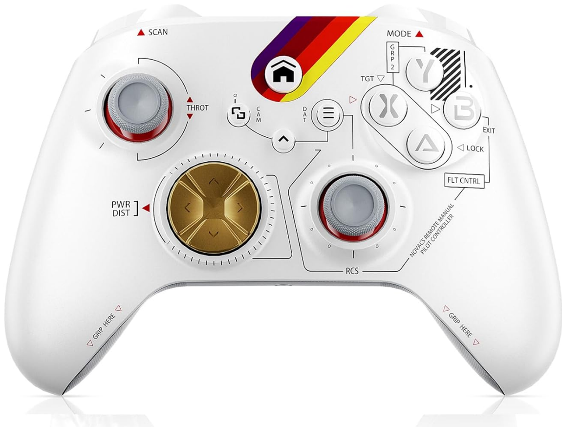
Image Description: An image of the Dinosoo Wireless Controller with an overlay text instructing users to upgrade their controller if connection issues arise, providing the upgrade program download URL: we.tl/t-QpFRxaI2Mc .

Upgrade program download URL: we.tl/t-QpFRxaI2Mc See the list video for upgrade instructions (very easy to follow)