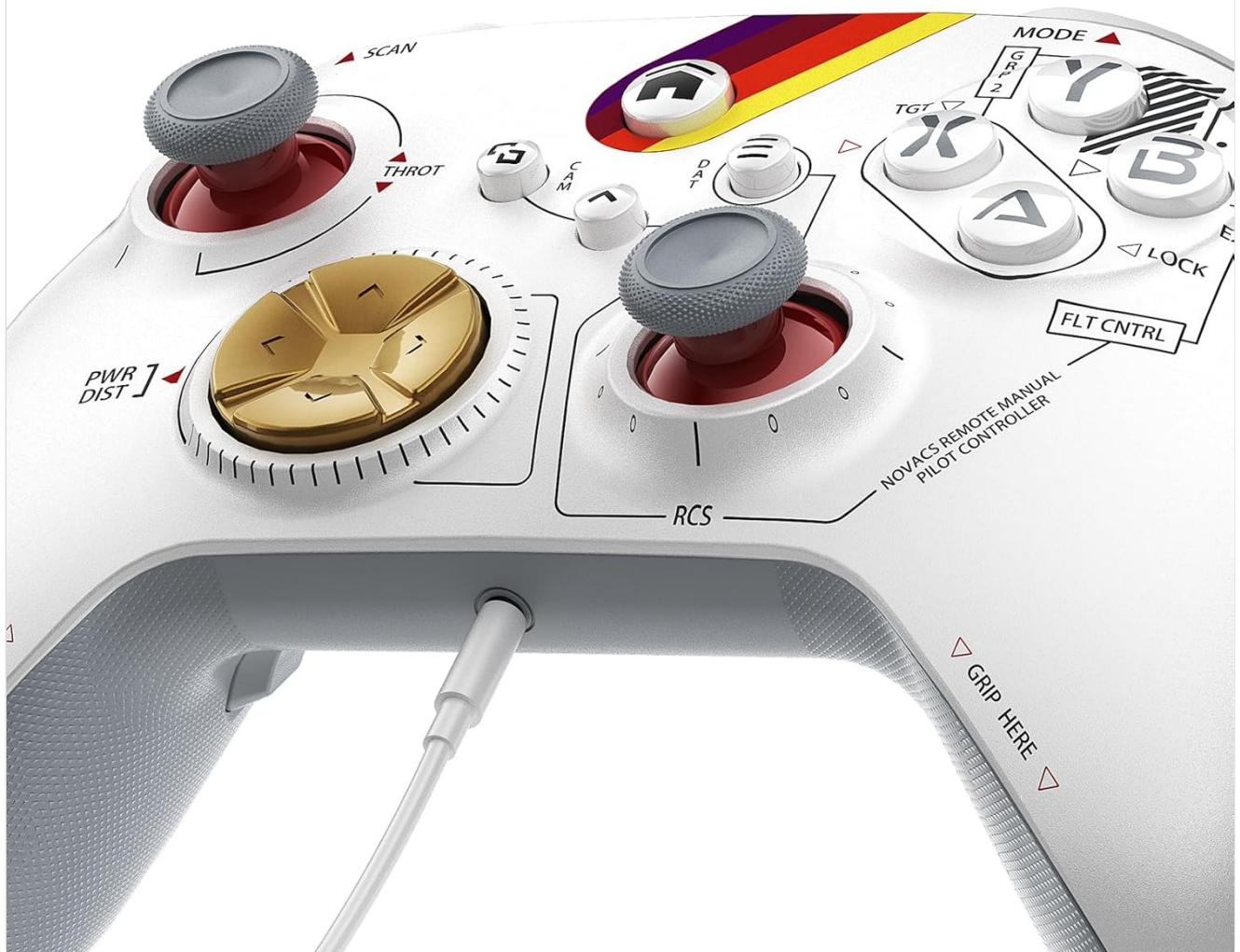
Image Description: A close-up view of the Dinosoo Wireless Controller showing a 3.5mm audio cable plugged into the headphone jack located at the bottom of the controller.

for convenient use of your favorite earphones or headset