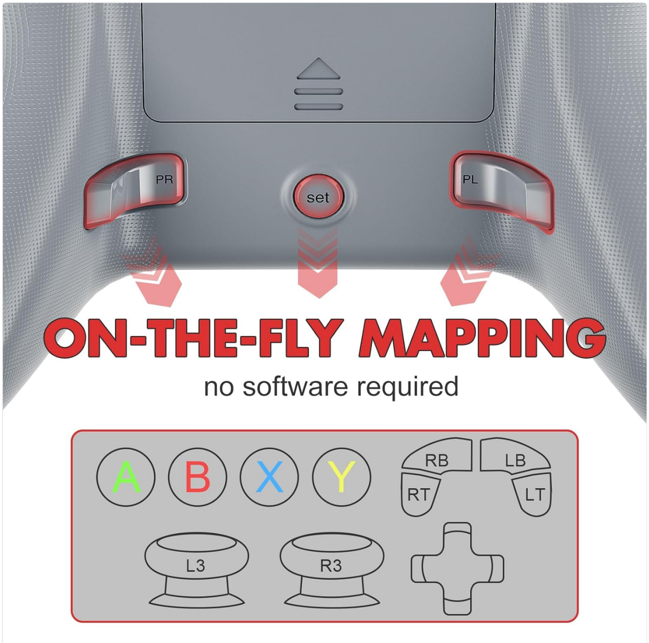
Image Description: A view of the Dinosoo Wireless Controller from the back, highlighting the PL (left paddle), PR (right paddle), and SET buttons. An accompanying diagram illustrates which front-facing buttons (A, B, X, Y, RB, LB, RT, LT, L3, R3, D-pad) can be mapped to these back paddles.