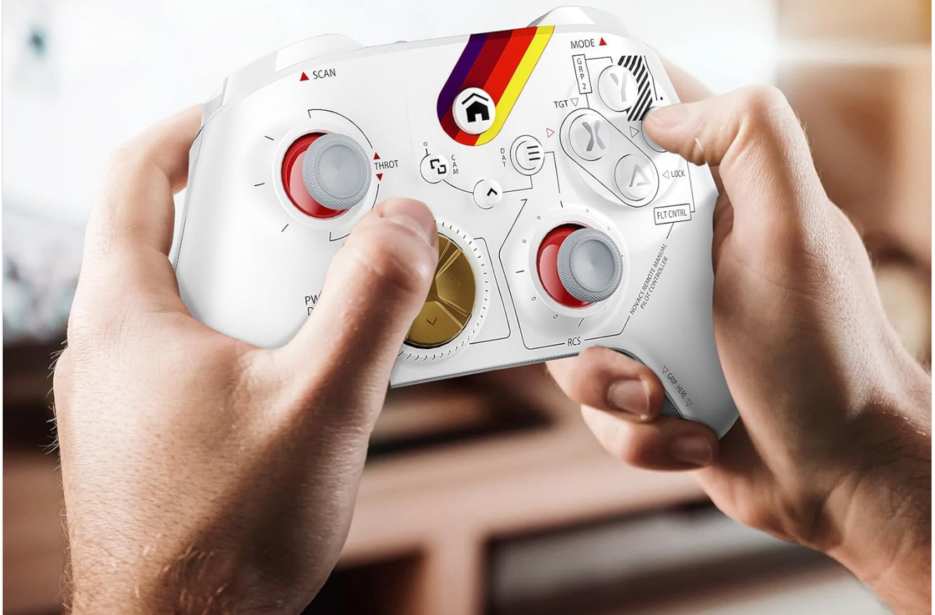
Image Description: An image showing the Dinosoo Wireless Controller being held, with icons above it indicating compatibility with Xbox Series X, Xbox Series S, Xbox One, Windows 10/11, and iOS/Android devices.