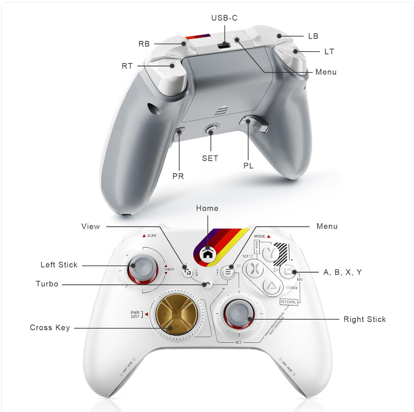
Image Description: A detailed diagram of the Dinosoo Wireless Controller, highlighting and labeling all buttons and ports, including the Left Stick, Right Stick, Cross Key (D-pad), A/B/X/Y buttons, LB/RB/LT/RT triggers, View, Menu, Home, Turbo, USB-C port, and the PR/PL programmable buttons on the back.